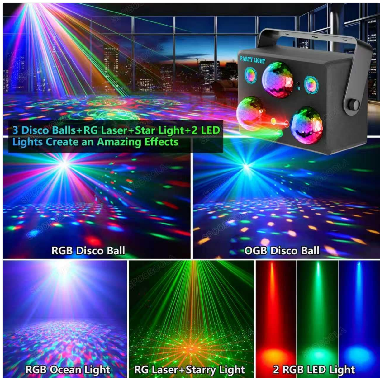
Image 4.1: Visual representation of the 6-in-1 lighting effects, including disco balls, ocean waves, and laser patterns.