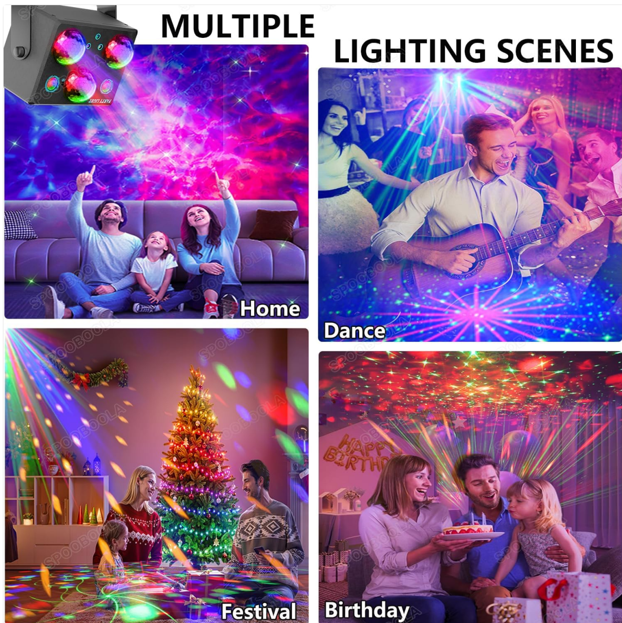
Image 6.2: Examples of different lighting modes and their visual impact in various settings.