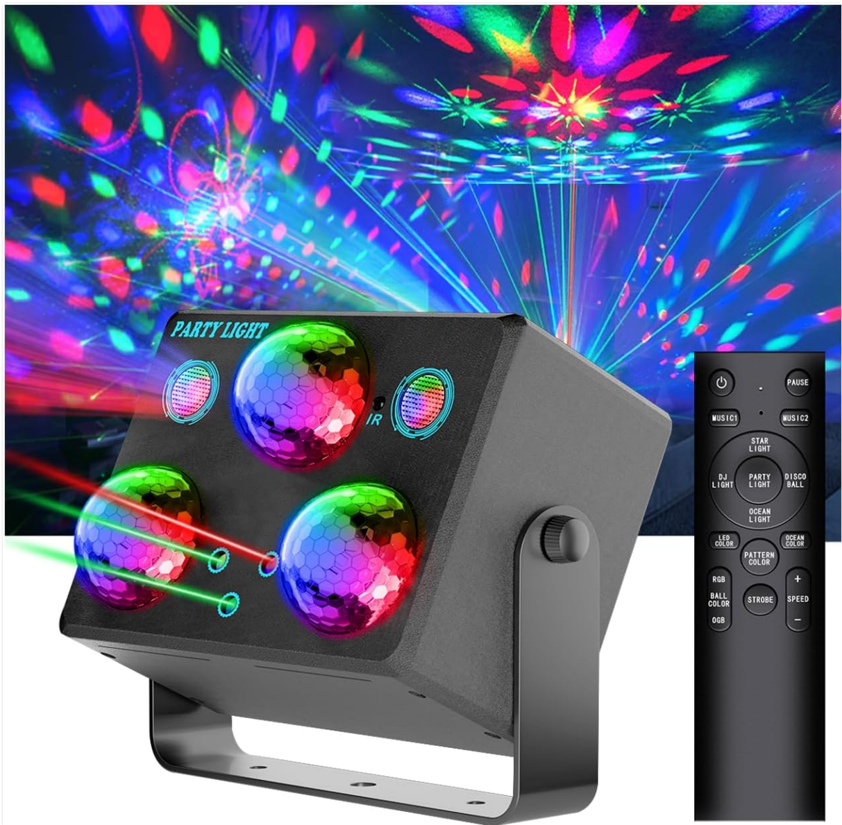
Image 1.1: The SPOOBOOLA TD-001 6-in-1 Party DJ Disco Light in operation, displaying multiple vibrant light patterns.