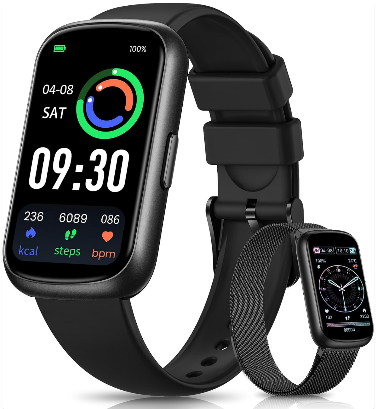
Image 3.1: DEKELIFE CS5 Fitness Tracker Smart Watch with both silicone and metal bands.