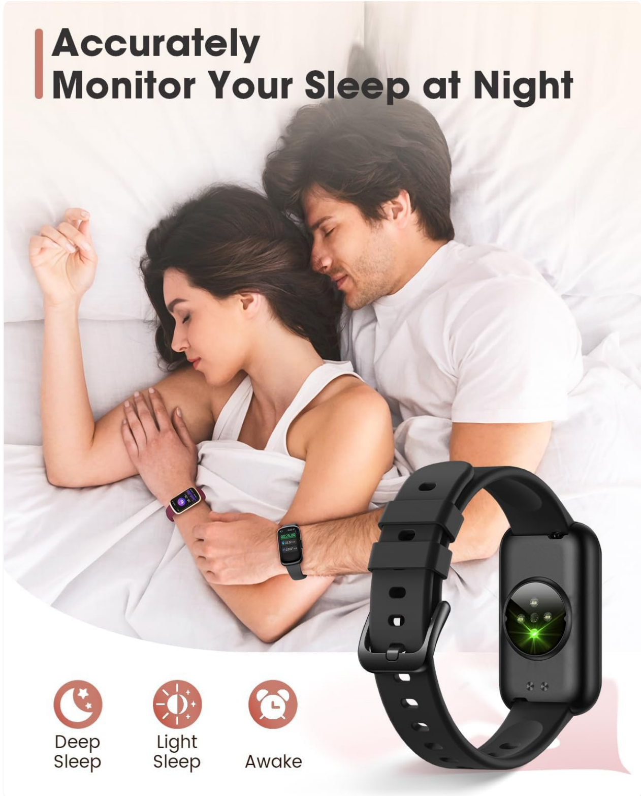
Image 6.2: The sleep tracking feature monitors deep sleep, light sleep, and awake periods.

The watch automatically monitors your sleep patterns from 6 PM to 12 PM the next day. It records the duration of deep sleep, light sleep, and awake times. Detailed analysis and weekly reports are available in the app to help improve sleep quality.