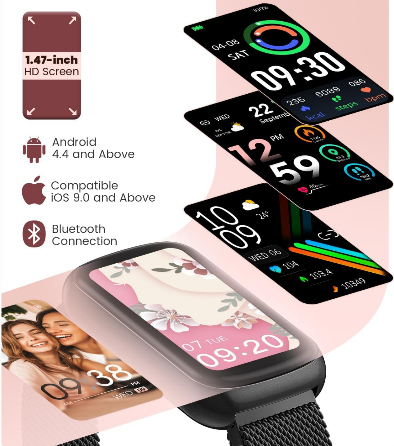
Image 5.1: Examples of customizable watch faces and device compatibility.