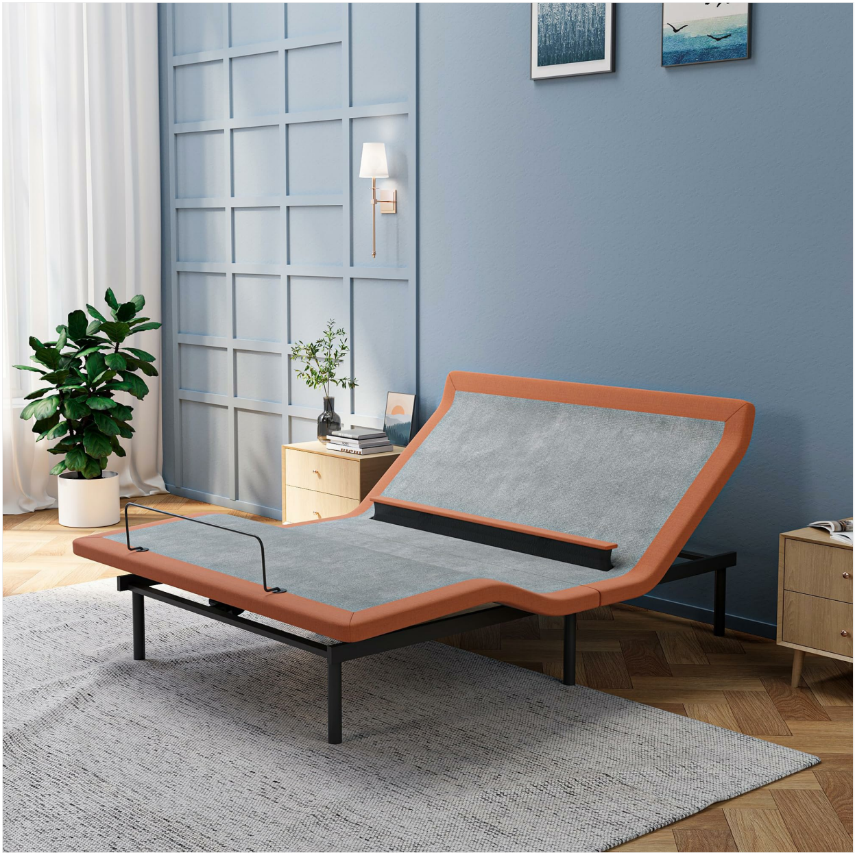
Figure 1: ESHINE 6000 Series Queen Adjustable Bed Frame. This image shows the adjustable bed frame in a neutral, flat position, highlighting its sleek design and the Queen size designation.