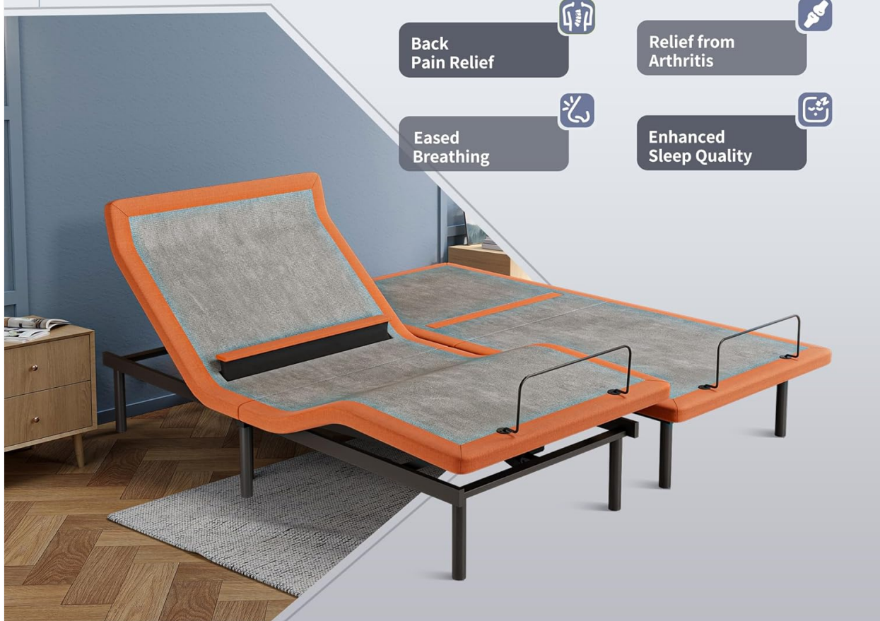
Figure 2: Benefits of an Adjustable Bed. This illustration highlights various health benefits associated with using an adjustable bed, such as improved digestion, better posture, enhanced circulation, decreased swelling, back pain relief, relief from arthritis, eased breathing, and enhanced sleep quality.