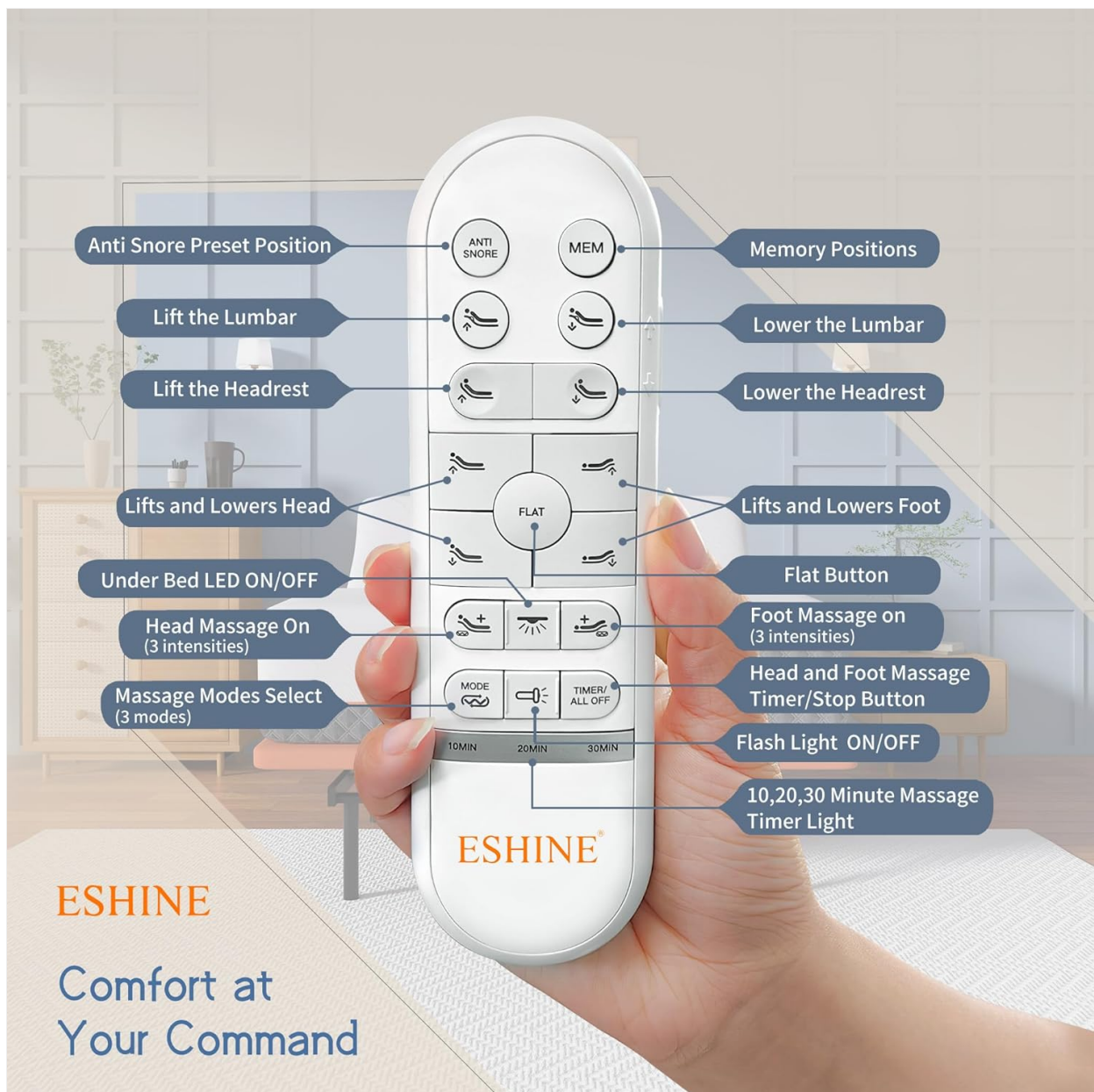
Figure 5: ESHINE Adjustable Bed Remote Control. This image displays the wireless remote control with labels for each button, including Anti-Snore preset, Memory Positions, Lift/Lower Lumbar, Lift/Lower Headrest, Head/Foot Up/Down, Flat button, Under Bed LED ON/OFF, Head/Foot Massage (3 intensities), Massage Modes Select (3 modes), Flash Light ON/OFF, and 10, 20, 30 Minute Massage Timer Light.