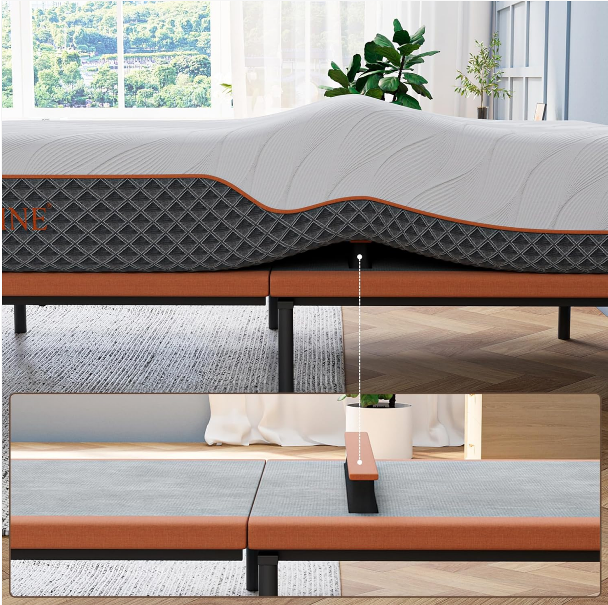
Figure 4: Adjustable Bed Frame Components. This image illustrates the mattress retention bar and the adjustable legs, showing how they integrate with the bed frame for stability and customization.