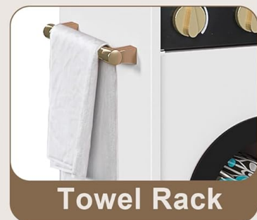
Image: A visual breakdown of the play kitchen's multiple interactive areas, including the microwave, ice maker, chalkboard, washing machine, telephone, and towel rack.