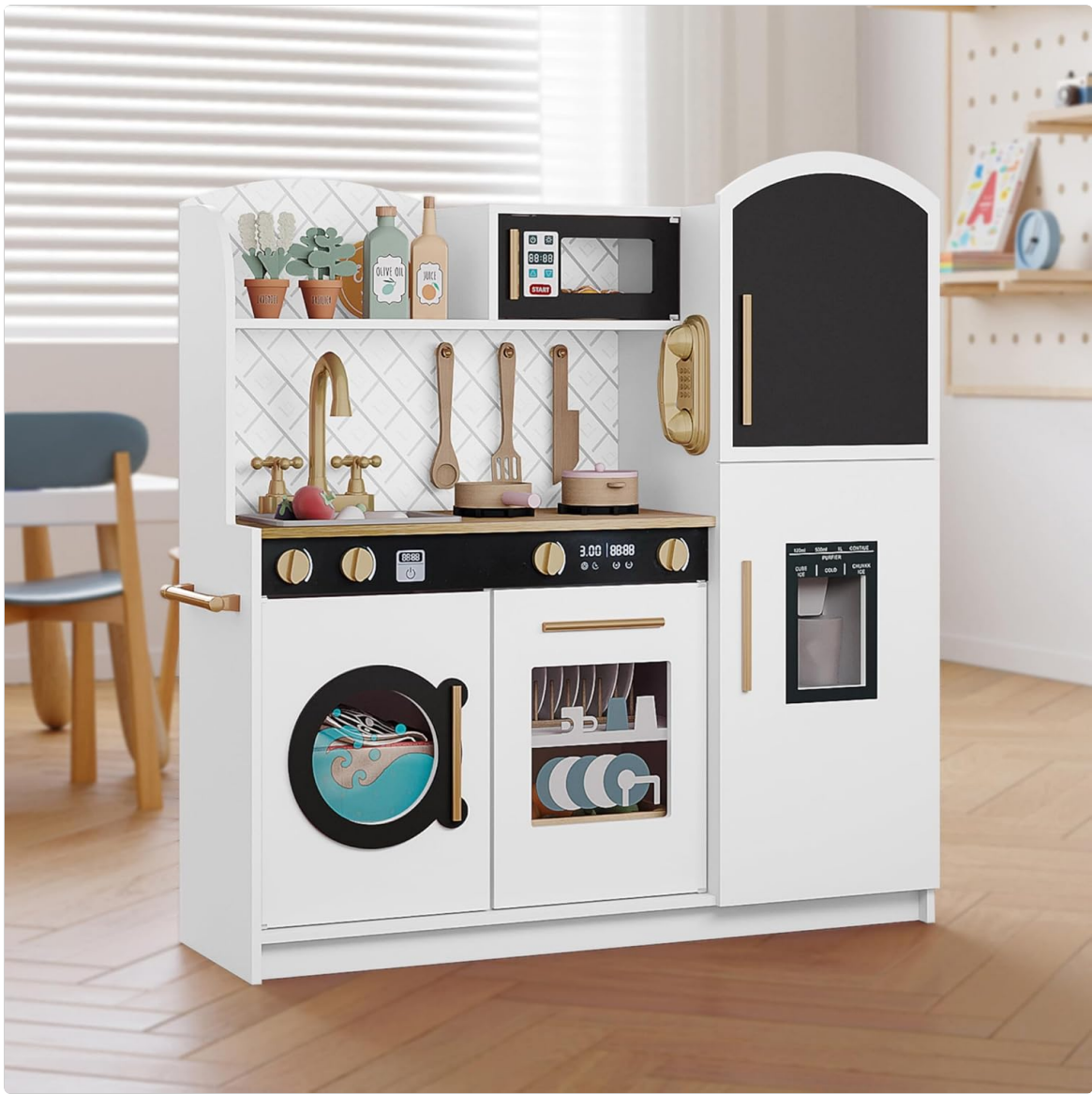
Image: The Treocho Play Kitchen in white, showcasing its various features including a sink, stove, microwave, and refrigerator with an ice maker.