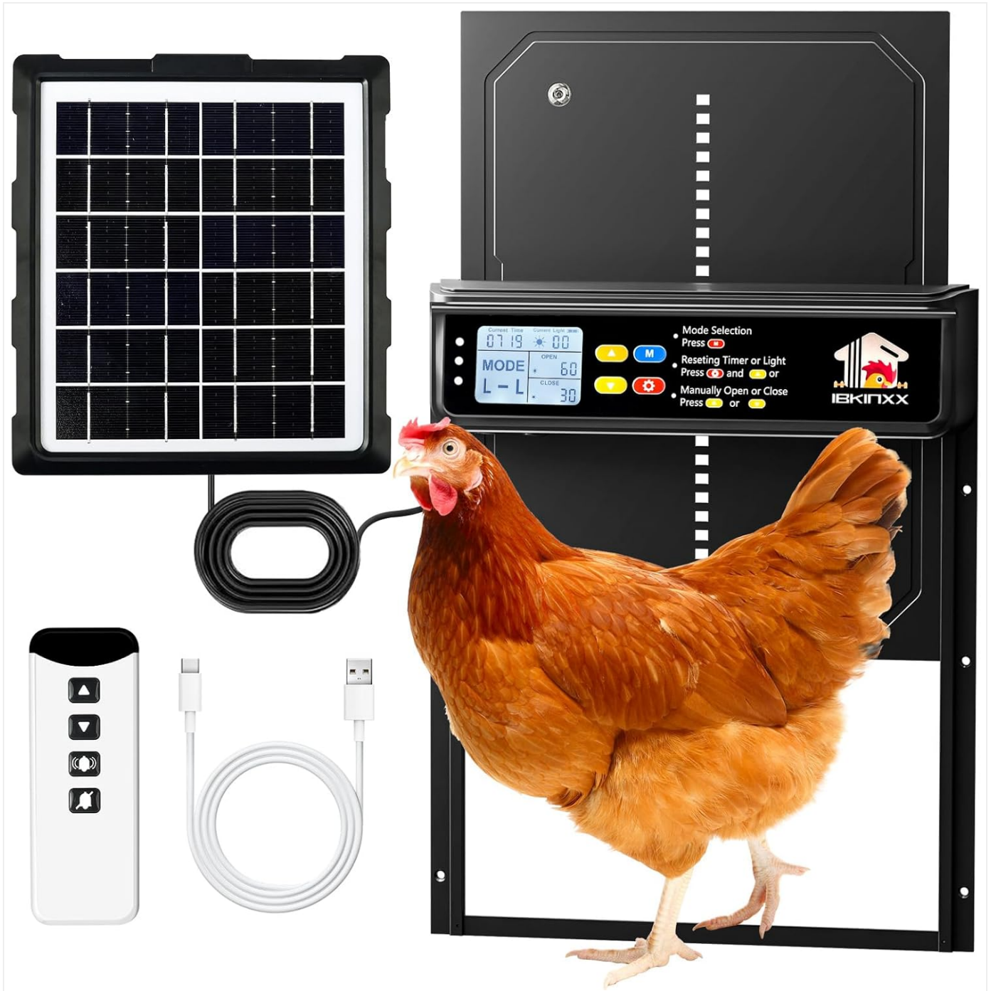
Image: All included components: the main door, solar panel, remote, and cables.