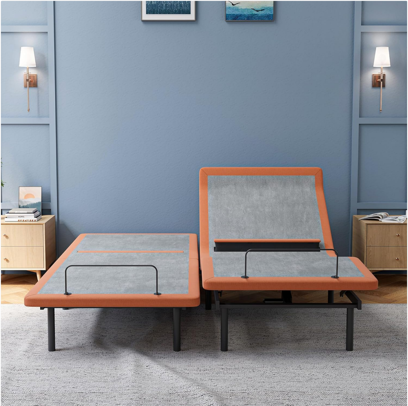
Figure 3: Split King Adjustable Bed Frame during setup.