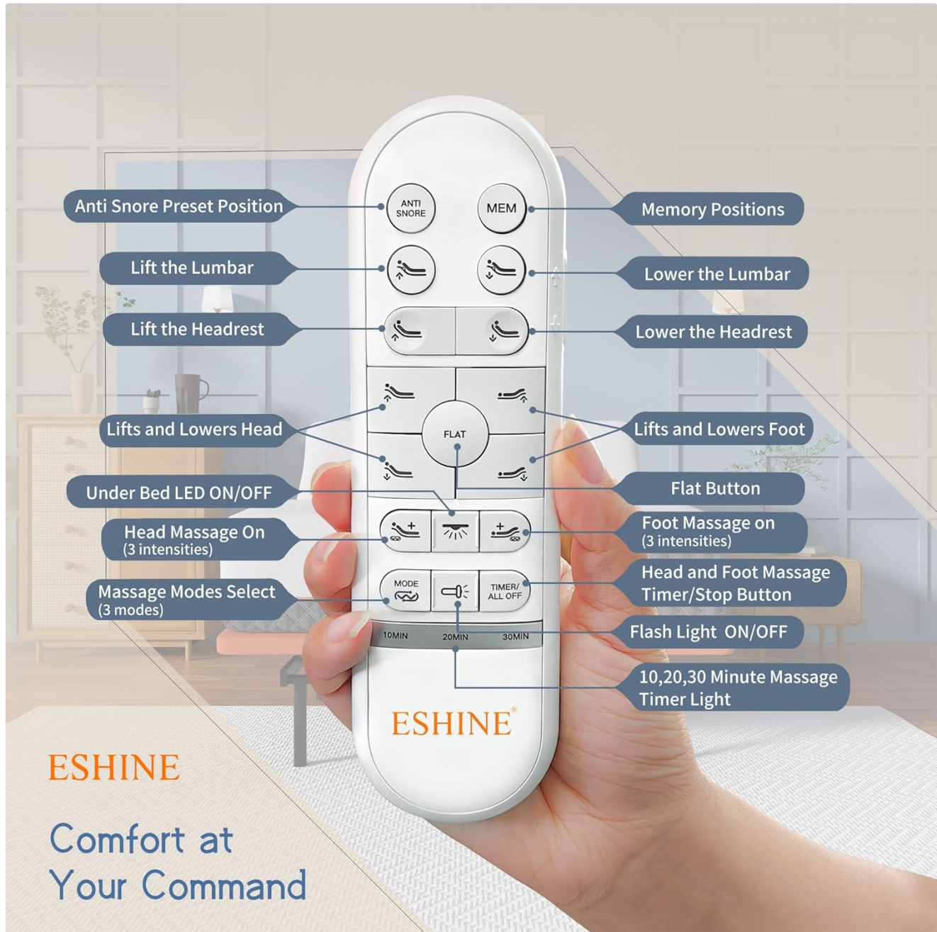
Figure 4: Wireless Remote Control Functions.

The wireless remote provides full control over all bed functions. Ensure the remote has fresh batteries installed.