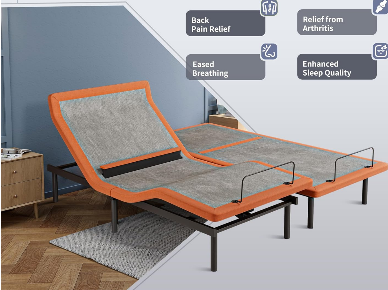
Figure 2: Health Benefits of the ESHINE Adjustable Bed Frame.