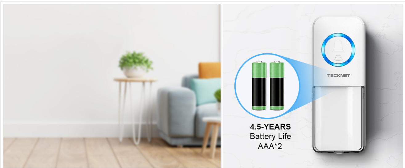
Image 4.1: Transmitter battery compartment and battery life indication.