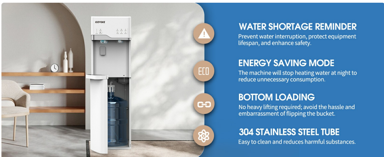
Figure 2: Illustration of the bottom-loading water bottle compartment.