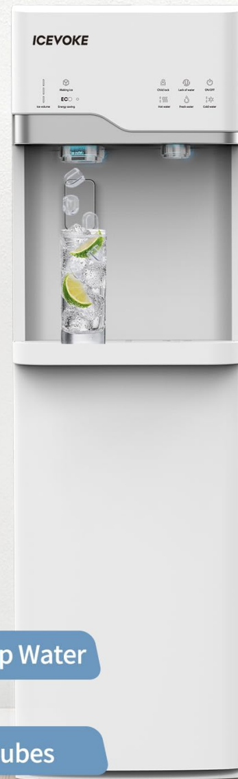
Figure 1: Smart Integrated Design of the ICEVOKE Water Dispenser.