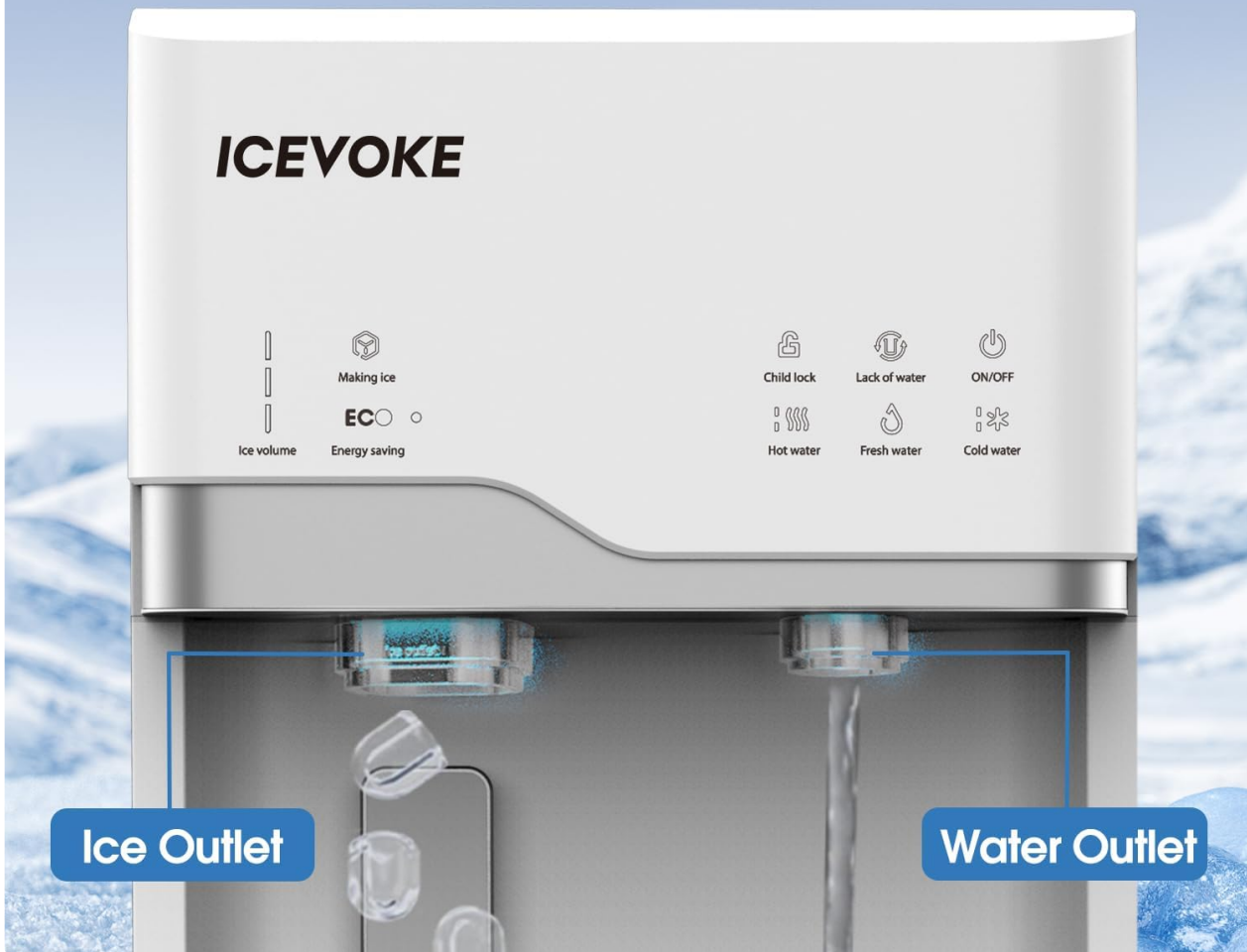
Figure 3: Easy-to-Use Control Panel.