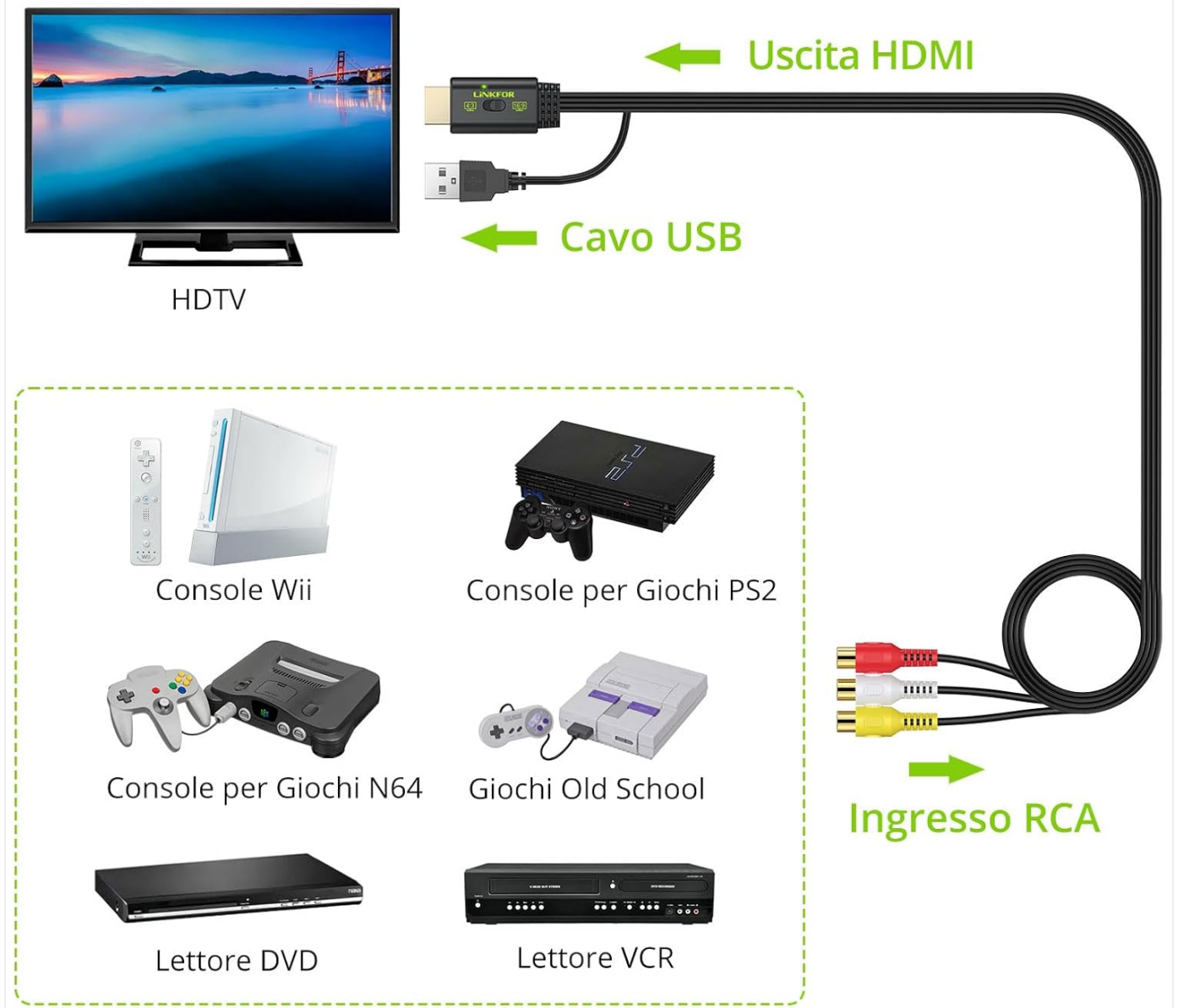
Image: A comprehensive diagram showing the RCA to HDMI converter connecting to an HDTV, with various compatible input devices like Wii, PS2, N64, DVD, and VCR players.