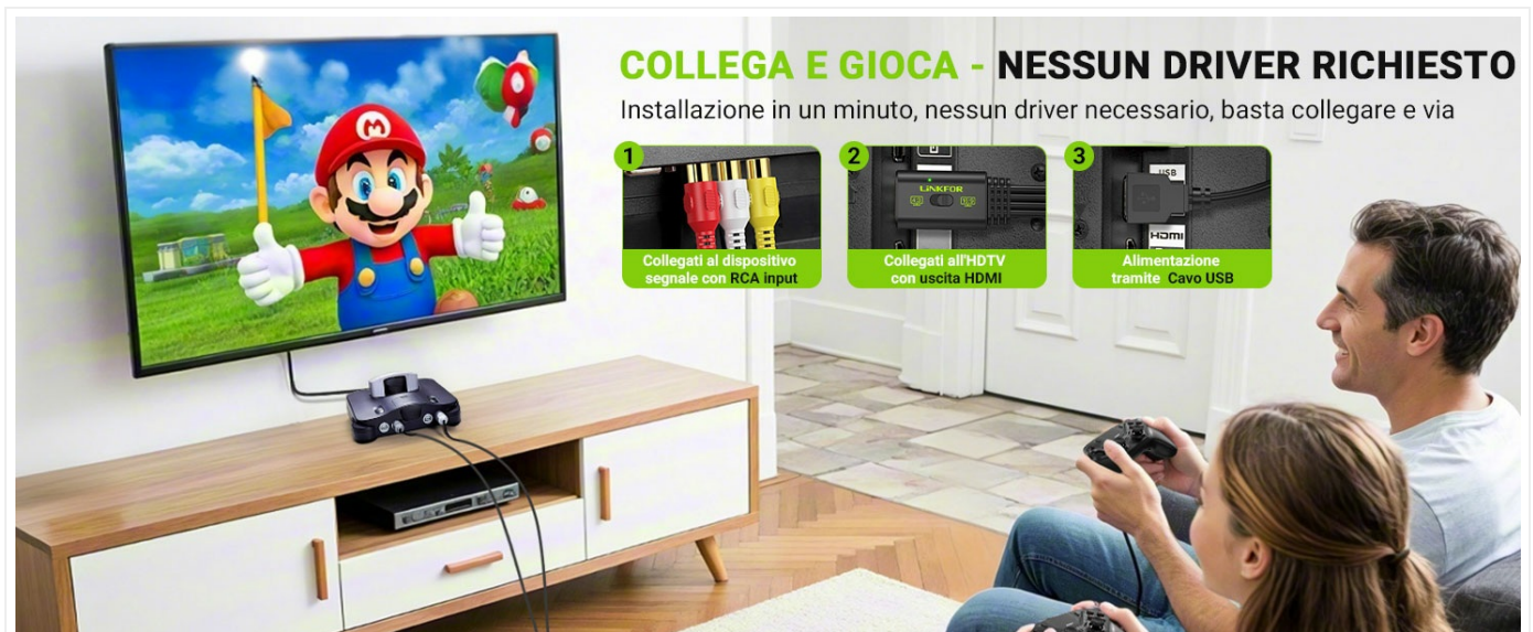
Image: A step-by-step visual guide demonstrating how to connect the RCA to HDMI converter to a retro console and a modern TV.