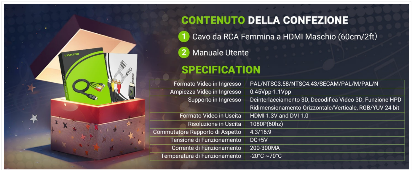
Image: A visual representation of the package contents and detailed product specifications.