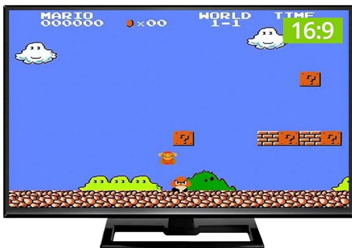
Image: The converter's aspect ratio switch, demonstrating how it changes the display from 4:3 to 16:9 for retro games.