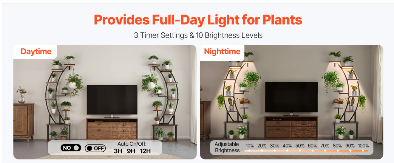
Image: Grow light timer and brightness settings.

The integrated grow lights provide full-spectrum illumination to support plant growth. Control them using the push-button controller.