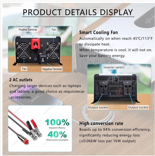
Figure 3.1: Inverter Front and Rear Panels

This image displays the inverter's front and rear panels, highlighting the positive and negative DC input terminals, cooling fans, inverter switch, and two AC output sockets. The smart cooling fan automatically operates to dissipate heat, while the AC outlets provide power for various devices.