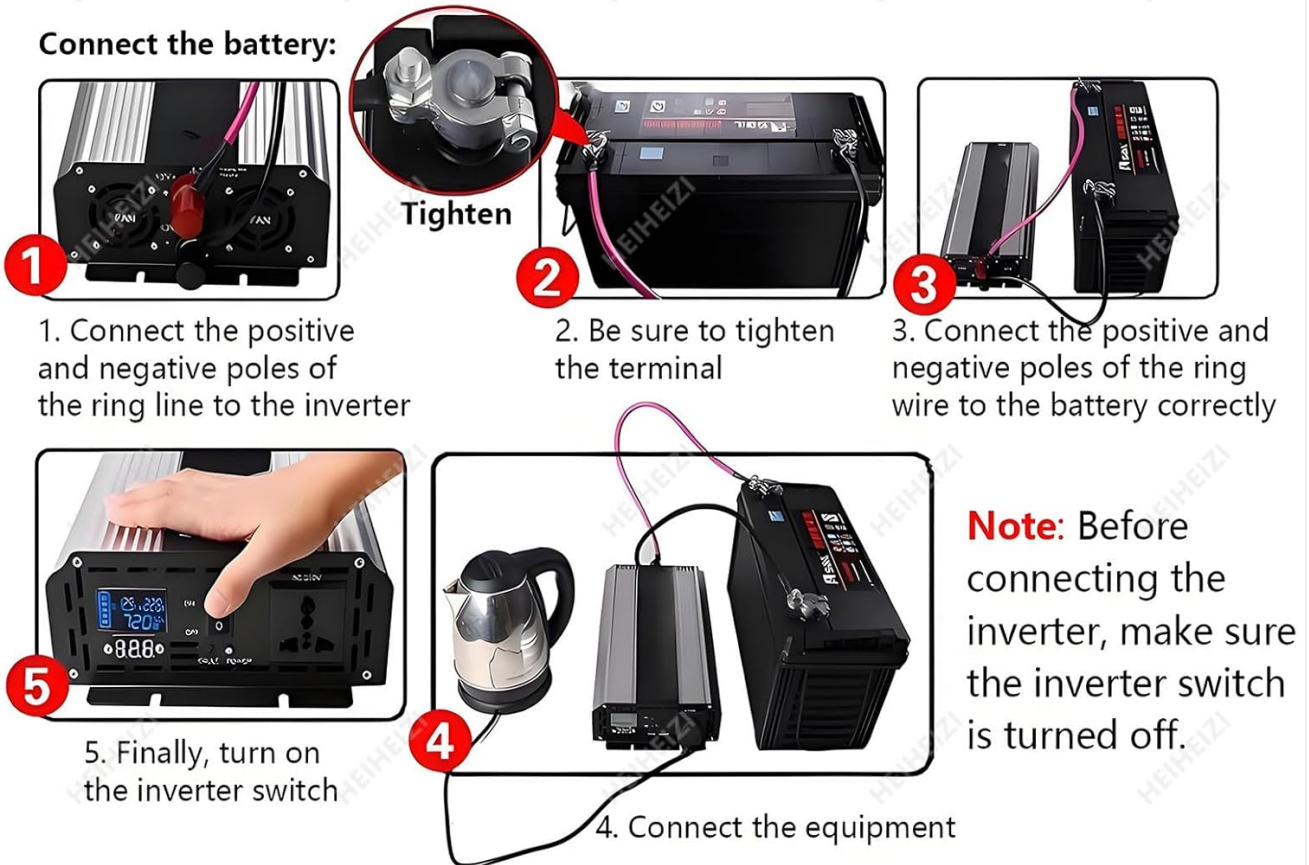
Figure 5.2: Inverter Usage Diagram

This diagram provides a visual guide for connecting the inverter. It emphasizes the importance of matching inverter voltage to battery voltage and ensuring secure connections.