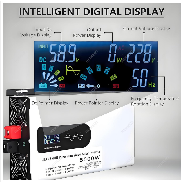
Figure 3.2: Intelligent Digital Display

This image displays the inverter's front and rear panels, highlighting the positive and negative DC input terminals, cooling fans, inverter switch, and two AC output sockets. The smart cooling fan automatically operates to dissipate heat, while the AC outlets provide power for various devices.