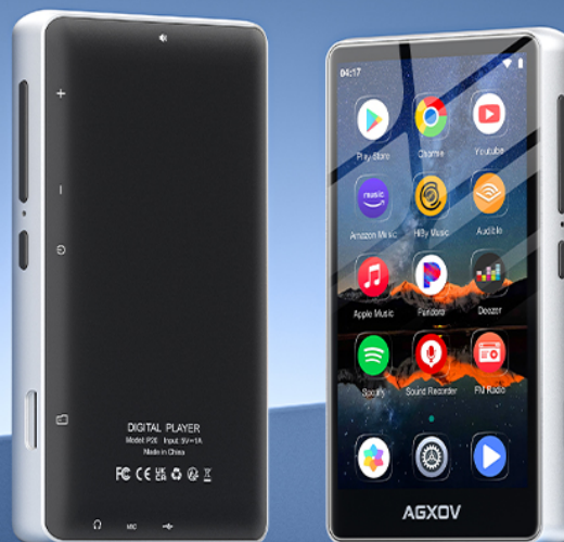
Image: The AGXOV P20 MP3 Player demonstrating universal Bluetooth compatibility with various audio

Carry your entire music world, indulge in musical freedom