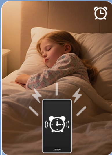
Alarm Clock Function Support