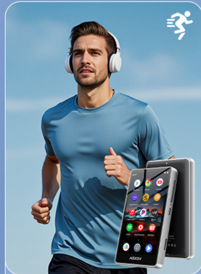
MP3 Player Born for Sports

Image: The AGXOV P20 MP3 Player displaying a full HD video, illustrating its cinematic experience capability.