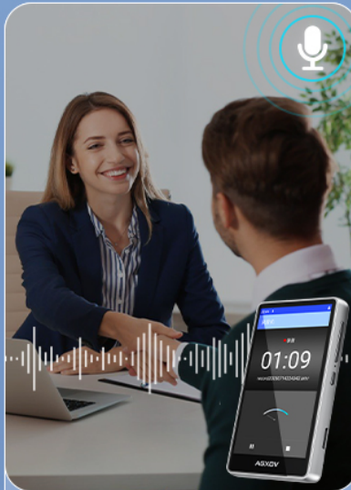
Digital Voice Recording Support