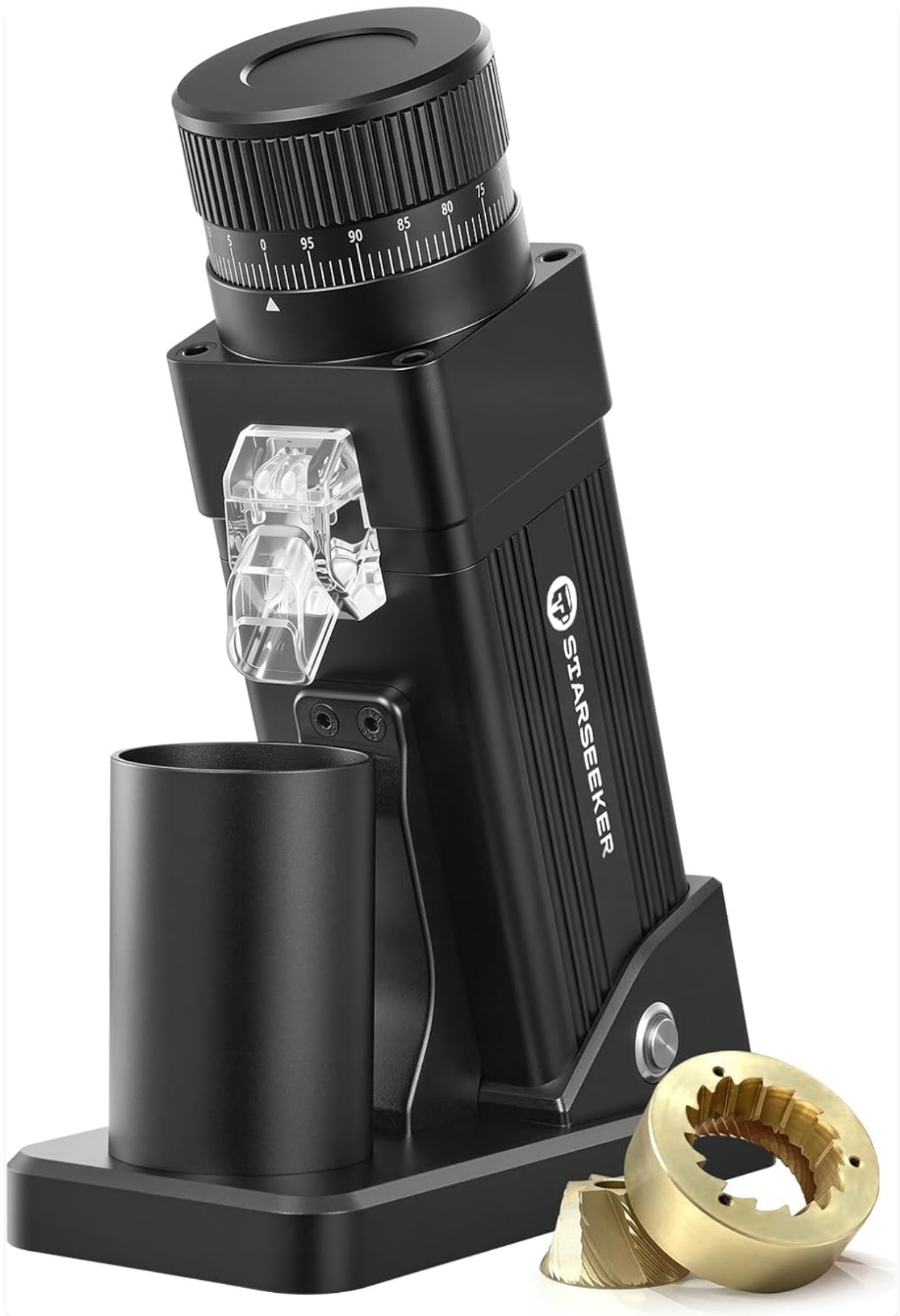
Image: The STARSEEKER E55 Pro Electric Coffee Grinder, showcasing its sleek black design and included accessories like the magnetic dosing cup and burr set.