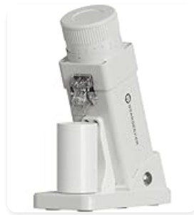
Image: Diagram illustrating the tool-free burr removal process for easy cleaning and maintenance.

Your browser does not support the video tag.