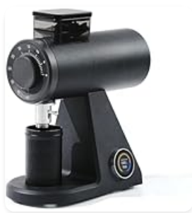
Image: Close-up of the stepless grind adjustment ring, illustrating the precision control available for various brew methods.