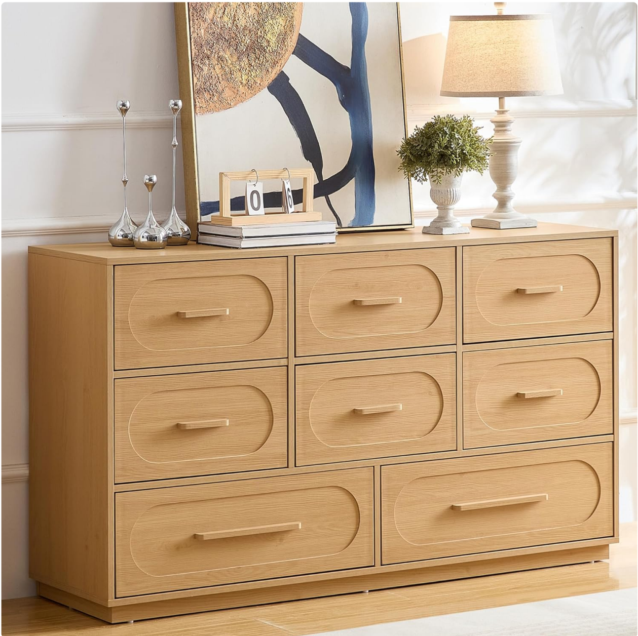
Image: Fully assembled Harpaq 8-Drawer Dresser in Natural Oak finish.

Assembly typically requires two adults. Follow the step-by-step instructions provided in the included assembly guide. Ensure all parts are correctly oriented before tightening fasteners.