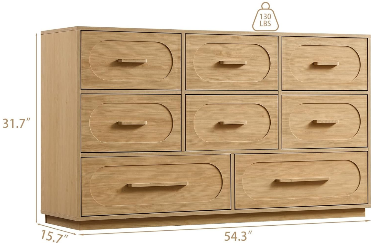
Image: The 8-drawer dresser with its dimensions clearly marked: 15.7"D x 54.3"W x 31.7"H, and a weight capacity of 130 lbs on top.