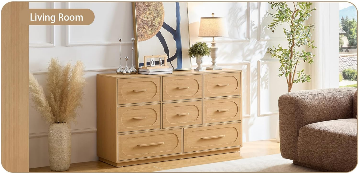
Image: The Harpaq 8-Drawer Dresser positioned in a modern bedroom, showcasing its aesthetic integration.