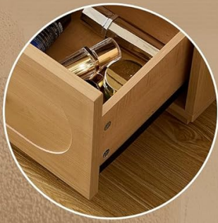
Smooth Metal Sliding