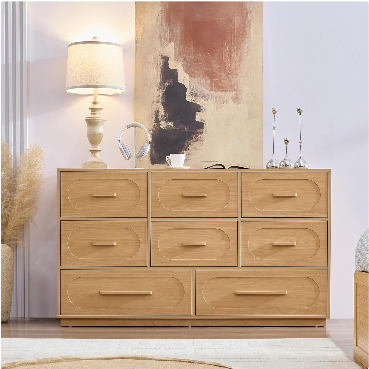
Image: The Harpaq 8-Drawer Dresser placed in a living room, demonstrating its versatility beyond the bedroom.