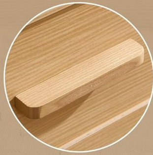
Solid wood handle