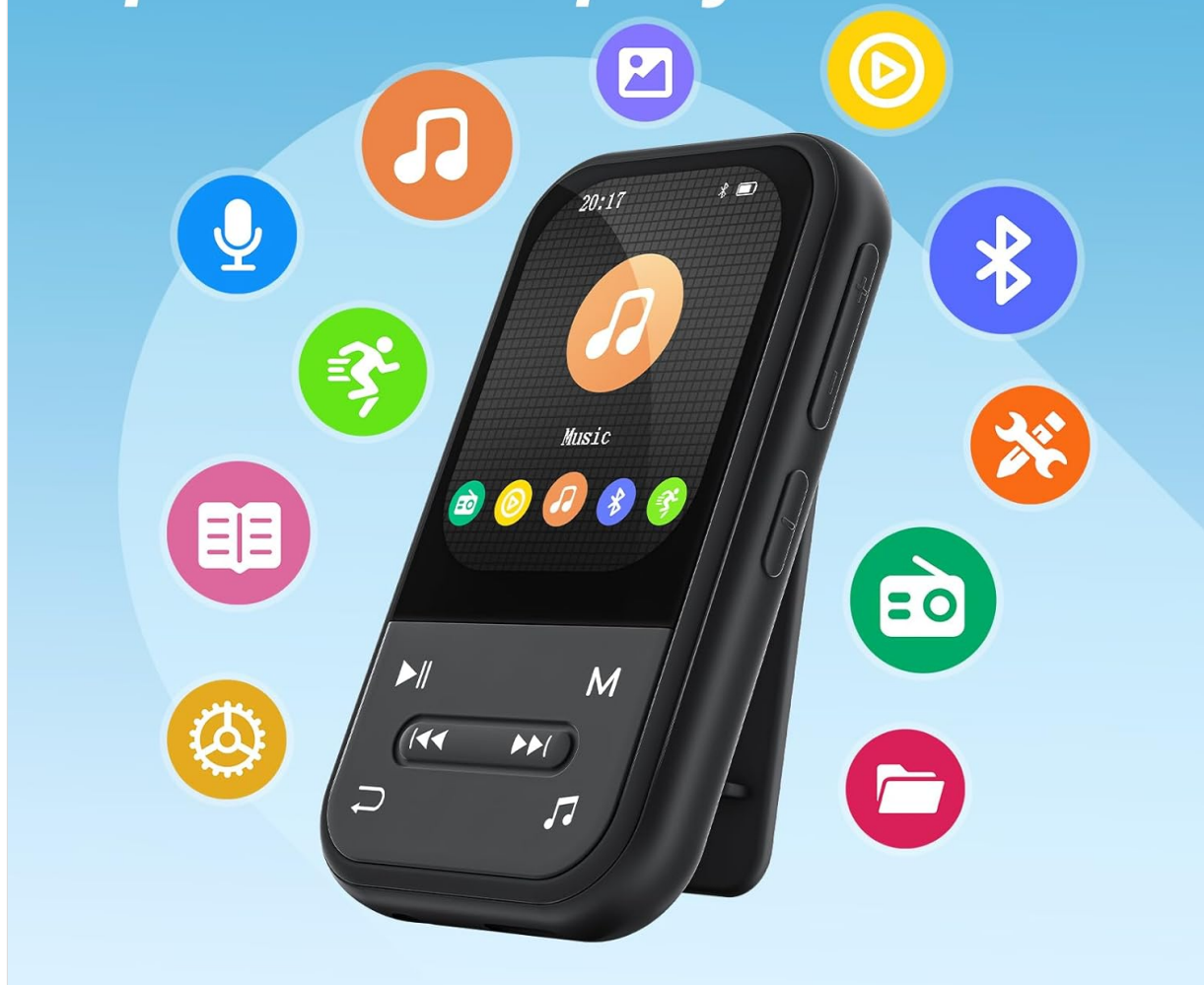
Image: The ZAQE Clip MP3 Player X20 displaying its main interface, surrounded by icons representing its various functions such as music, video, Bluetooth, FM radio, and pedometer.