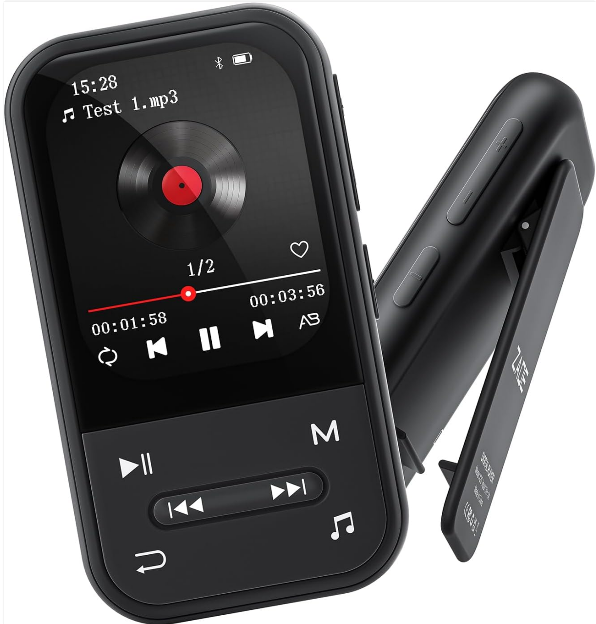
Image: Front and side view of the ZAQE Clip MP3 Player X20, highlighting its compact design and rear clip.

The ZAQE Clip MP3 Player X20 features a compact design with intuitive controls and a secure clip for portability.