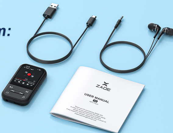
Image: Contents of the ZAQE Clip MP3 Player X20 package, including the player, charging cable, earphones, and user manual.