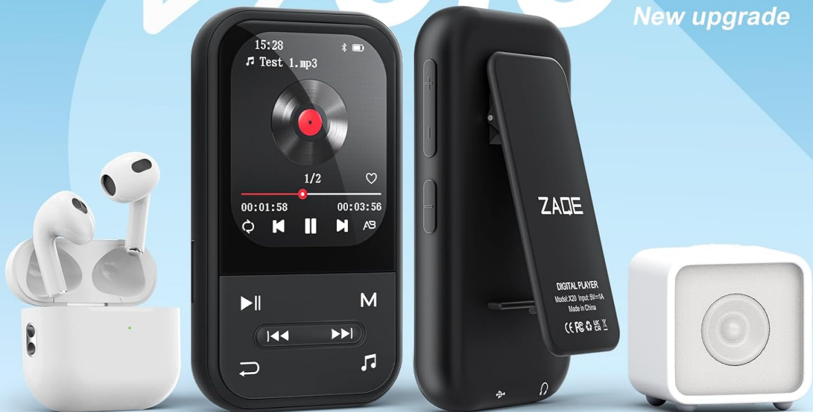
Image: ZAQE Clip MP3 Player X20 connected to Bluetooth headphones and speaker.