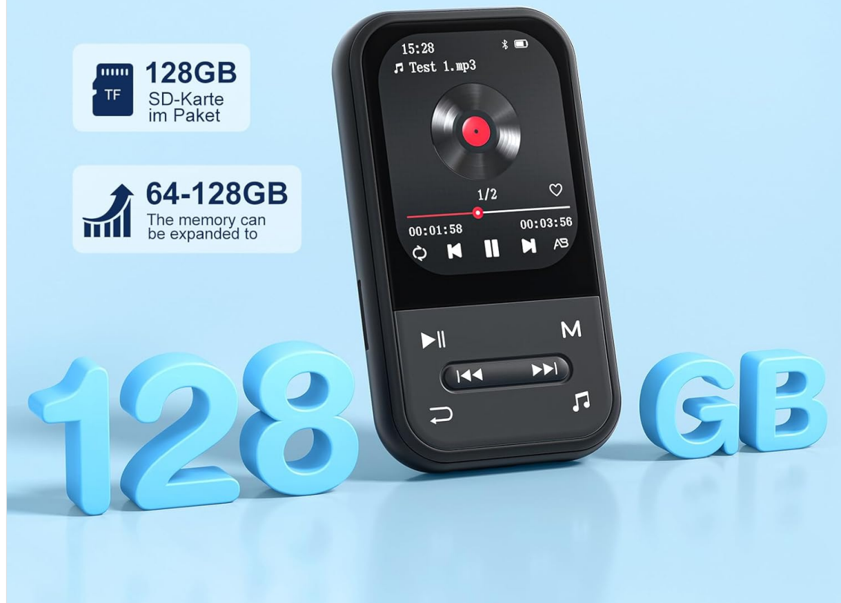
Image: The ZAQE Clip MP3 Player X20 supports 128GB internal storage and expandable memory.

Not only comes with 128GB of memory, But also supports 64GB-128GB of expandable memory!