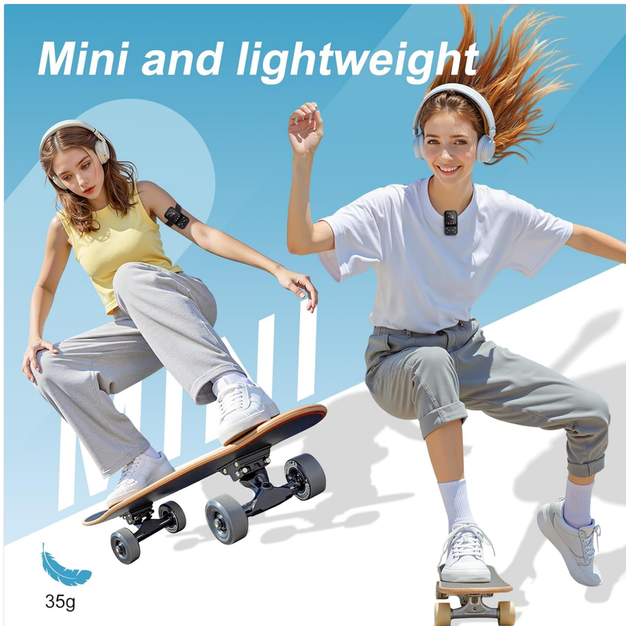
Image: The ZAQE Clip MP3 Player X20 is ideal for sports and activities.