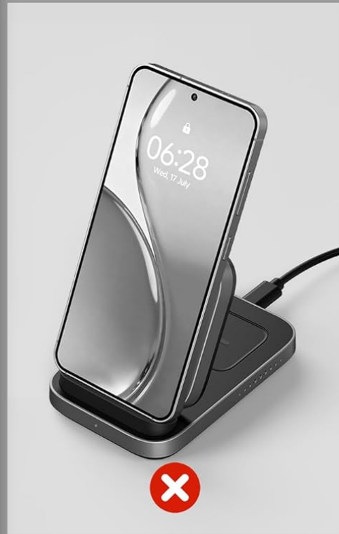
Image: Illustration showing the correct method of placing a smartphone horizontally on the charging pad for wireless charging, and an incorrect vertical placement.