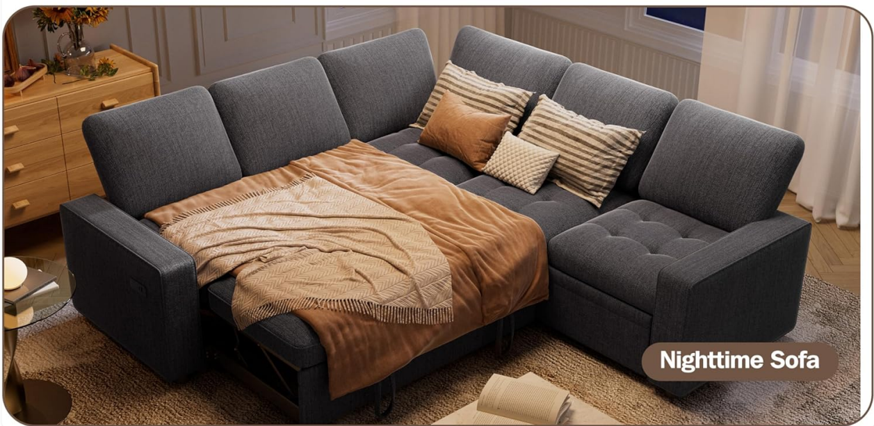
Image: A split image showing the sofa in its standard L-shaped configuration (Daytime Sofa) and then transformed into a bed with blankets and pillows (Nighttime Sofa).