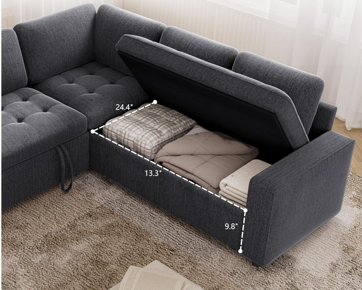
Image: A view of the sofa with a seat cushion lifted, revealing a spacious storage compartment filled with folded blankets, demonstrating its practical use.