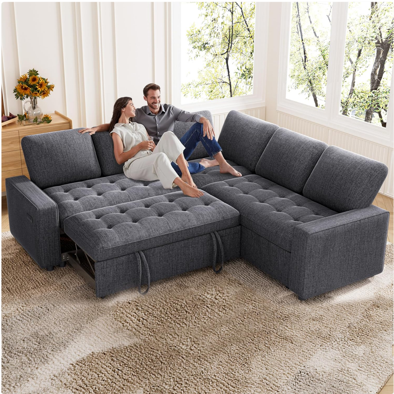
Image: The Vipbear Modular Sectional Sleeper Sofa in dark grey, configured as an L-shaped sofa with the pull-out bed partially extended, showing a couple relaxing on it.