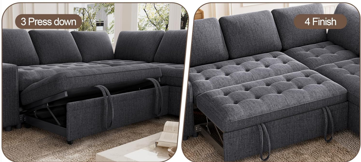
Image: A visual guide demonstrating the four steps to convert the sofa into a pull-out bed: 1. Pull out the hidden bed frame, 2. Lift the bed section, 3. Press down to lock, 4. Finish, revealing a flat sleeping surface.