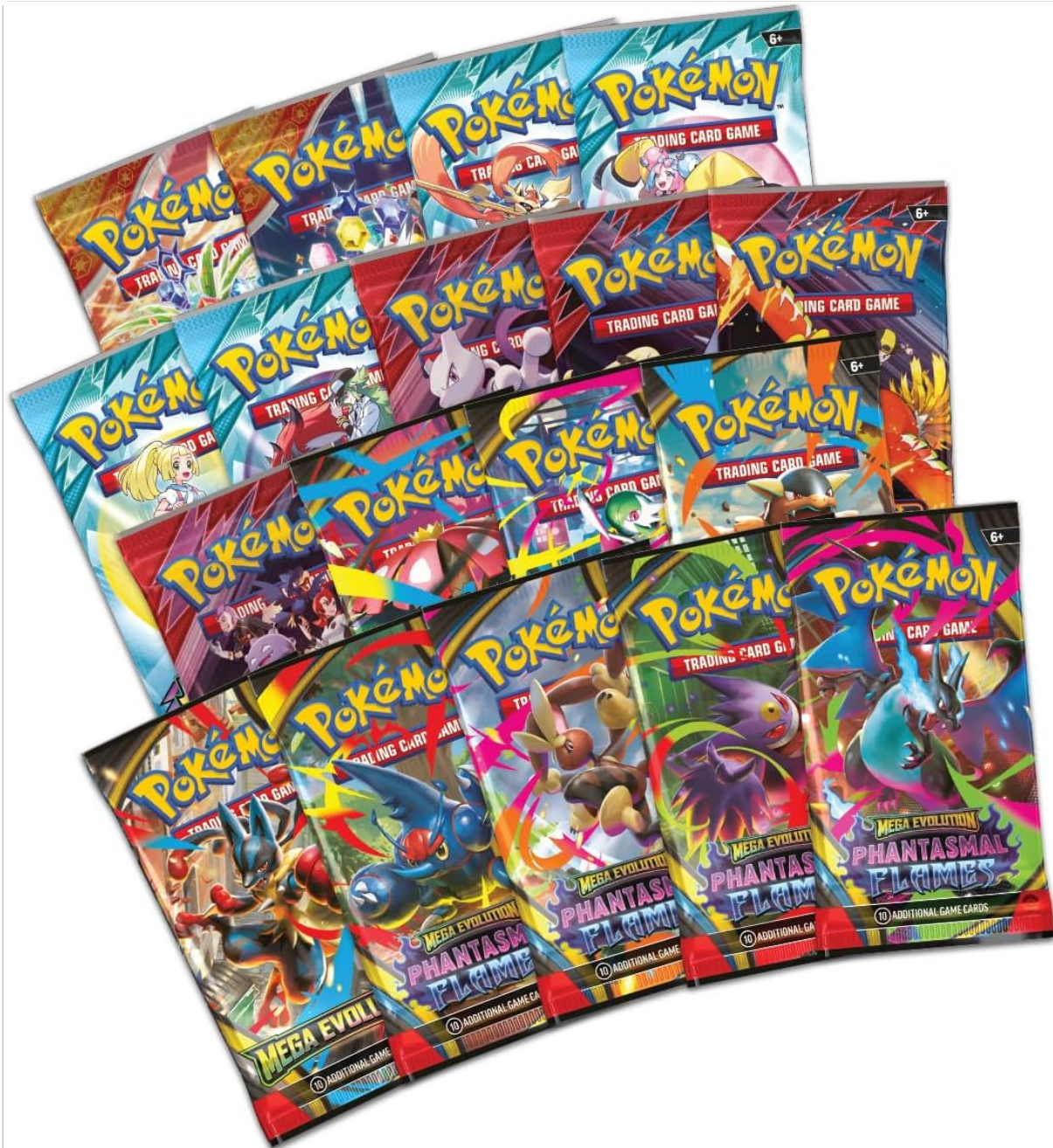
Image: A variety of Pokémon TCG booster packs included in the Ultra-Premium Collection, ready to be opened.