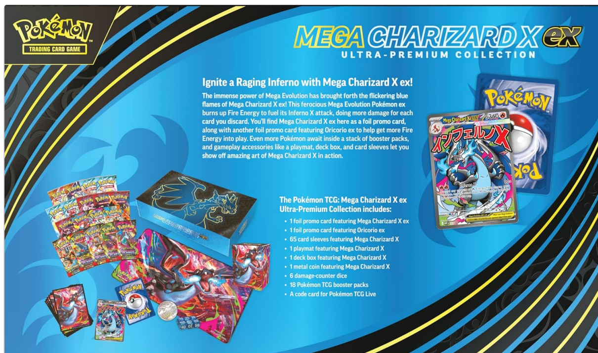
Image: The back of the collection box, listing all included items and featuring additional artwork.