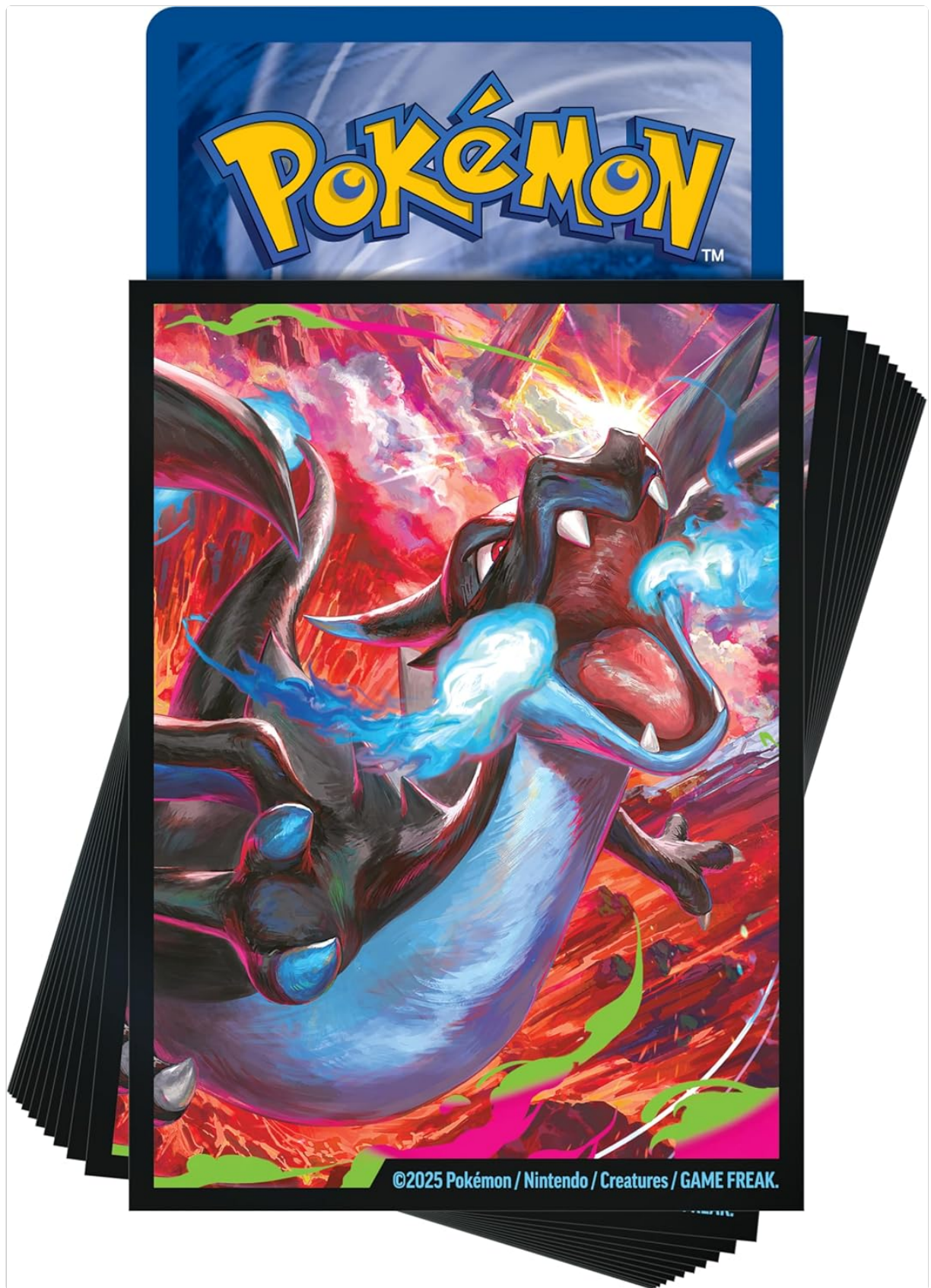
Image: A stack of 65 card sleeves featuring the Mega Charizard X design, used for protecting cards.