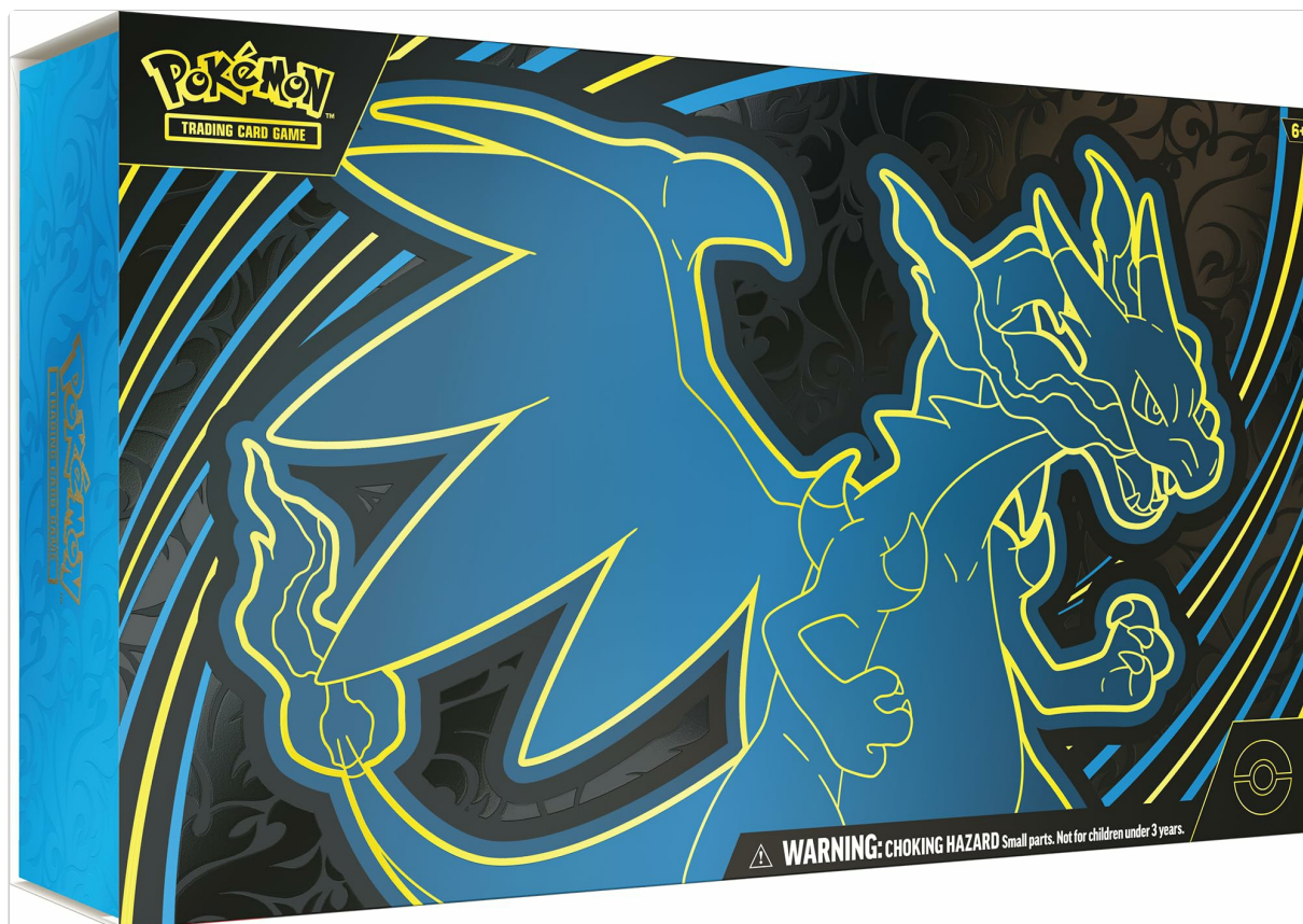
Image: The sealed Mega Charizard X ex Ultra-Premium Collection box, showcasing the prominent Mega Charizard X artwork.