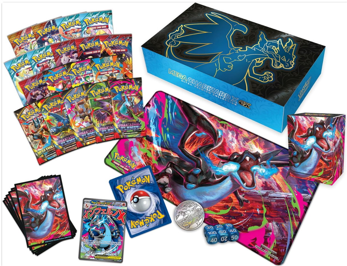
Image: All components of the Mega Charizard X ex Ultra-Premium Collection, including promo cards, sleeves, playmat, deck box, coin, dice, and booster packs, neatly arranged on a blue background.