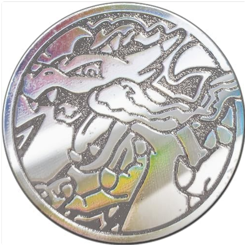
Image: The collectible metal coin with an embossed Mega Charizard X design, used for in-game coin flips.