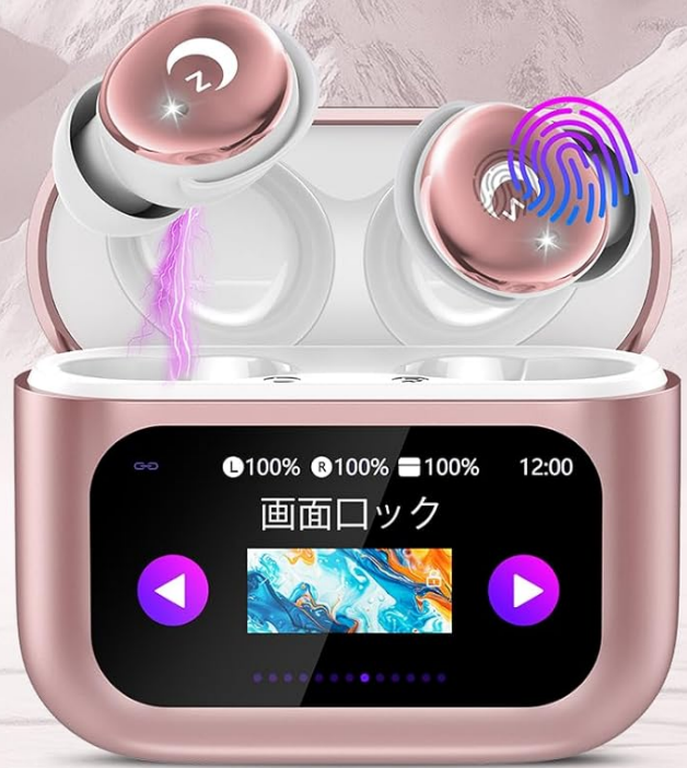
Image: A diagram illustrating various functions accessible via the touch screen on the charging case, including screen lock, language switching, finding earbuds, brightness adjustment, music playback controls, timer, sound equalizer, and sleep mode.