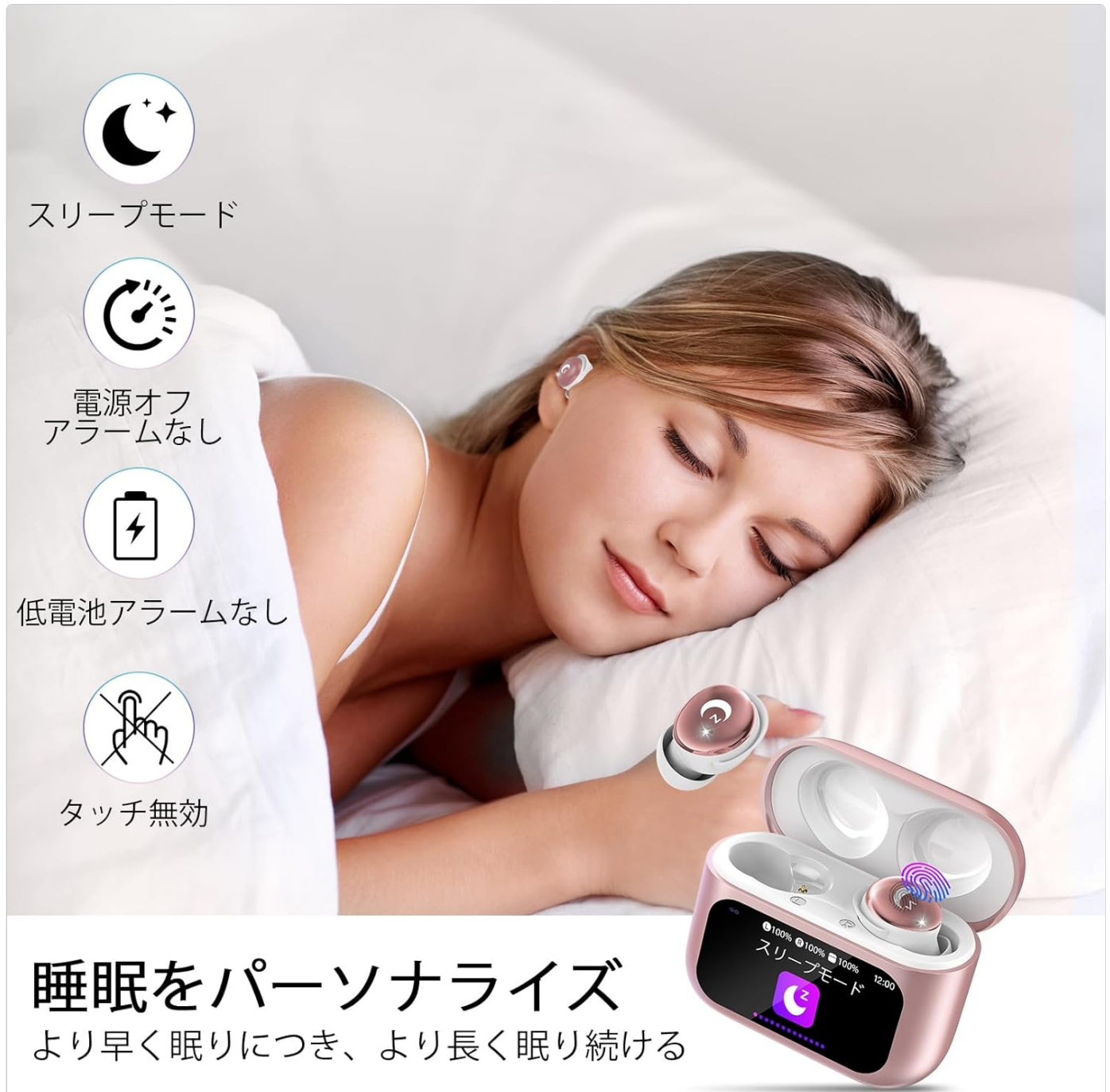
Image: A person sleeping comfortably with the earbuds, illustrating features like sleep mode, no power-off alarm, no low battery alarm, and touch disablement.

The L8 Pro features a dedicated sleep mode designed for undisturbed rest. When activated, this mode automatically blocks incoming calls and disables touch controls on the earbuds to prevent accidental operations. It also eliminates power-off beeps or low battery alerts during sleep.