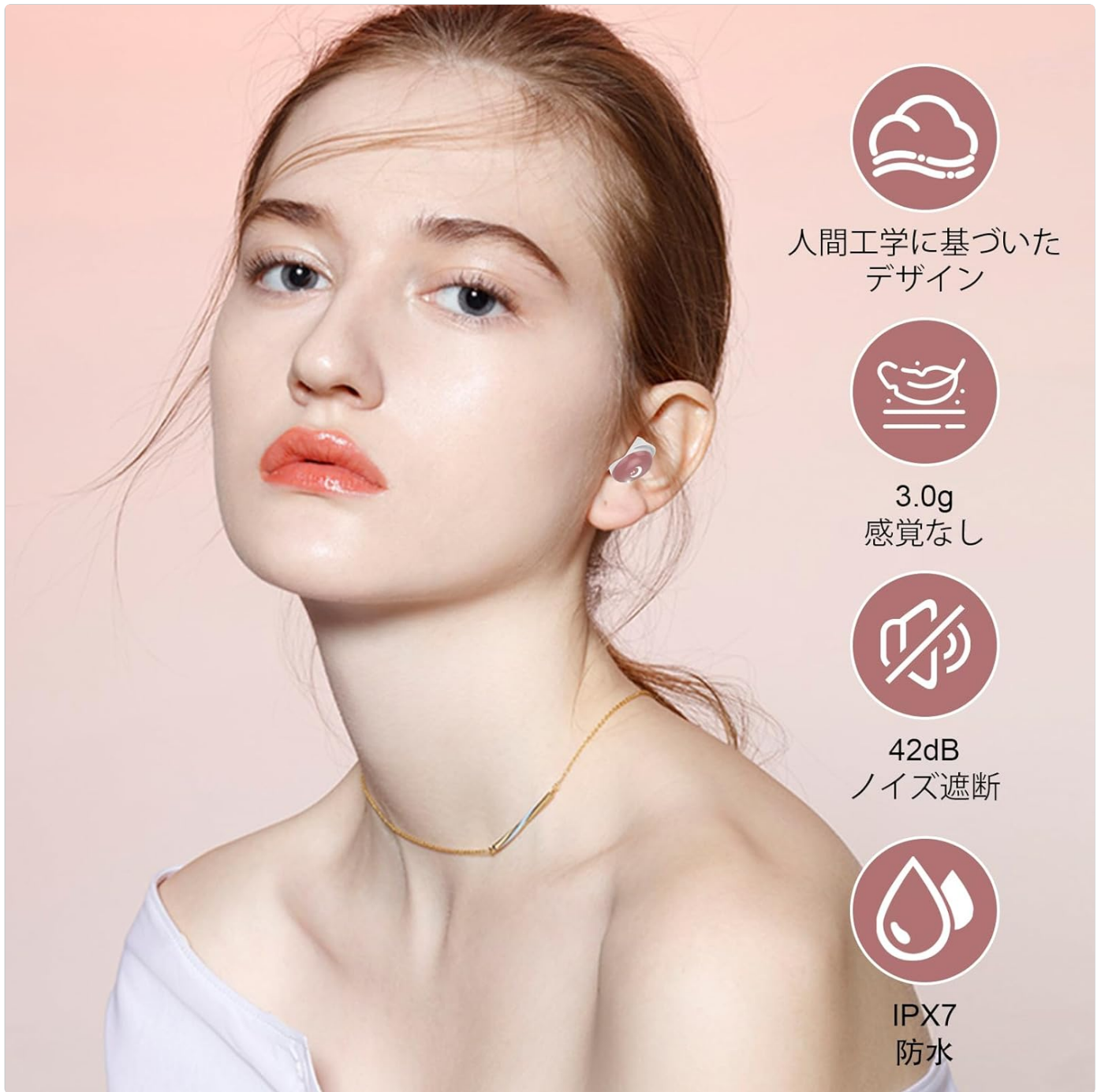
Image: A person wearing the earbuds, highlighting features such as ergonomic design, ultra-lightweight (3.0g), 42dB noise isolation, and IPX7 waterproofing.