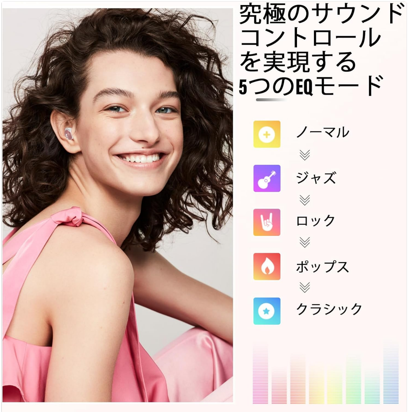
Image: A person smiling while wearing the earbuds, with an illustration of the five EQ modes: Normal, Jazz, Rock, Pop, and Classic.