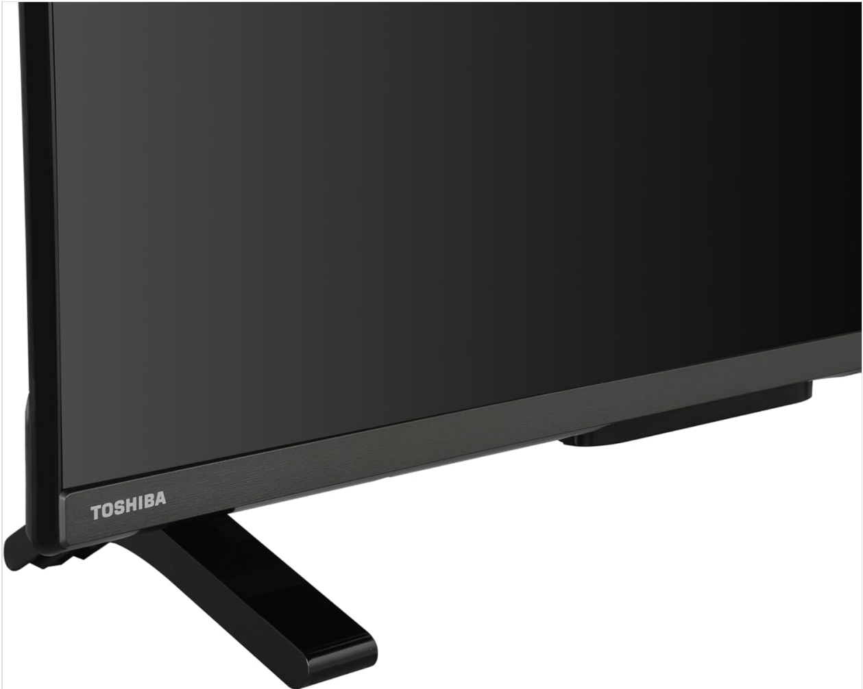
Image: Detail of the TV stand attachment.

Place the TV screen-down on a soft, flat surface to prevent scratches. Align the stand components with the designated slots on the bottom of the TV. Secure the stand using the provided screws. Ensure the stand is firmly attached before placing the TV upright.