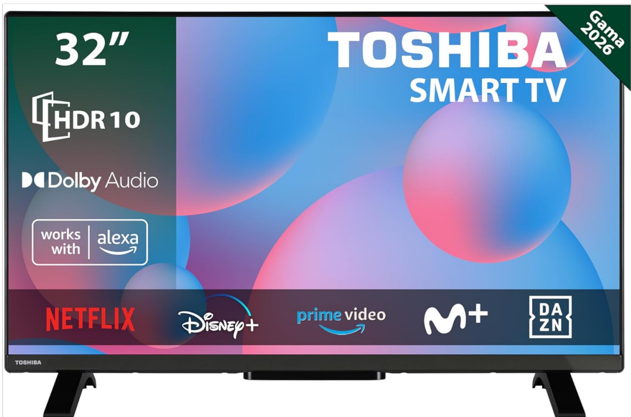
Image: Front view of the Toshiba 32WV2563DG Smart TV.

Welcome to the user manual for your new Toshiba 32WV2563DG Smart TV. This 32-inch HD television offers a rich viewing experience with HDR10 technology, enhanced audio through Dolby Audio processing, and smart features powered by the VIDAA operating system. Enjoy seamless connectivity with built-in Wi-Fi, voice control capabilities with Alexa, and the convenience of USB recording. This manual provides essential information for setup, operation, maintenance, and troubleshooting to ensure you get the most out of your television.