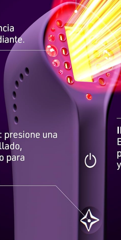
Image: Diagram illustrating the full-spectrum light, red LED, flash button, and pulsed light impulse features of the FAQ 501.

Estimula suavemente la piel para un aspecto revitalizado y fresco.