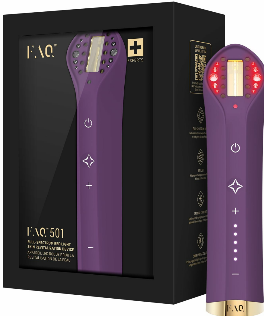
Image: The FAQ 501 Red LED Face Light device, showcasing its sleek design.