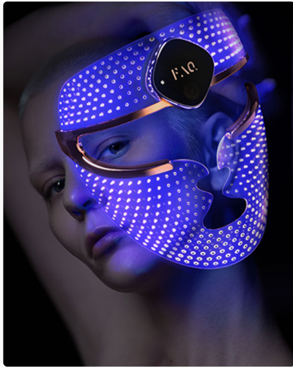
Image: A woman using the FAQ 501 device on her cheek, wearing protective eyewear.