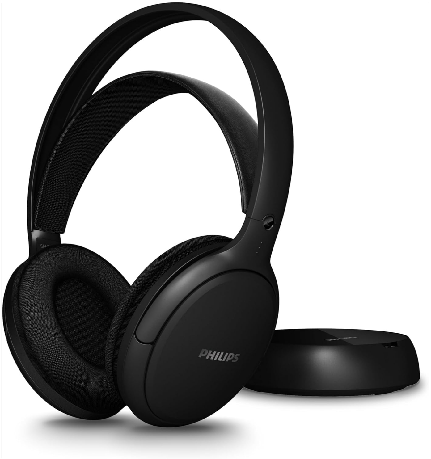
Figure 2.1: Philips SHC5200M2 Wireless TV Headphones and Base Station.