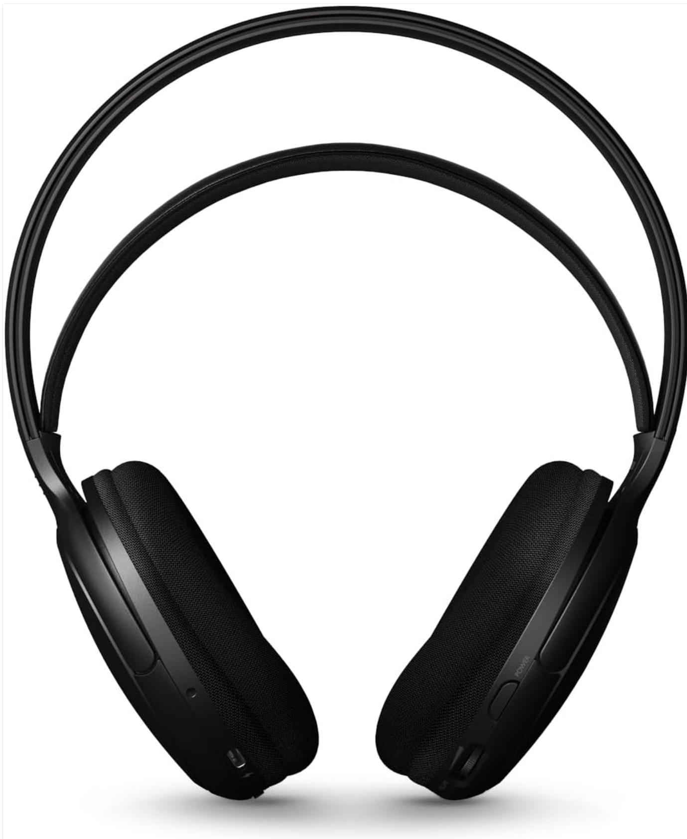
Figure 5.1: Front view of the headphones, demonstrating the comfortable fit.