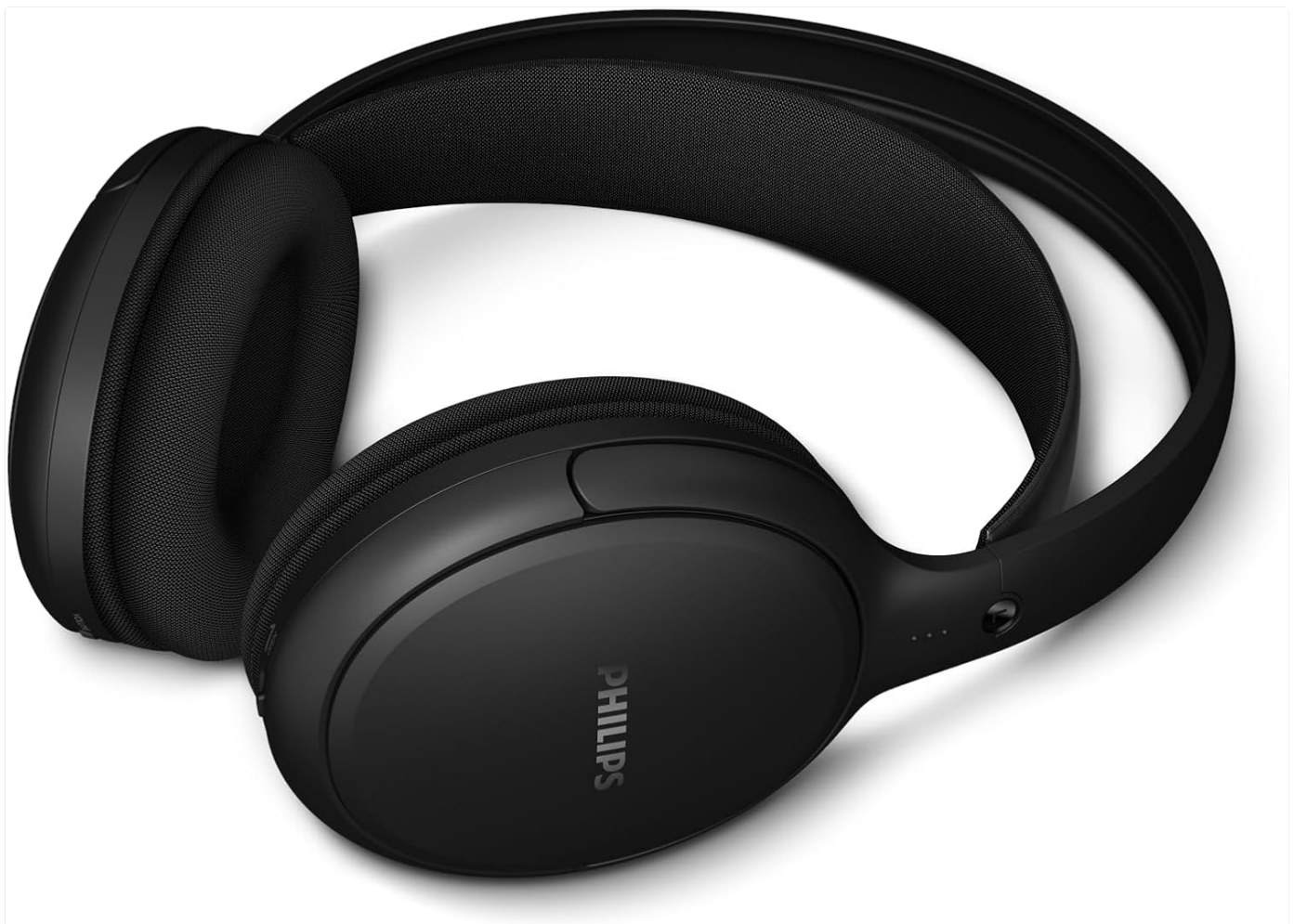
Figure 3.1: Side view of the Philips SHC5200M2 headphones, highlighting the on-ear design and adjustable headband.