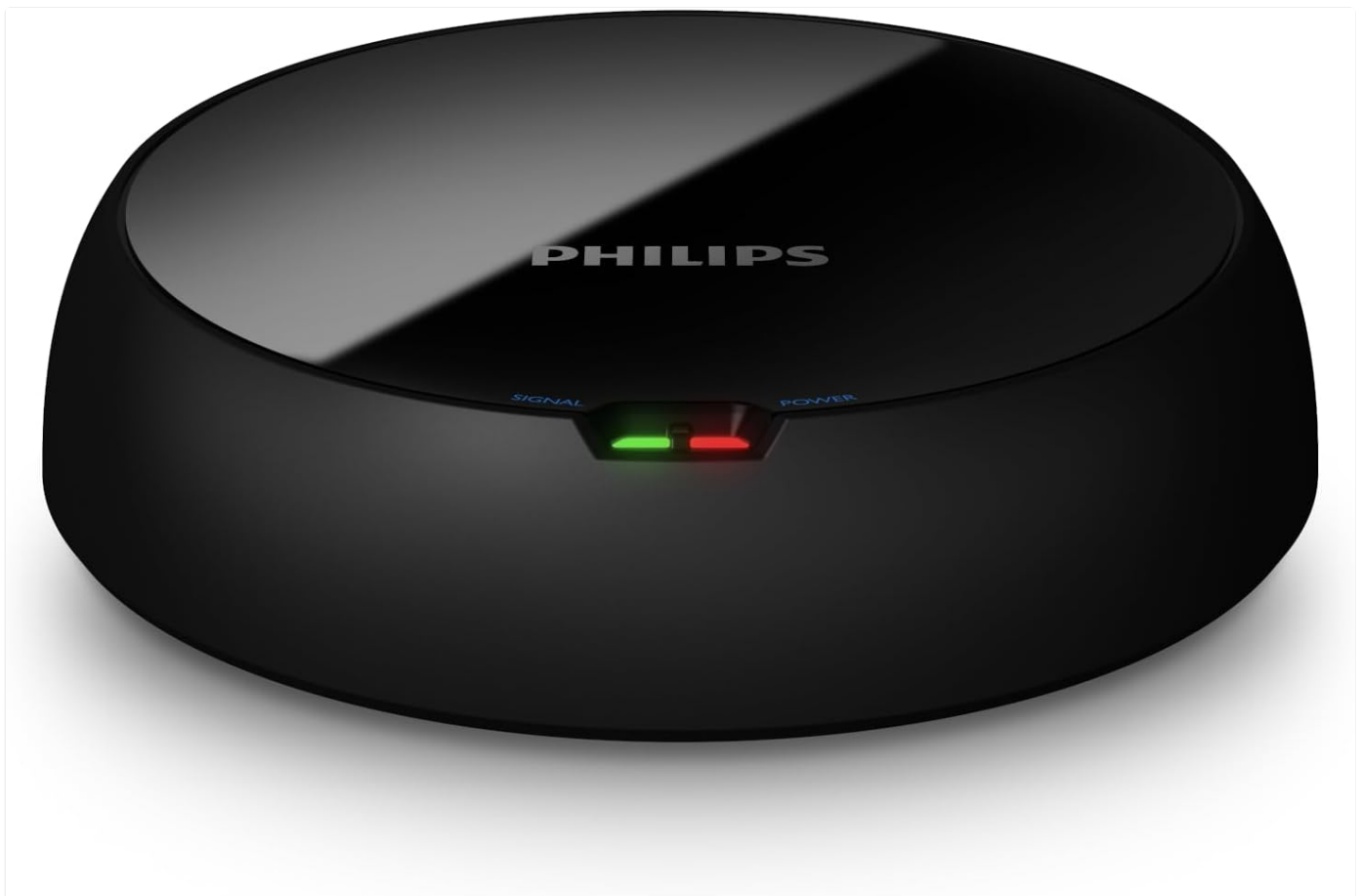
Figure 3.2: Top view of the base station, showing the Signal and Power indicator lights.