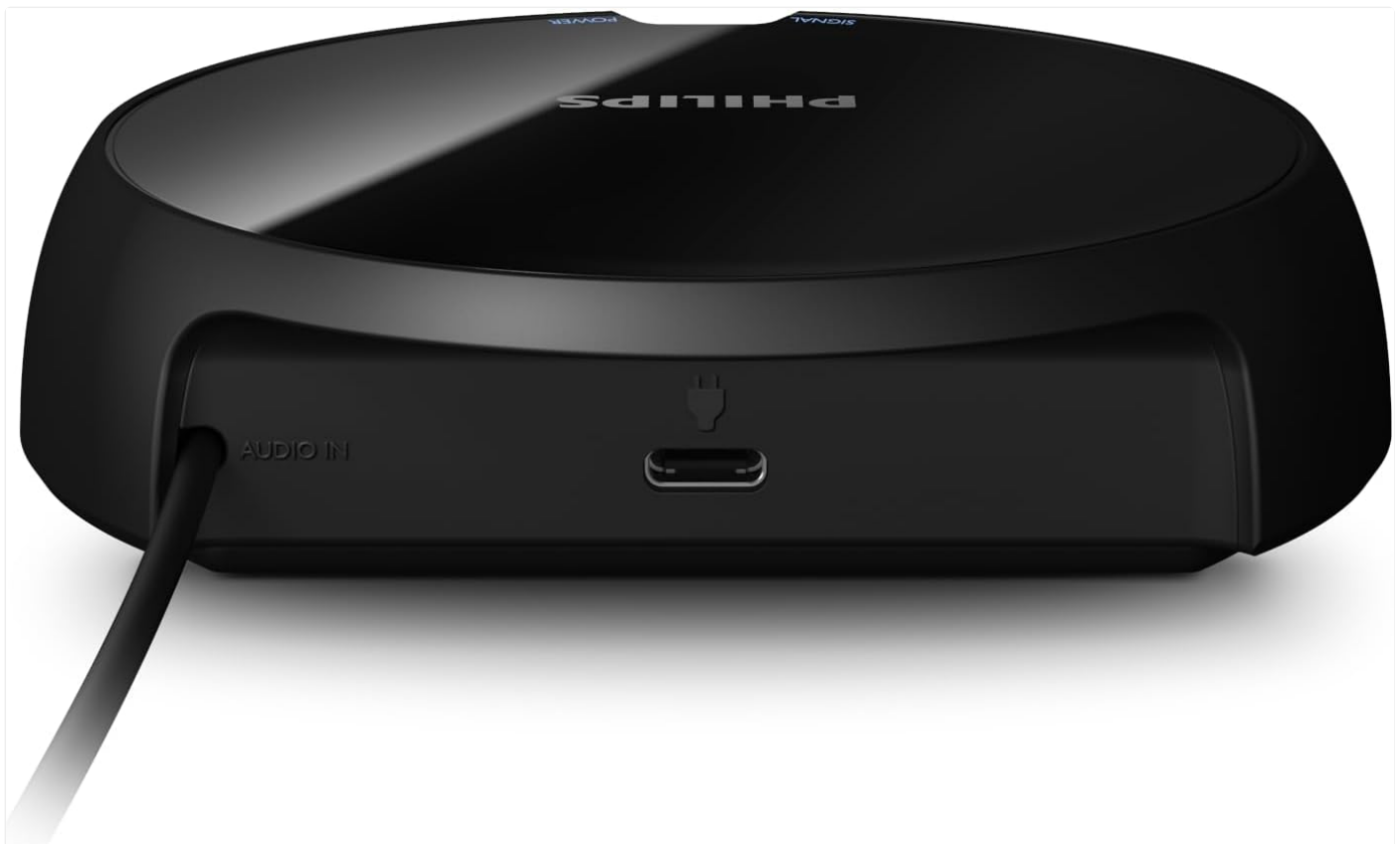
Figure 3.3: Rear view of the base station, illustrating the Audio In port and USB-C power input.