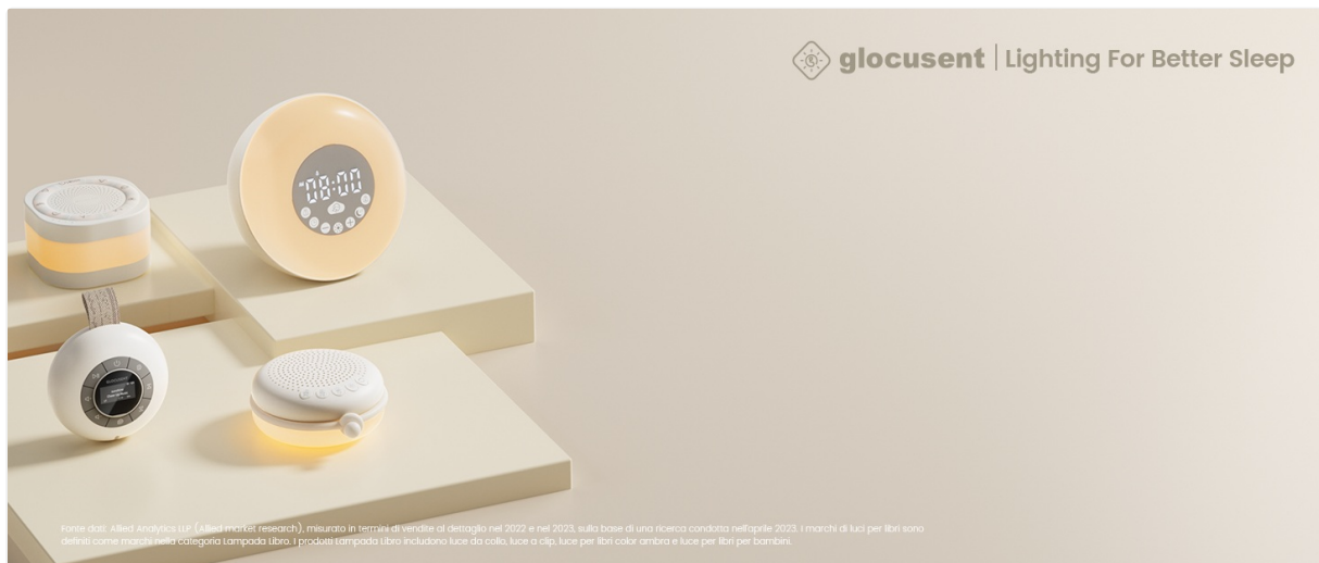
Figure 2: The Glocusent N16 offers 44 distinct sounds, including various white, pink, and brown noises, alpha brainwaves, and piano music, designed to create a calming environment for sleep.