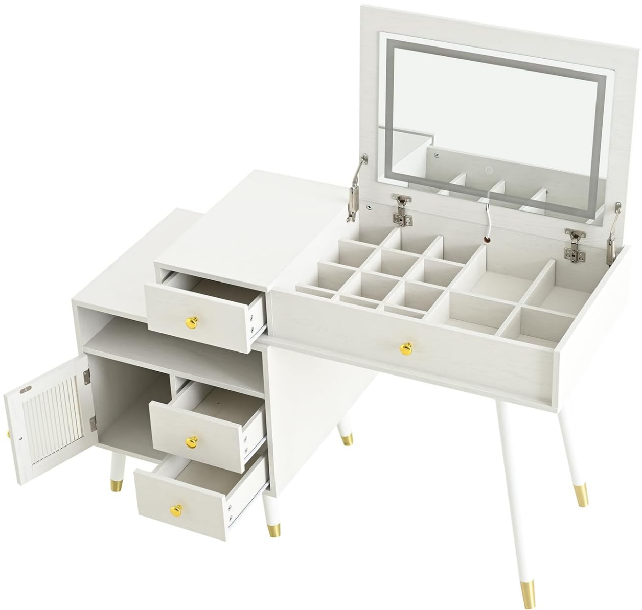
Figure 5: Overview of storage compartments.

The vanity desk offers multiple storage solutions: