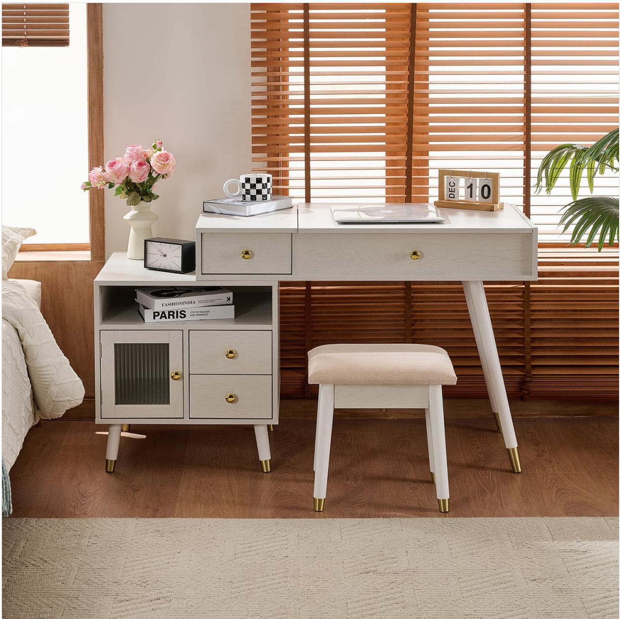
Figure 7: Vanity desk configured as a writing desk.