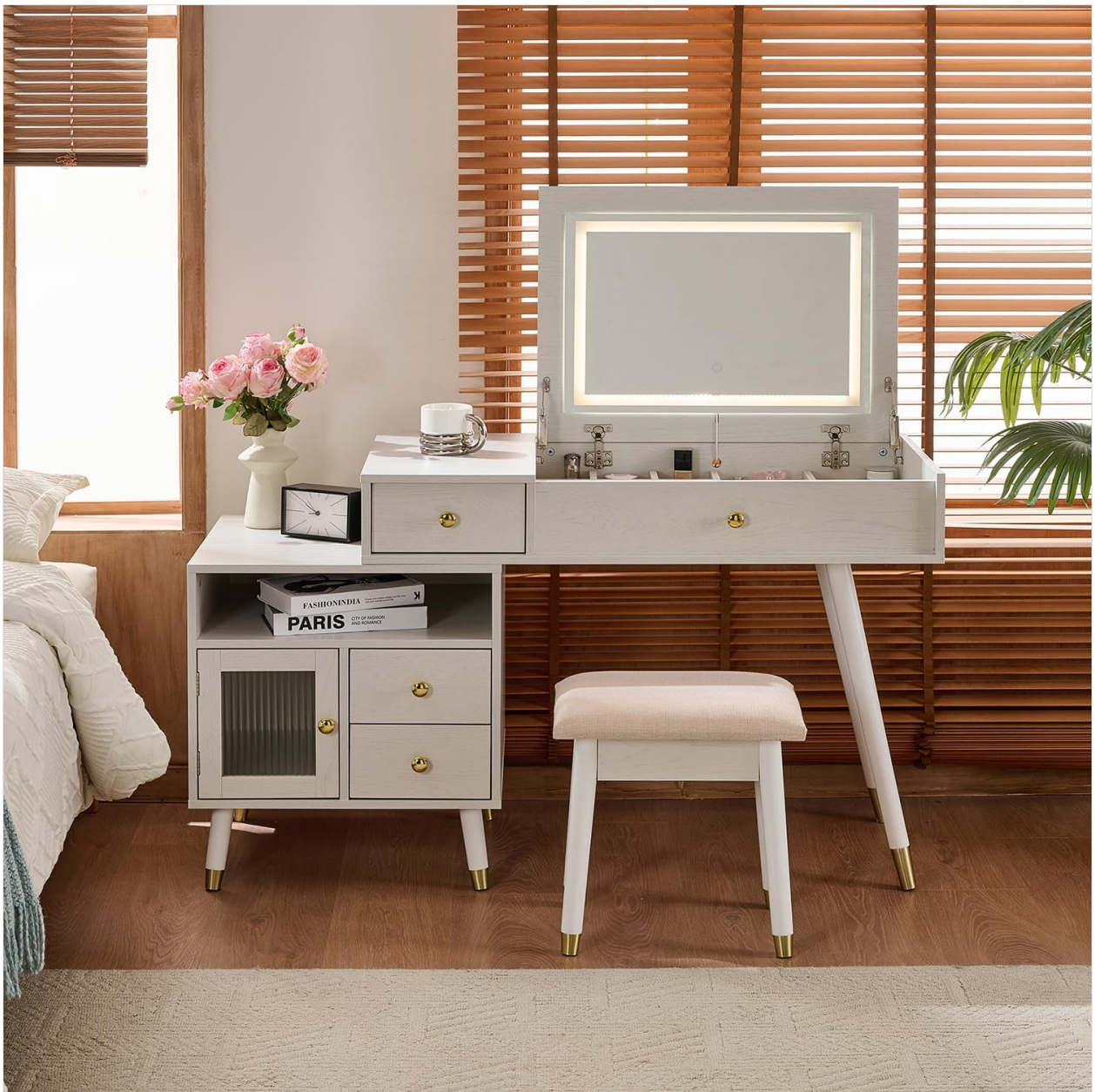
Figure 2: Vanity desk with the flip-top mirror in the open position.