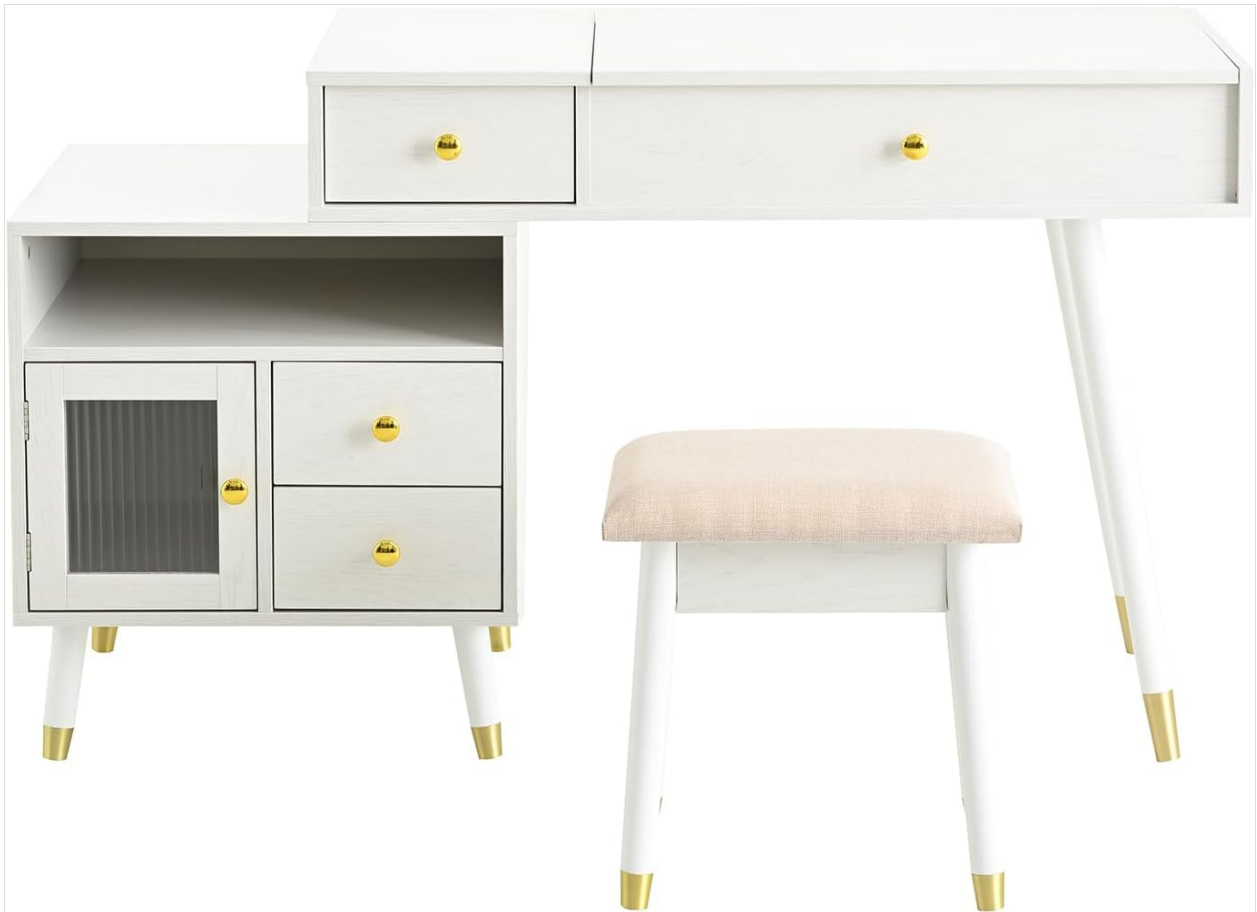
Figure 4: Vanity desk with the side cabinet extended.

The side cabinet is designed to be retractable, allowing you to adjust the overall width of the vanity desk. It can be positioned on the left, right, or tucked underneath the main desk section to reduce its footprint. Simply slide the cabinet along the designated track to your desired position.