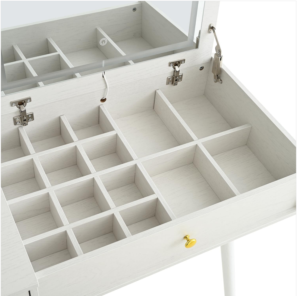
Figure 6: Detailed view of internal dividers for organization.