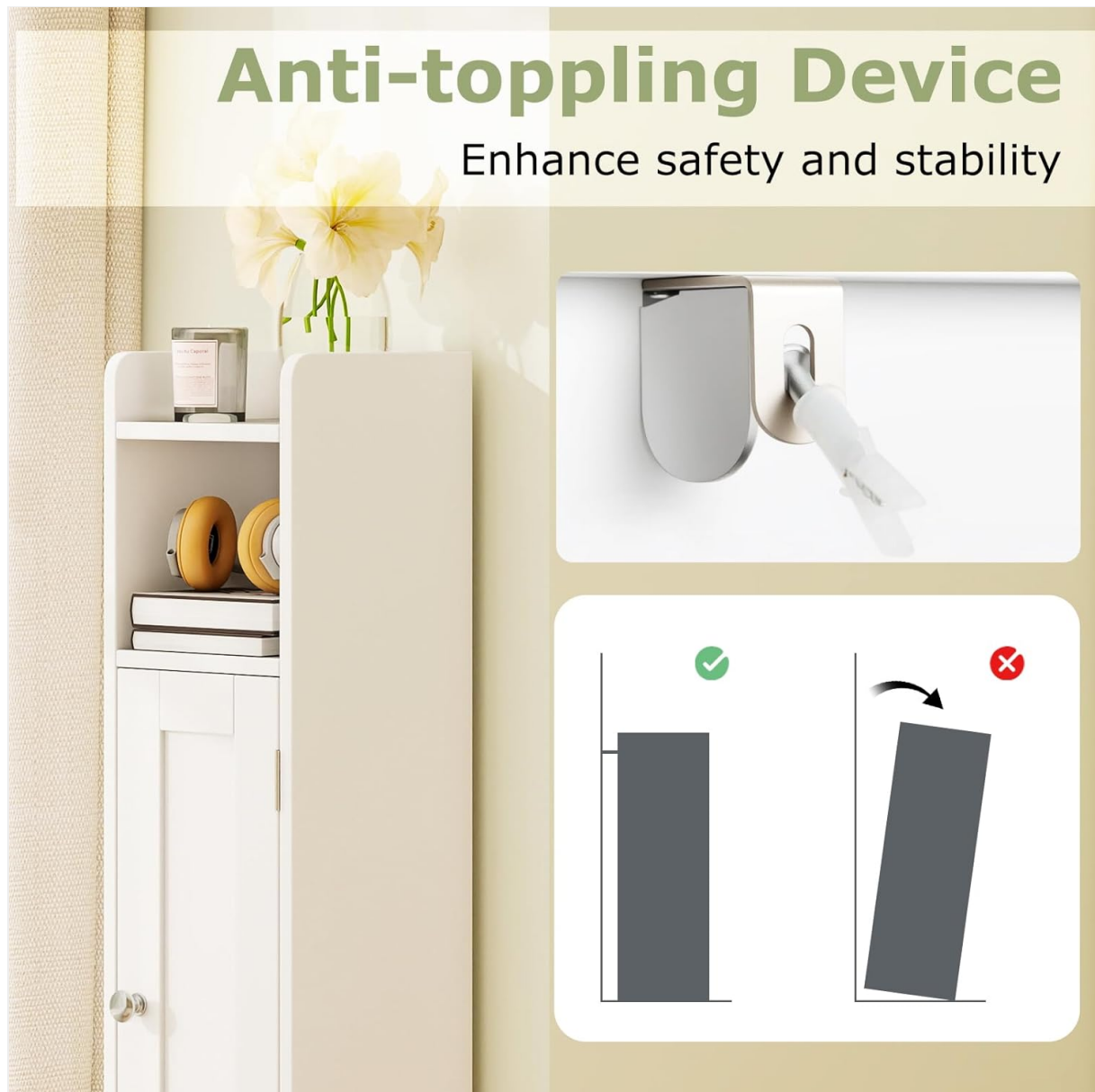
Image 3: Illustration demonstrating the proper installation of the anti-tipping device, showing how it secures the cabinet to the wall for enhanced safety and stability.