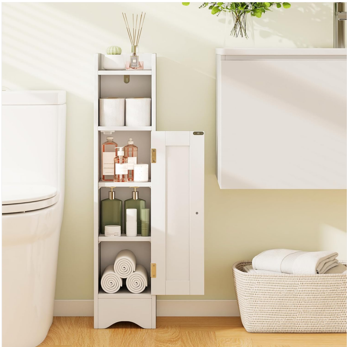
Image 5: The cabinet placed beside a toilet, with various bathroom items like toilet paper, bottles, and rolled towels stored in its compartments, illustrating its practical use.