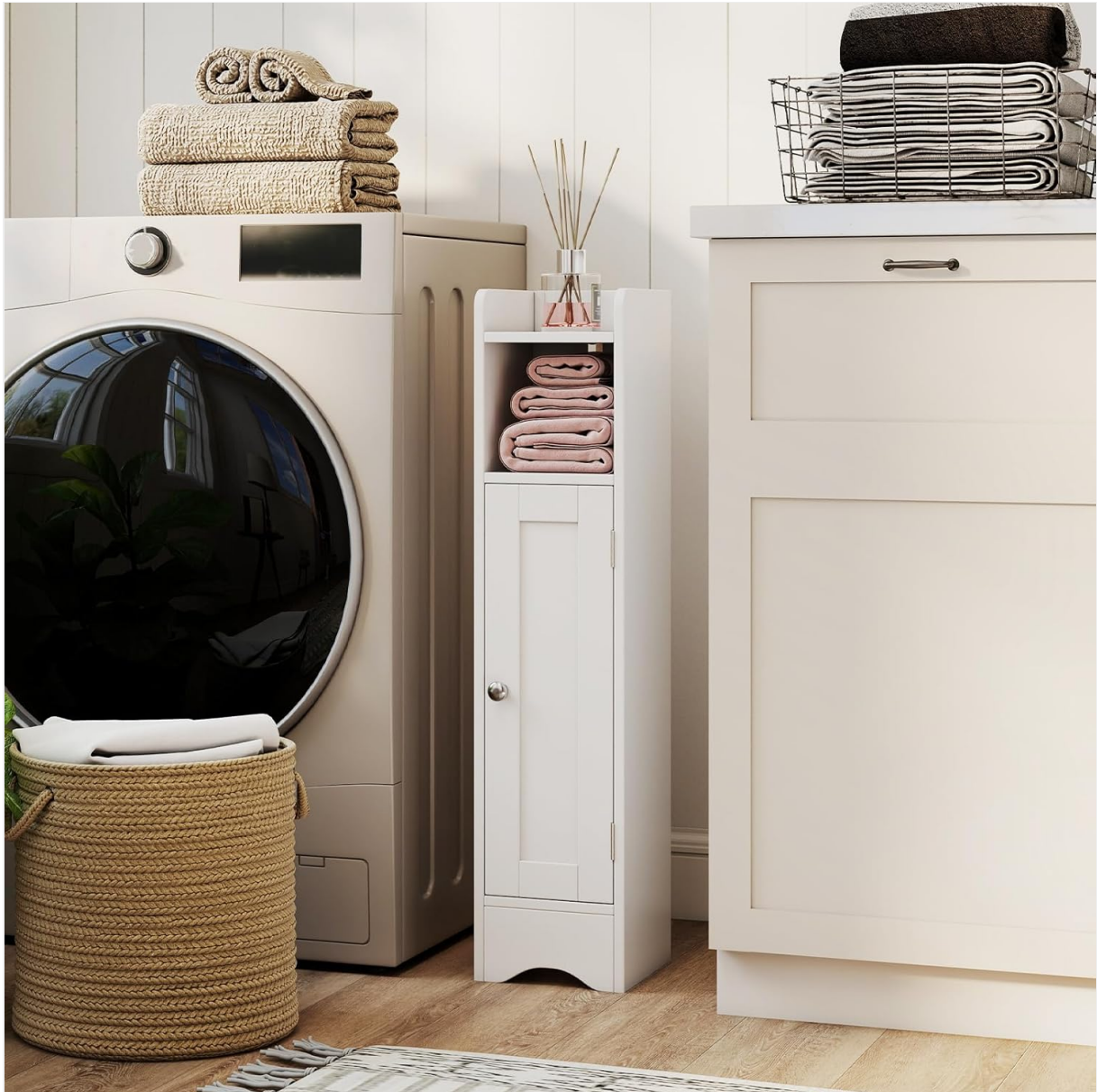
Image 1: The GIANTEX Narrow Bathroom Storage Cabinet positioned next to a washing machine, showcasing its compact size and utility in a laundry room environment. It features an open top shelf and a lower cabinet with a door.