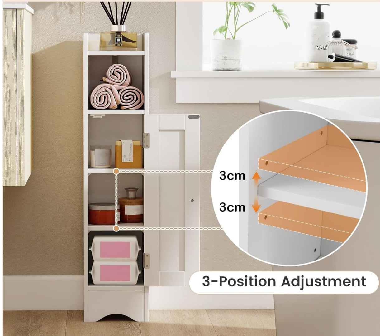
Image 4: Close-up view demonstrating the 3-position adjustment for the internal shelves, allowing users to customize storage height in 3 cm increments.