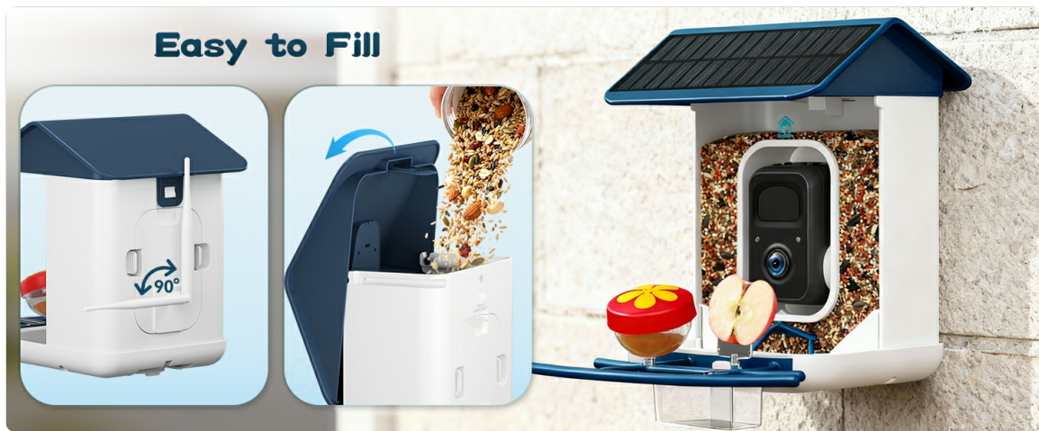
Figure 6.1: Illustration of the simple process for refilling the bird feeder with one hand.