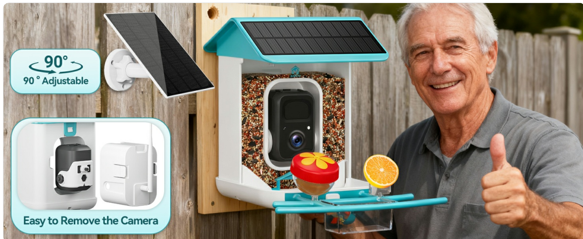
Figure 6.2: The camera unit can be easily removed for charging or cleaning.

The solar panel helps maintain the battery charge. For optimal performance, ensure the solar panel is clean and receives adequate sunlight. If the battery level drops significantly, you may need to manually charge the camera using a USB cable.