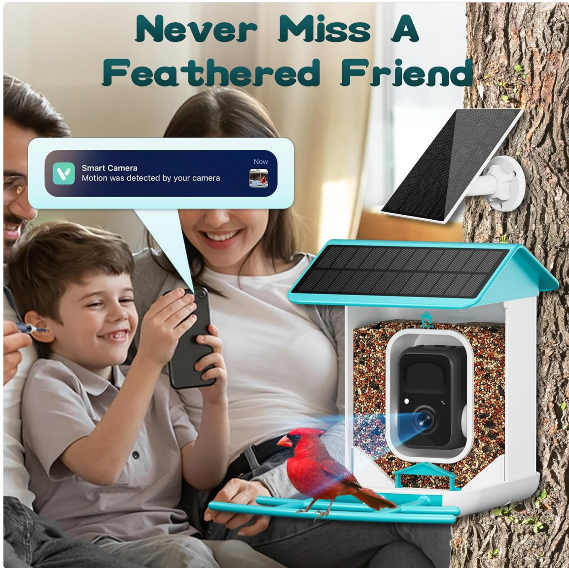
Figure 5.1: An example of a motion detection alert received on a smartphone when a bird visits the feeder.

The feeder's AI system automatically identifies visiting bird species and sends real-time alerts to your smartphone. You can view live footage or recorded events through the app.