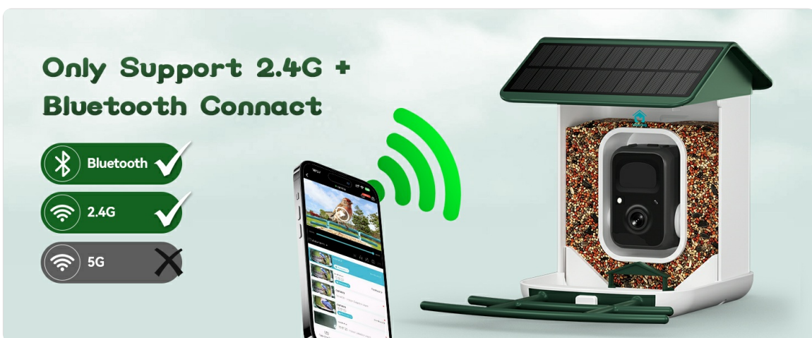
Figure 4.2: Highlights the requirement for a 2.4GHz Wi-Fi connection for optimal performance.

Video 4.1: A comprehensive guide to setting up the BROAIMX Smart Bird Feeder with Camera, including power-on and app connection steps.