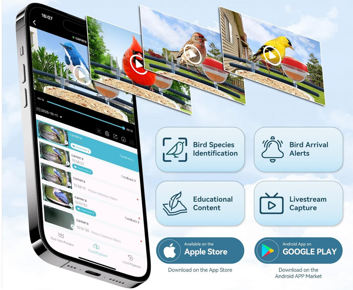
Figure 5.2: The app interface displaying captured bird videos, species identification, and options for livestream and alerts.