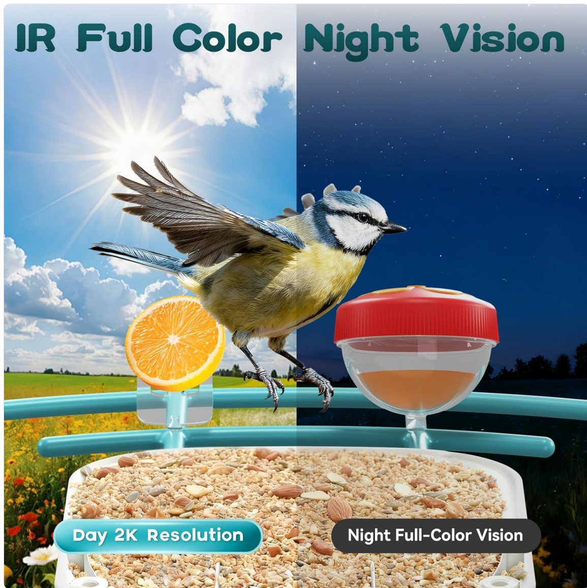
Figure 3.2: Illustrates the 2K HD day vision and full-color infrared night vision capabilities of the camera.