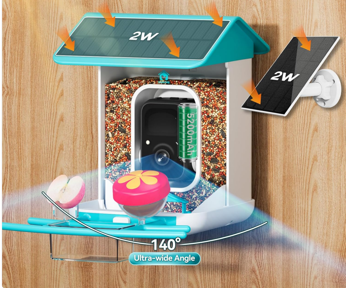
Figure 3.3: Depicts the dual power mode, utilizing both a built-in solar panel and a 5200mAh battery.