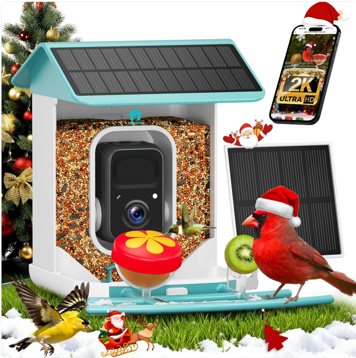
Figure 1.1: The BROAIMX Smart Bird Feeder with Camera in Light Blue, showcasing its solar panel, camera, and feeding tray.