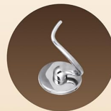
STAINLESS STEEL DOUGH HOOK

Overview of the heavy-duty stand mixer and its included stainless steel attachments.