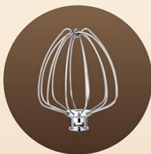
STAINLESS STEEL WHISK

Length: 15 Inches Width: 7.5 Inches Height: 13.8 Inches