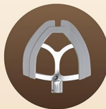
STAINLESS STEEL FLEXING PADDLE