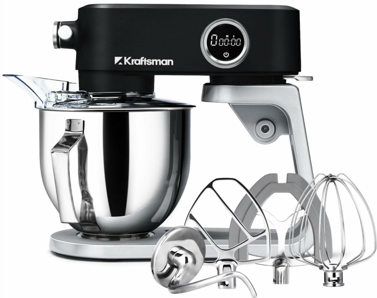
The Kraftman Stand Mixer KM50, ready for use in a modern kitchen.