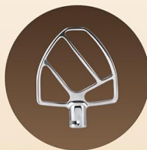
STAINLESS STEEL FLAT BEATER