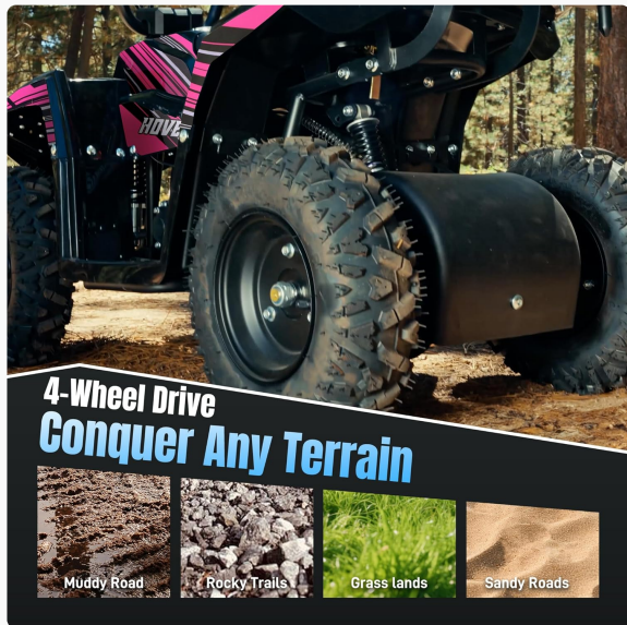
Figure 4.2: Visual representation of the ATV's capability to handle various terrains, including muddy roads, rocky trails, grasslands, and sandy roads. This image highlights the versatility of the 4-wheel drive system.