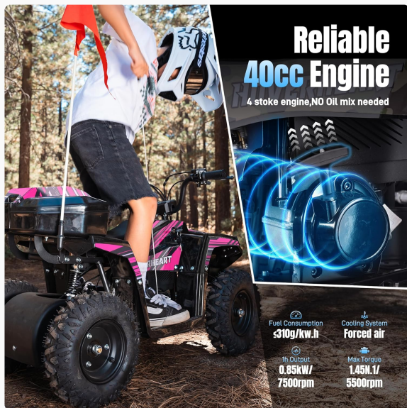
Figure 2.2: Close-up view of the reliable 40CC 4-stroke engine. This image details the engine's components, emphasizing its power and design for smooth operation without the need for oil mixing.