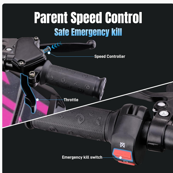
Figure 4.1: Close-up of the parental speed controller and emergency kill switch on the handlebar. This image illustrates the safety features allowing adults to manage the ATV's speed and quickly stop the engine if needed.