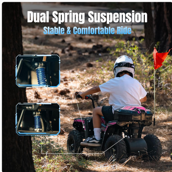
Figure 2.4: Detailed view of the dual spring suspension system. This image emphasizes the design that provides a stable and comfortable ride, absorbing shocks on uneven terrain.