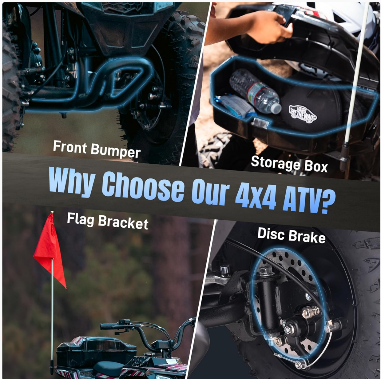
Figure 3.1: Key features of the ATV including the front bumper, rear storage box, flag bracket, and disc brake system. This image provides a visual guide to these components, important for both assembly and understanding the vehicle's capabilities.

adequate stopping power. Adjust if needed.