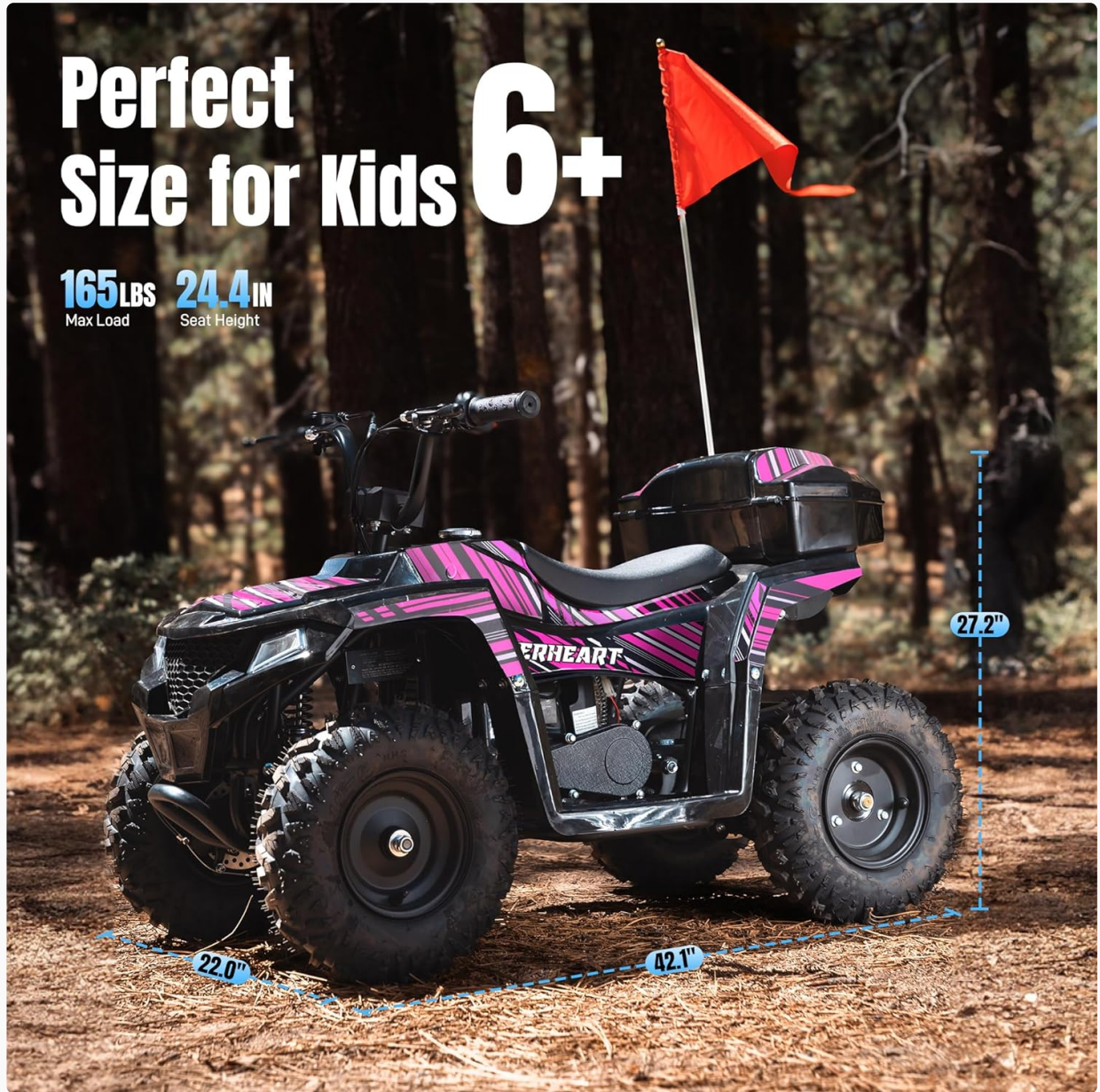
Figure 7.1: Visual representation of the ATV's dimensions, illustrating its size and suitability for children. This image helps in understanding the physical footprint and ergonomic design for young riders.