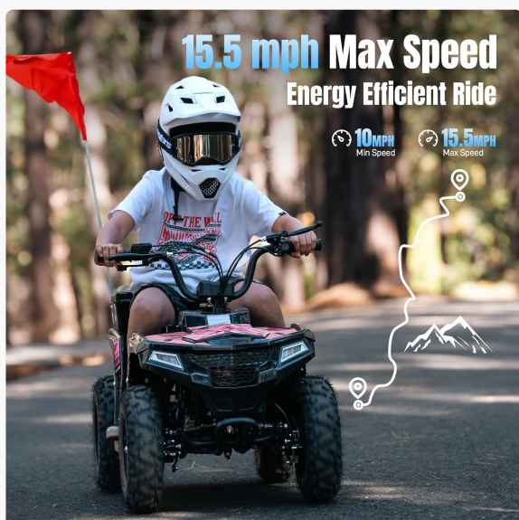
Figure 2.3: Illustration of the adjustable speed control feature. This image shows the throttle and speed controller, highlighting how parents can set the maximum speed for their child's safety and skill level.