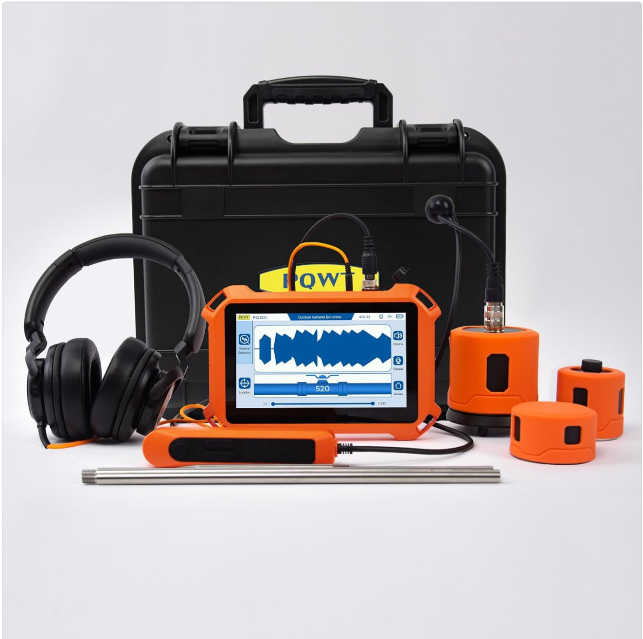
Image: The PQWT PQ125C main unit with its touchscreen display and an attached sensor, demonstrating its use in an urban environment.