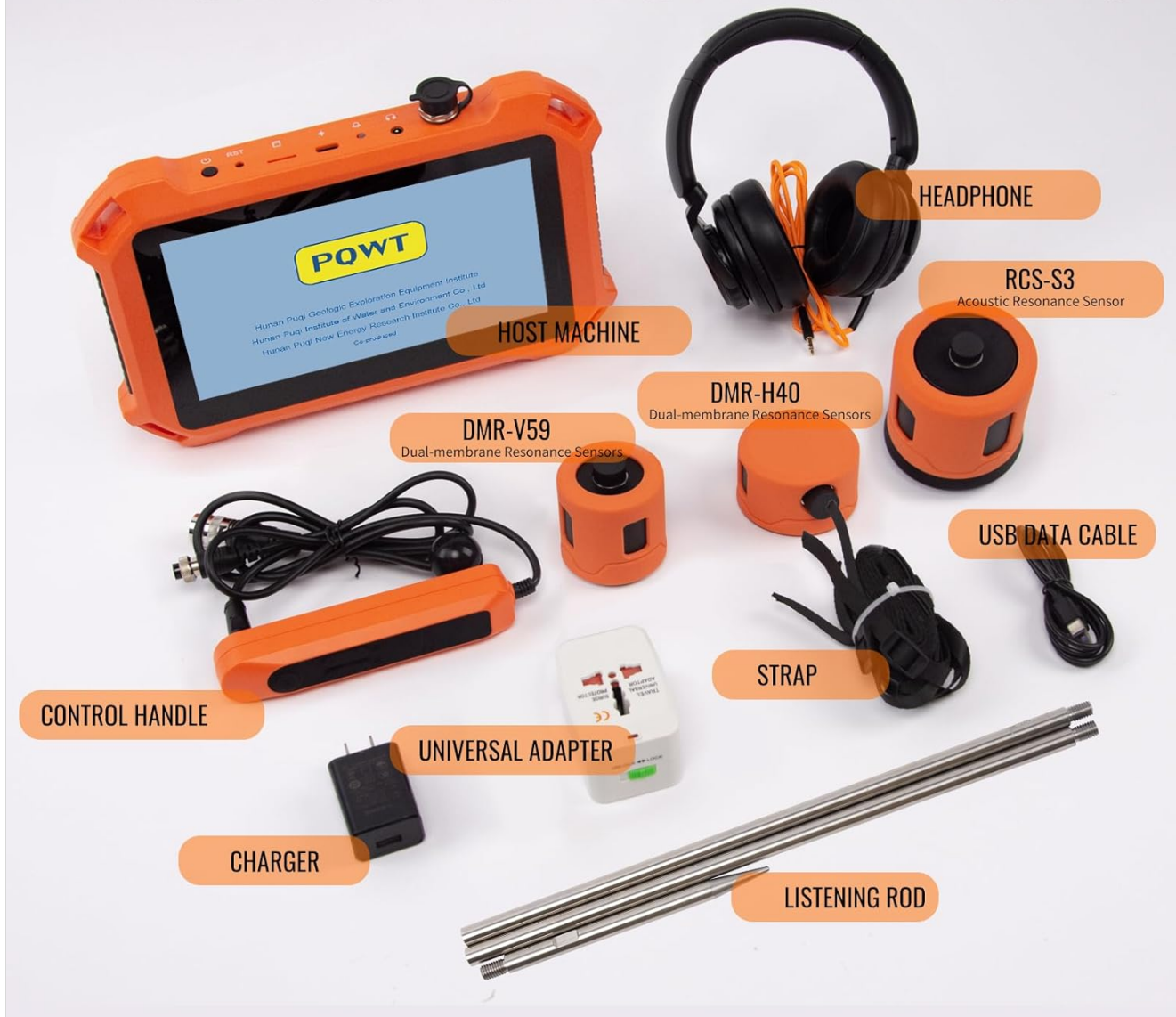
Image: All components of the PQWT PQ125C kit laid out, including the host machine, sensors, headphones, and accessories.

Video: An unboxing video demonstrating the contents of the PQ125 Series Pipe Water Leak Detector package.