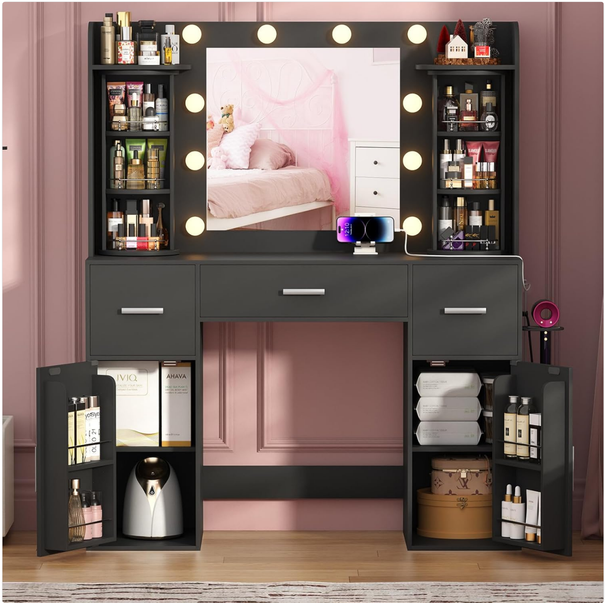
Figure 2.4: Three drawers and two cabinets offer ample storage for makeup, skincare, and other personal items.