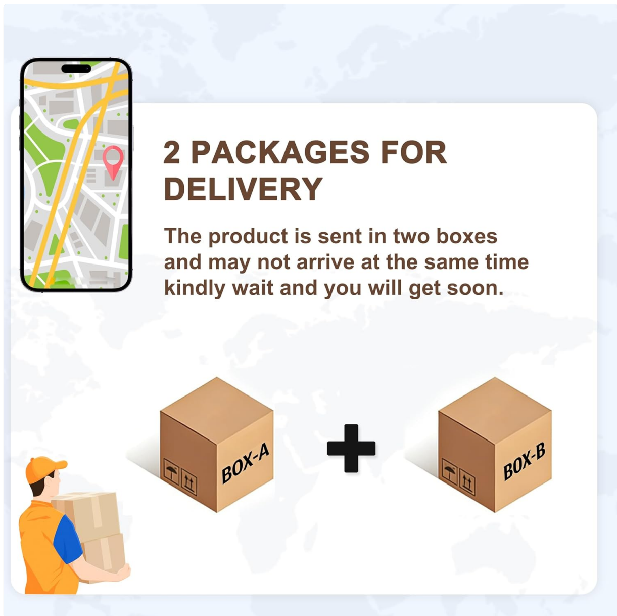
Figure 1.1: The vanity desk is delivered in two separate packages. Ensure both 'Box-A' and 'Box-B' are received before starting assembly.