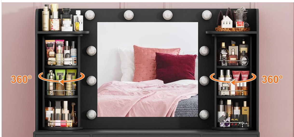
Figure 2.1: The 360° rotating organizers provide convenient access to stored items, including jewelry, skincare, and makeup brushes.