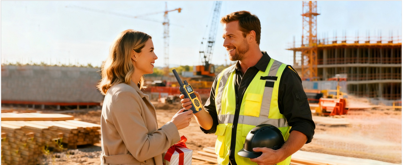
Image: The DURLK walkie talkies offer dual charging methods: via charging dock or directly via USB-C cable.