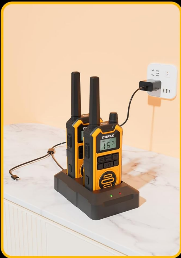
Charging Base Station