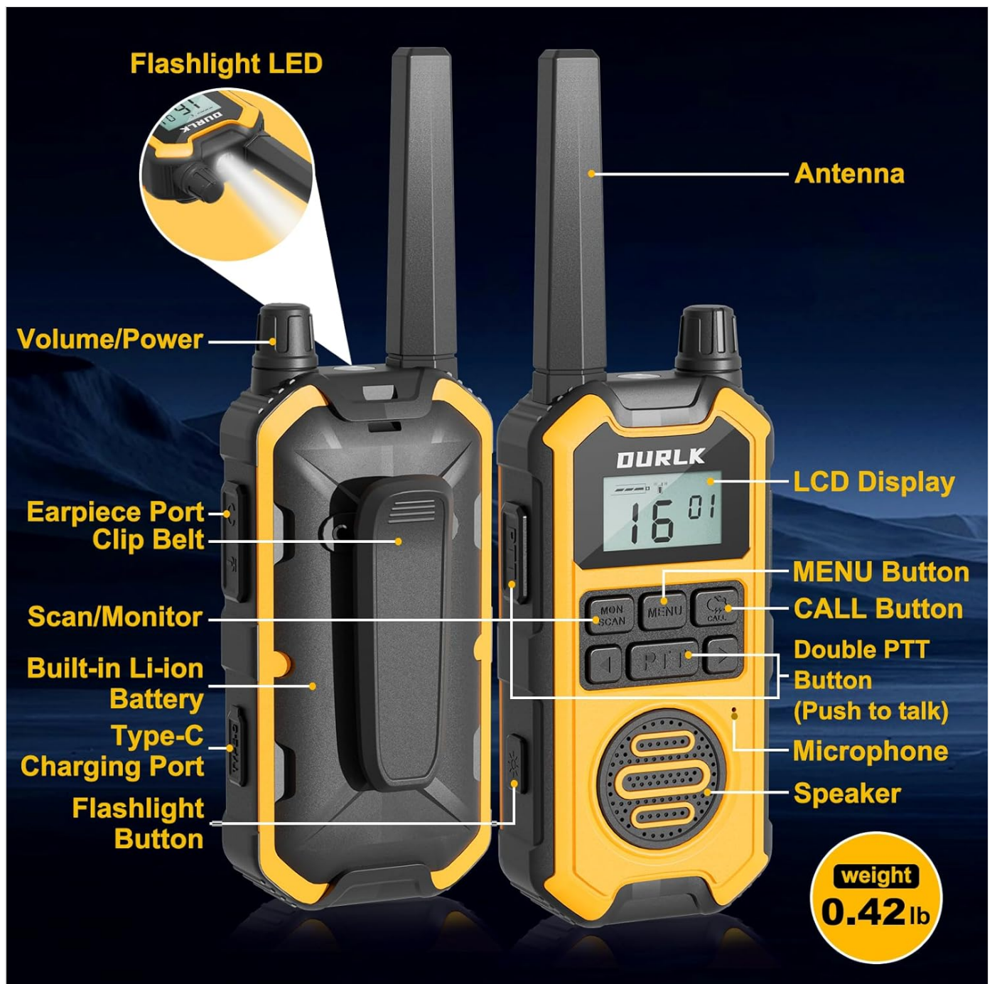
Image: Front and side view of the DURLK BD-01 walkie talkie with labeled components.