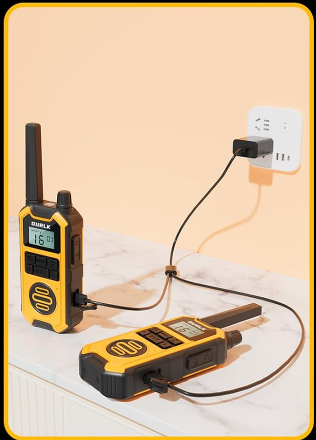
USB-C Cable (Includes Adapter)

Image: The DURLK walkie talkie features dual PTT buttons for convenient use.