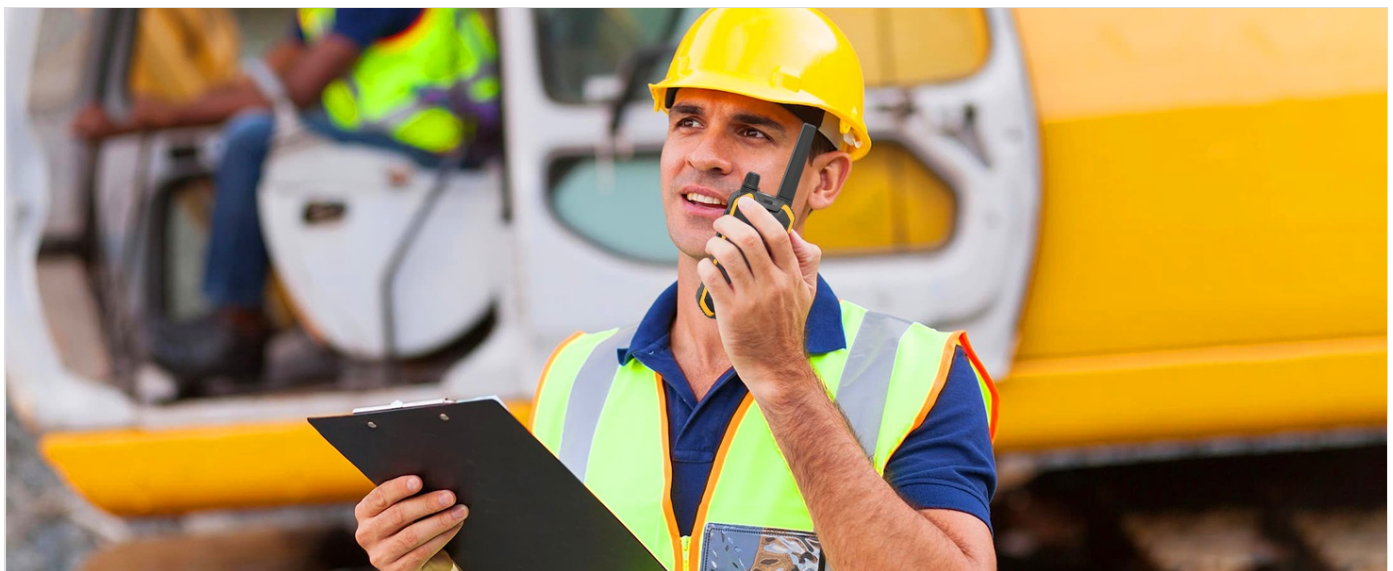
Image: The keypad lock feature prevents accidental changes to settings.

To prevent accidental changes to your settings, you can activate the keypad lock. Refer to the full user manual for instructions on how to enable and disable this feature.