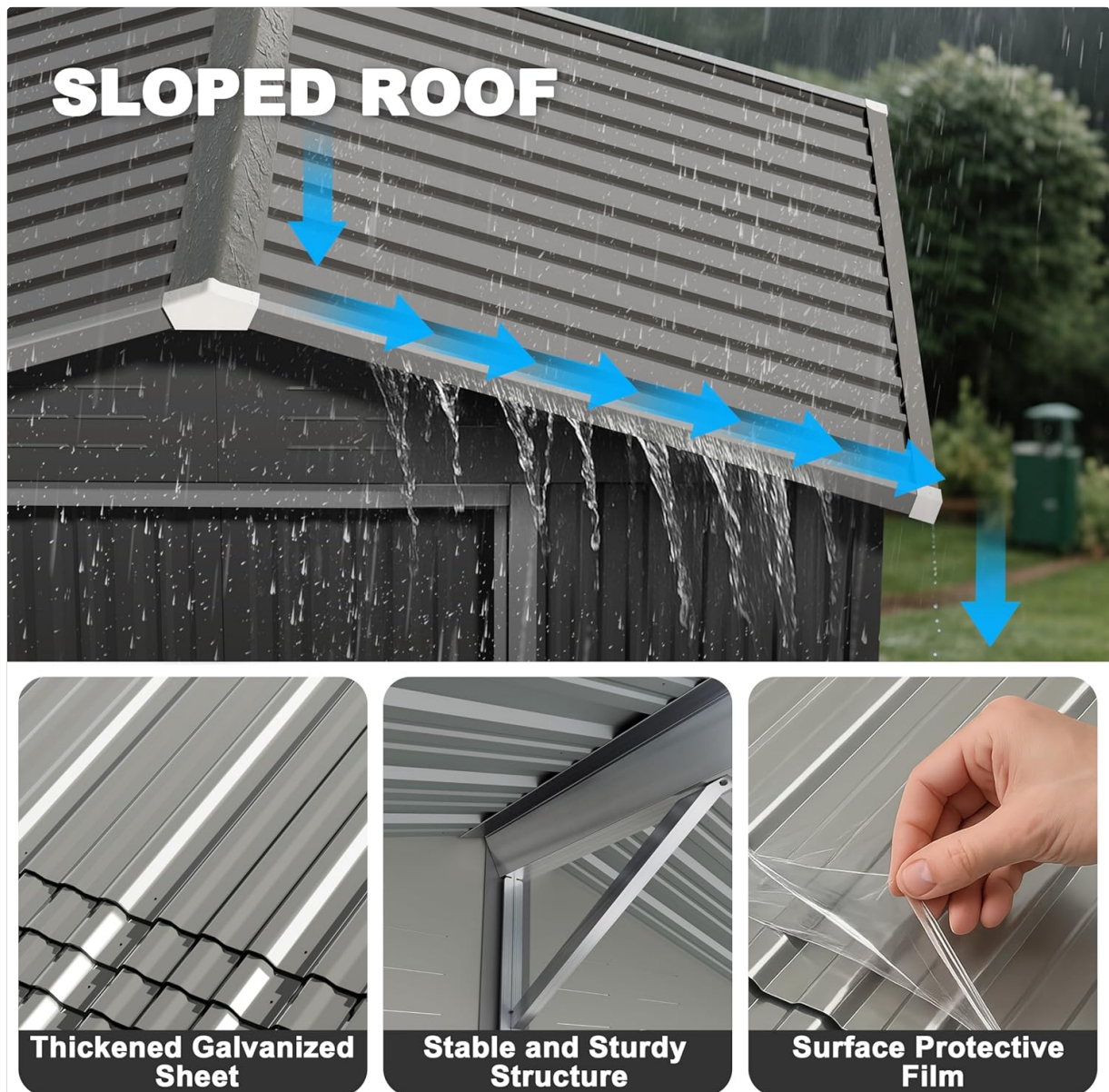
Image 3.3: Details of the sloped roof construction, highlighting the thickened galvanized sheet and stable structure.