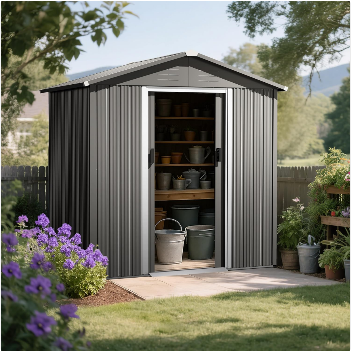
Image 1.1: The NUU GARDEN Outdoor Storage Shed, Model GS001-01, in a typical backyard environment.