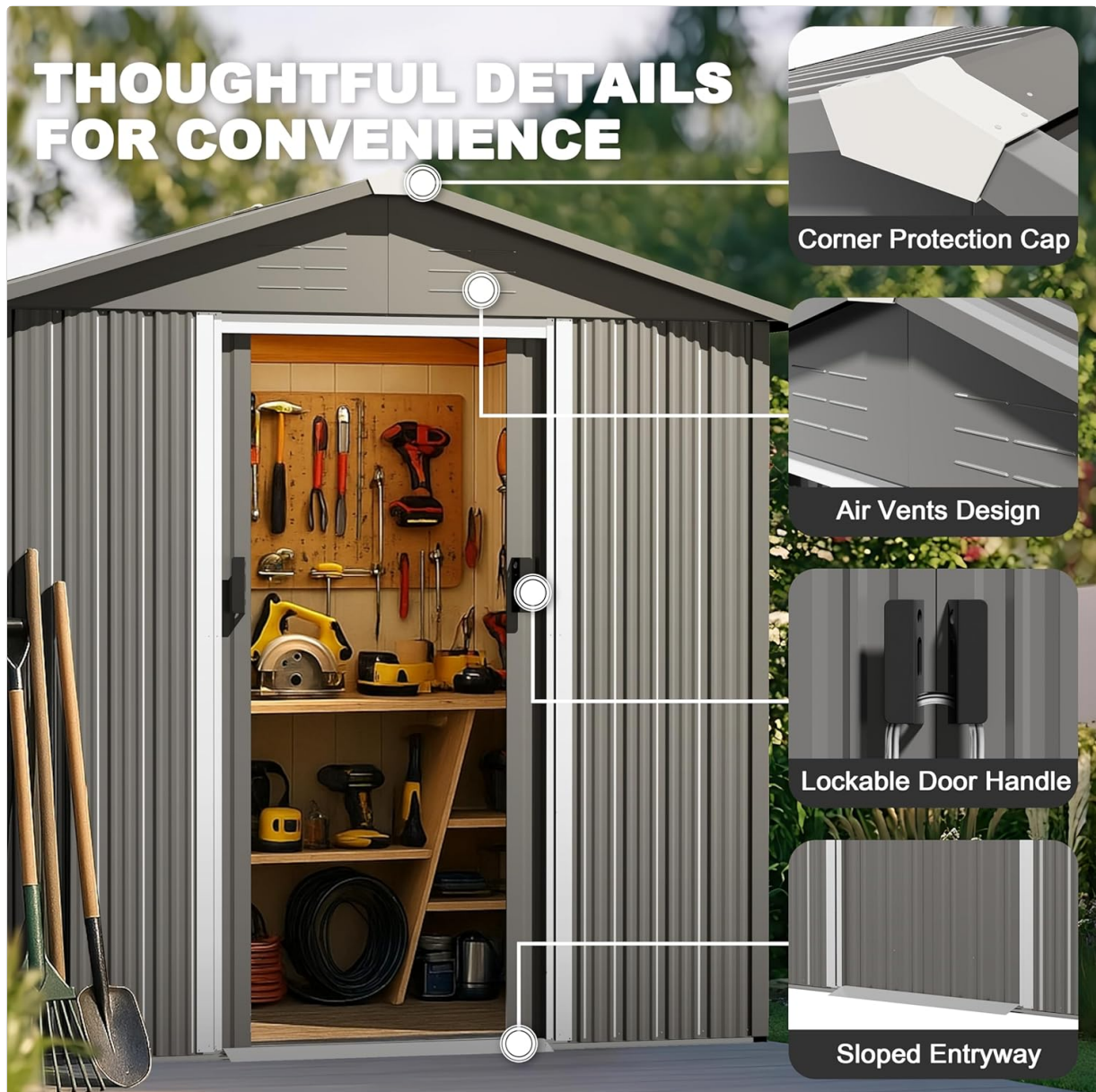
Image 3.2: Thoughtful details for convenience, showing the corner protection cap, air vents design, lockable door handle, and sloped entryway.