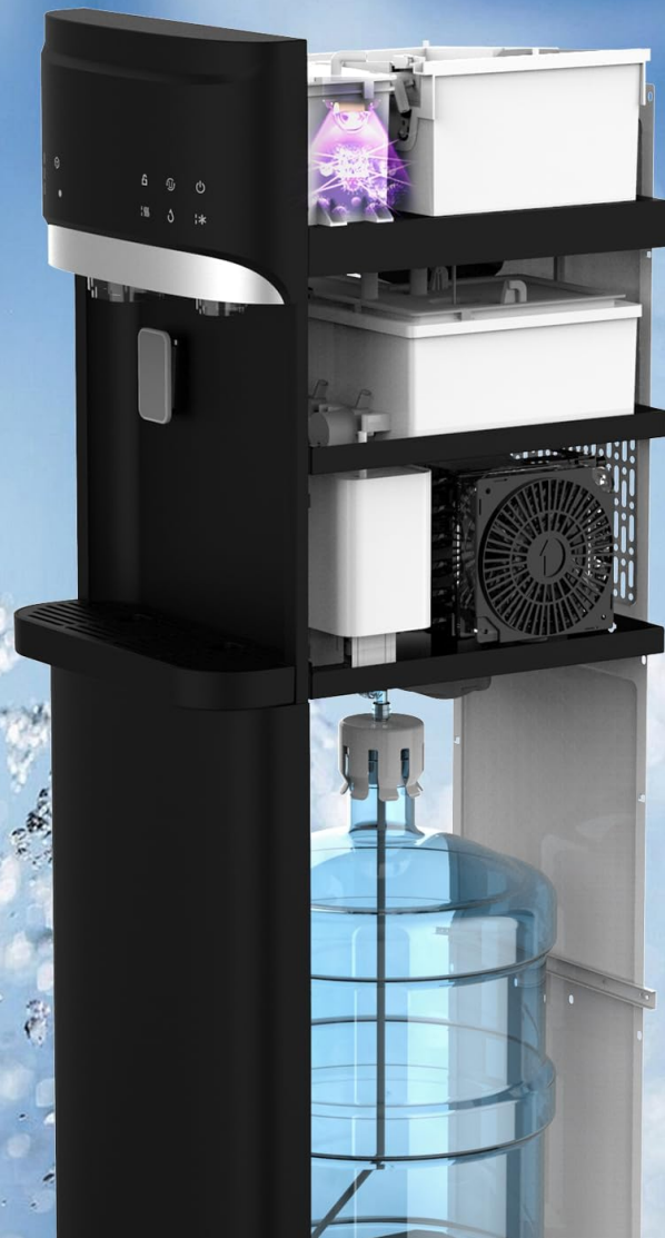
Image: UV-Infused Cleaning. This diagram illustrates the UV technology integrated into the water dispenser, which works to reduce harmful contaminants in the water and tanks, thereby improving water taste and reducing maintenance needs.