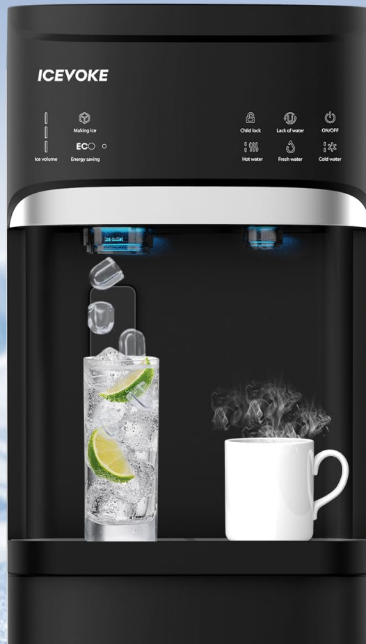
Image: Easy-to-Use Control Panel. This image displays the intuitive control panel of the ICEVOKE water dispenser, featuring touch screen operation, ECO mode for energy saving, and a child safety lock for hot water.