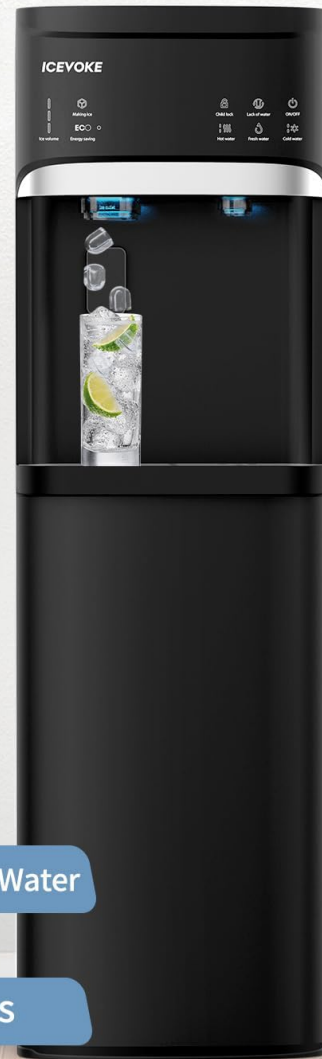
Image: Smart Integrated Design. This image highlights the integrated design of the ICEVOKE 3-in-1 machine, combining a water cooler dispenser and an ice maker, offering hot, cold, room temperature water, and ice cubes.