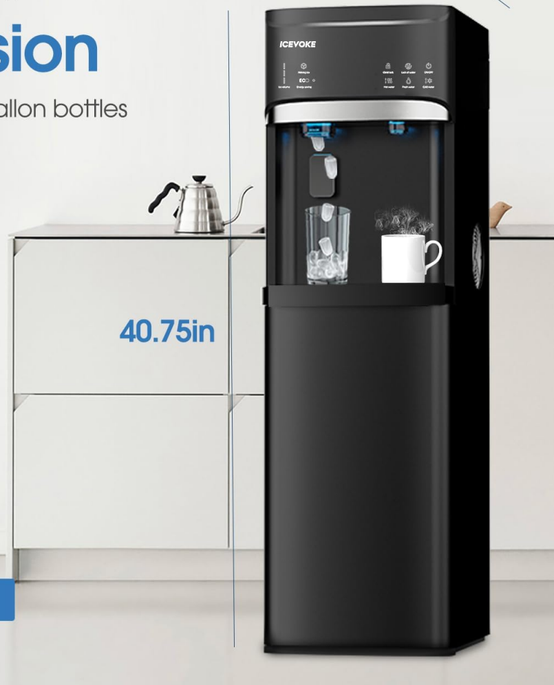
Image: Product Dimensions. This diagram provides the overall dimensions of the ICEVOKE water dispenser (12.2in W x 16.54in D x 40.75in H) and indicates its compatibility with standard 3-5 gallon water bottles. It also shows the ETL certification logo.