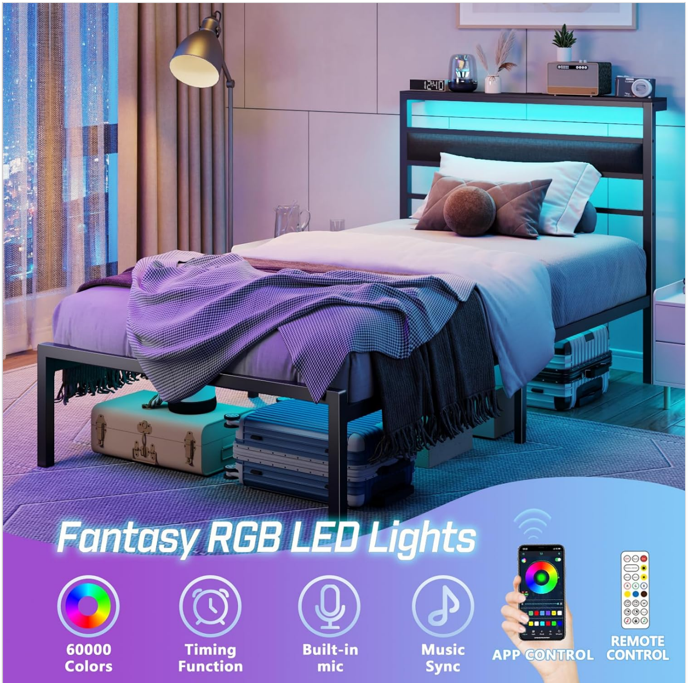
Image Description: A bedroom scene showcasing the bed frame with its RGB LED lights set to a purple hue, creating a dynamic and colorful ambiance. The image highlights the lighting feature for gaming or relaxation.