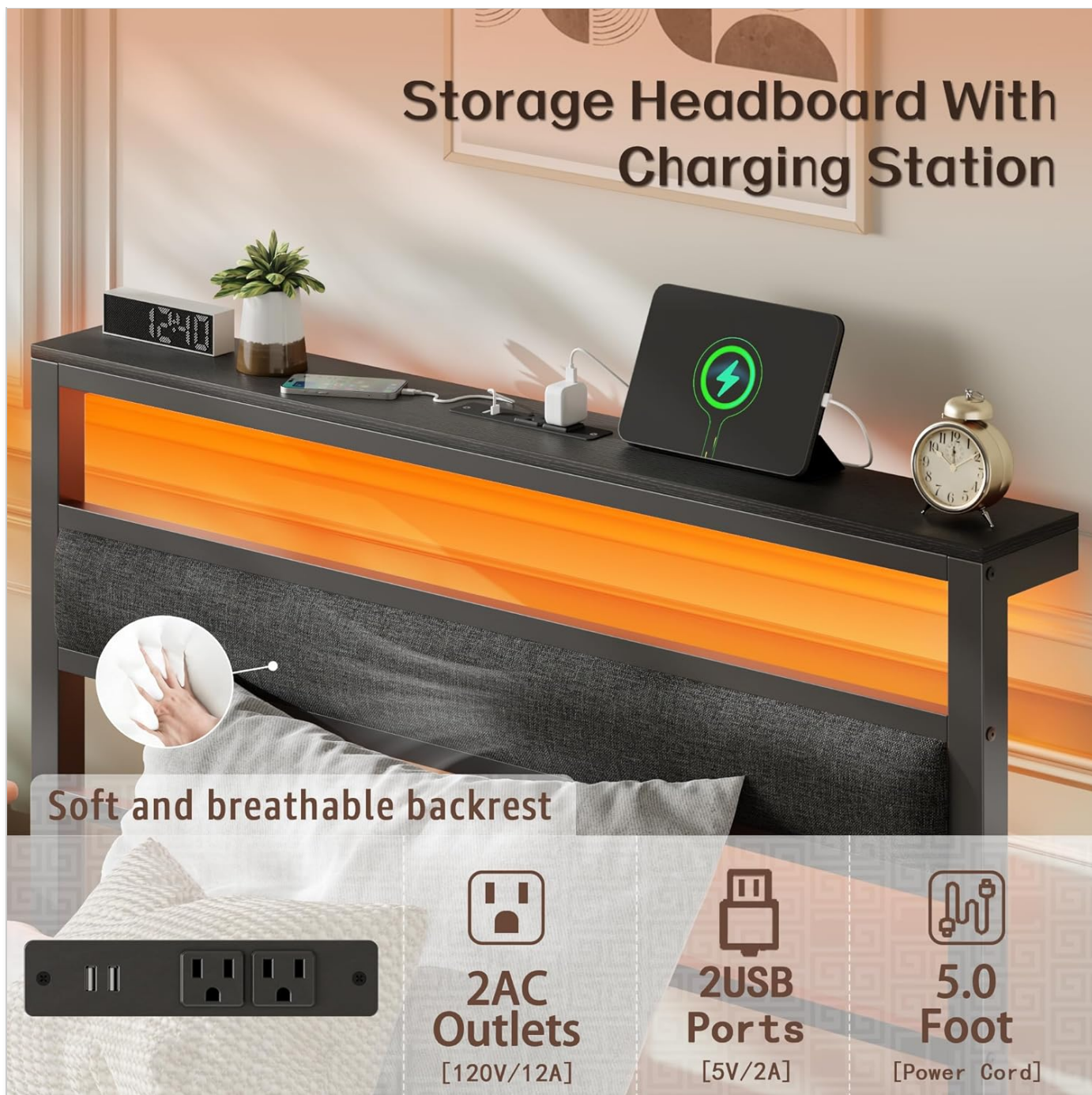
Image Description: A detailed view of the bed frame's headboard, emphasizing the integrated charging station with two AC outlets and two USB ports. The image also highlights the soft-touch upholstered backrest for comfort.