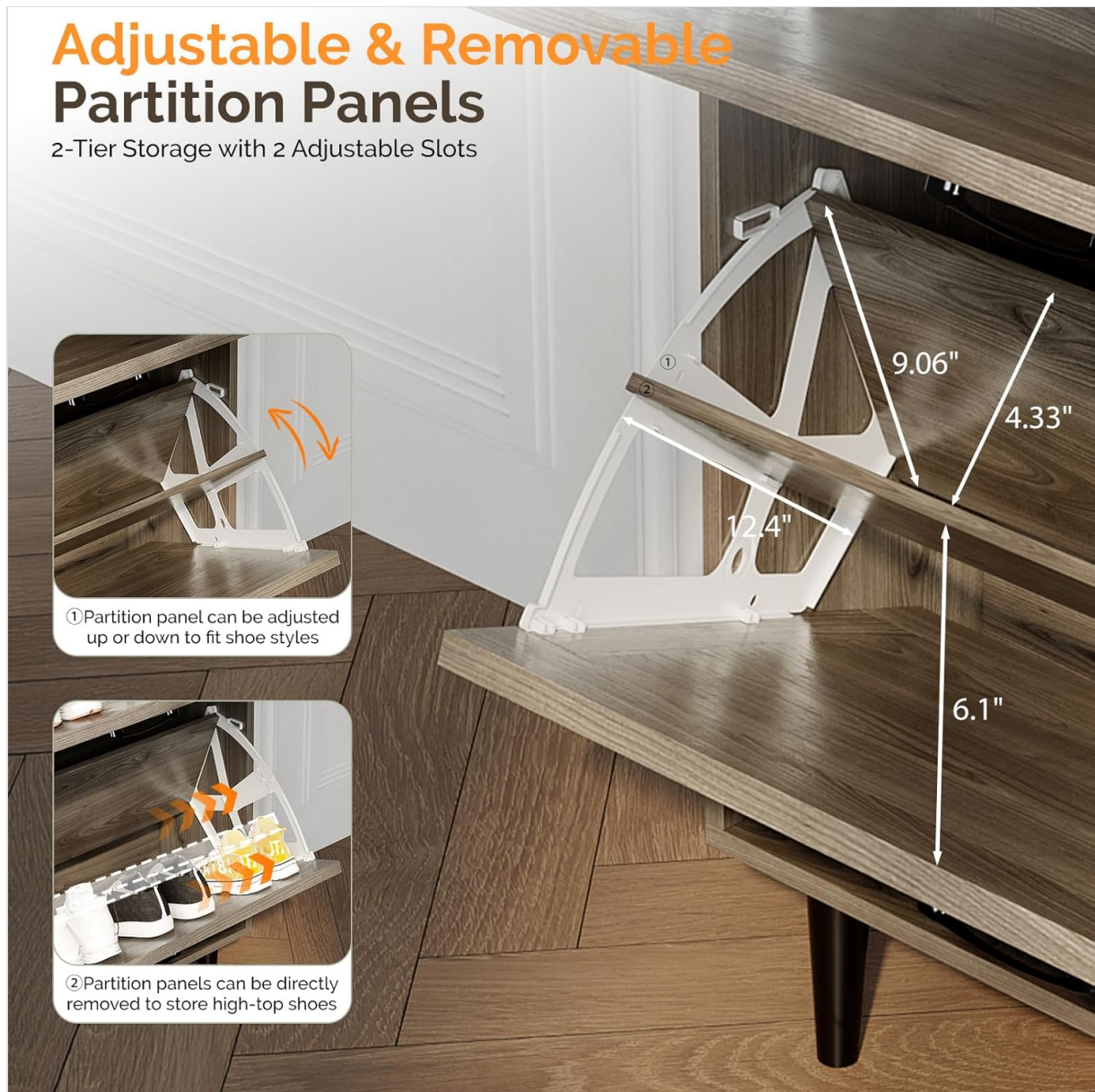
Figure 4.3: Adjustable and Removable Partition Panels

② Partition panels can be directly removed to store high-top shoes