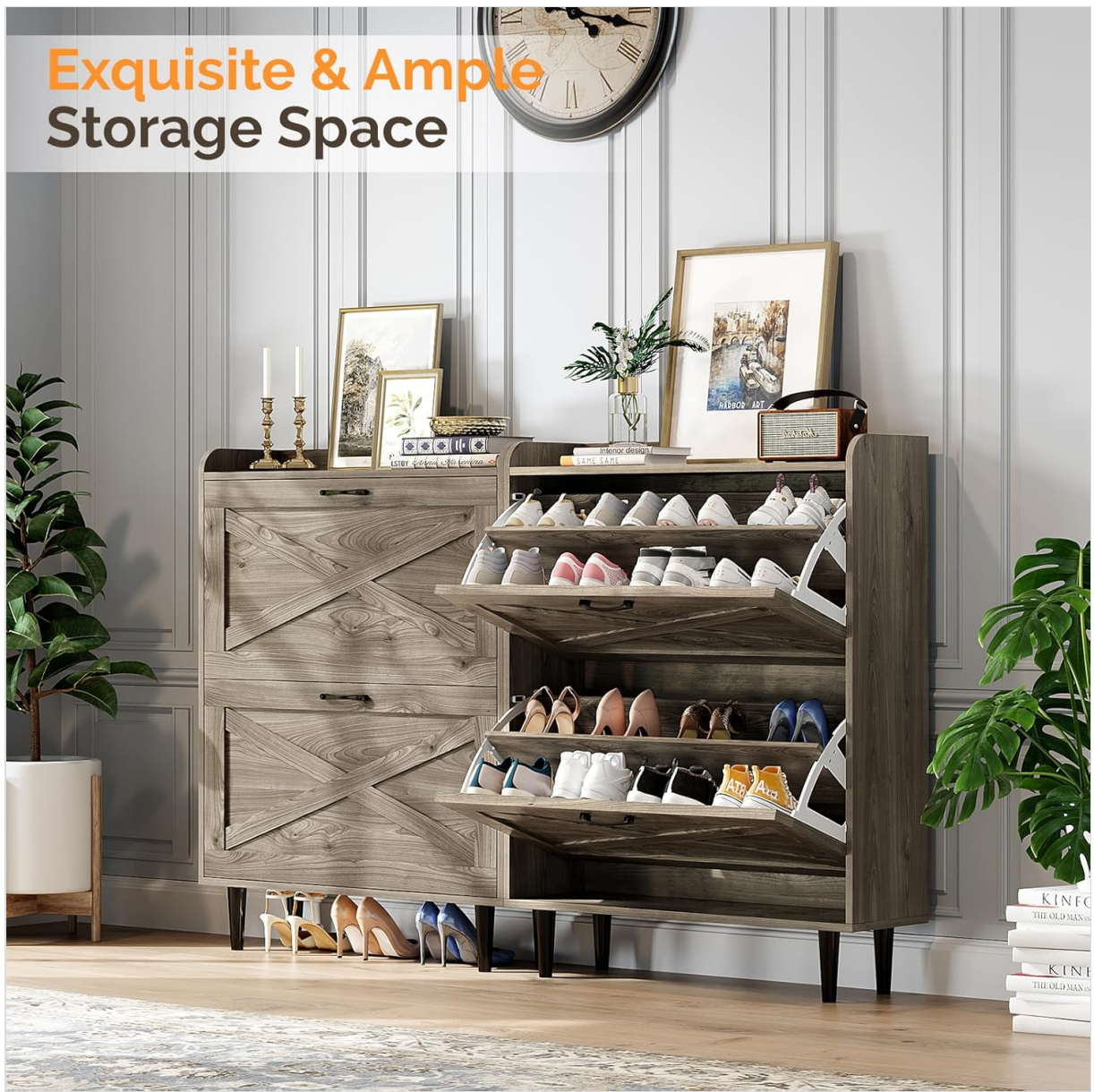
Figure 4.2: Versatile Shoe Storage Capacity