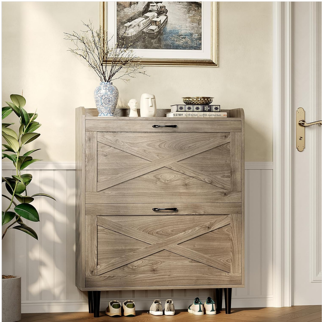
Figure 1.1: VINGLI SC0HG2F Shoe Storage Cabinet (Closed)