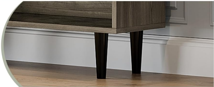
Figure 4.4: Detailed Product Features