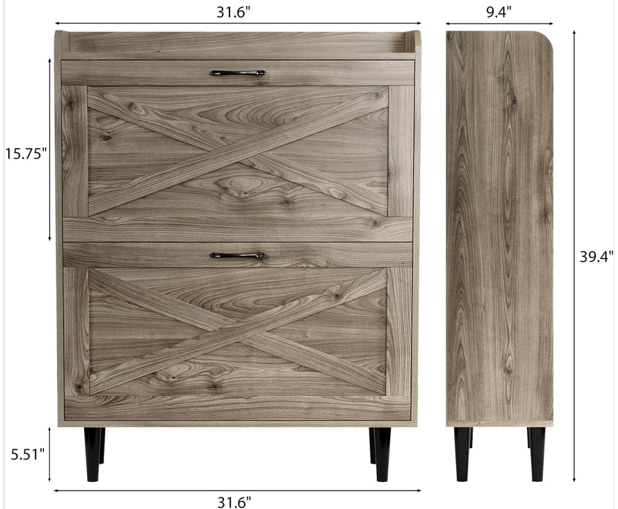
Figure 4.1: Product Dimensions