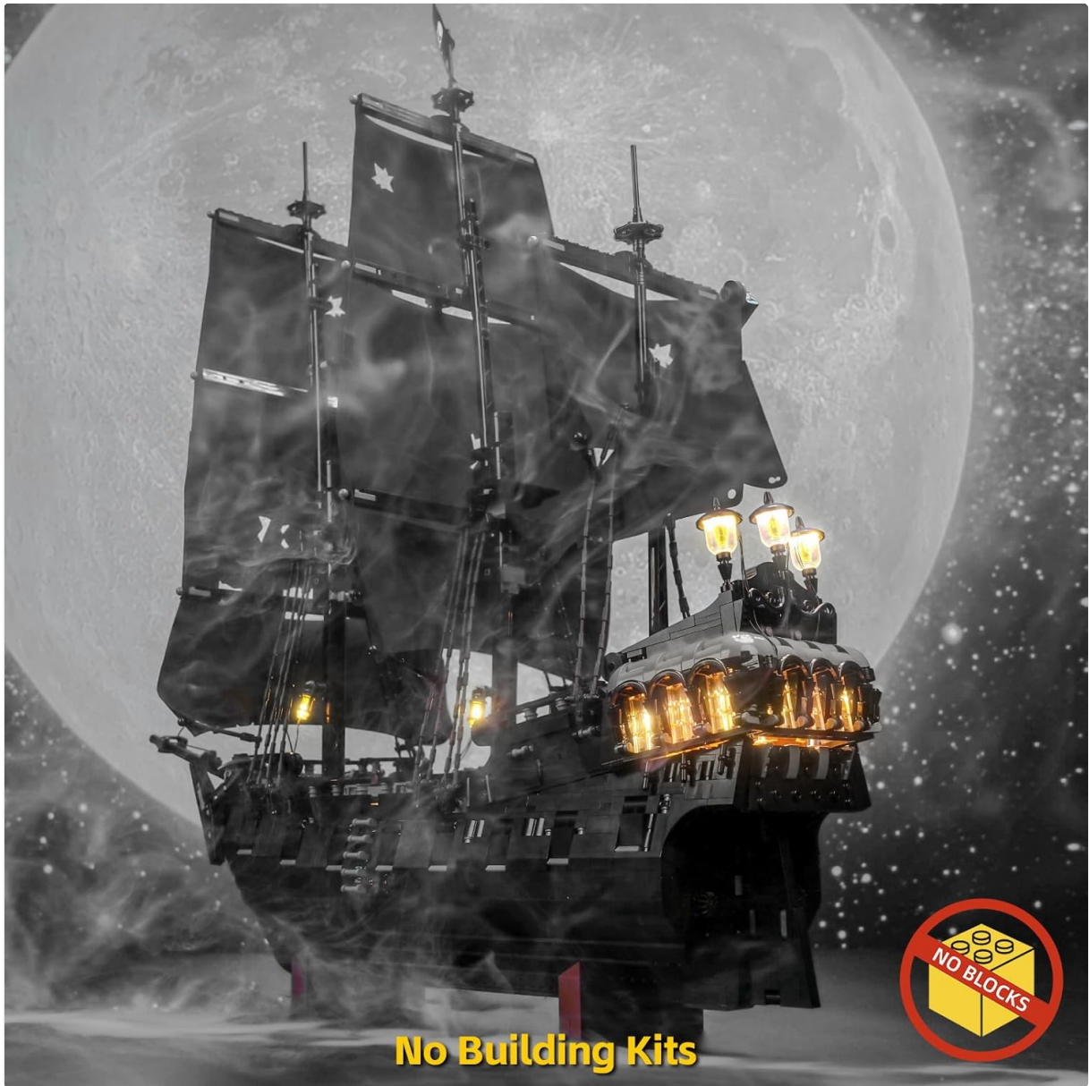
Image: The Lego Black Pearl model illuminated by the BrickBling LED Light Kit, showcasing the overall lighting effect.