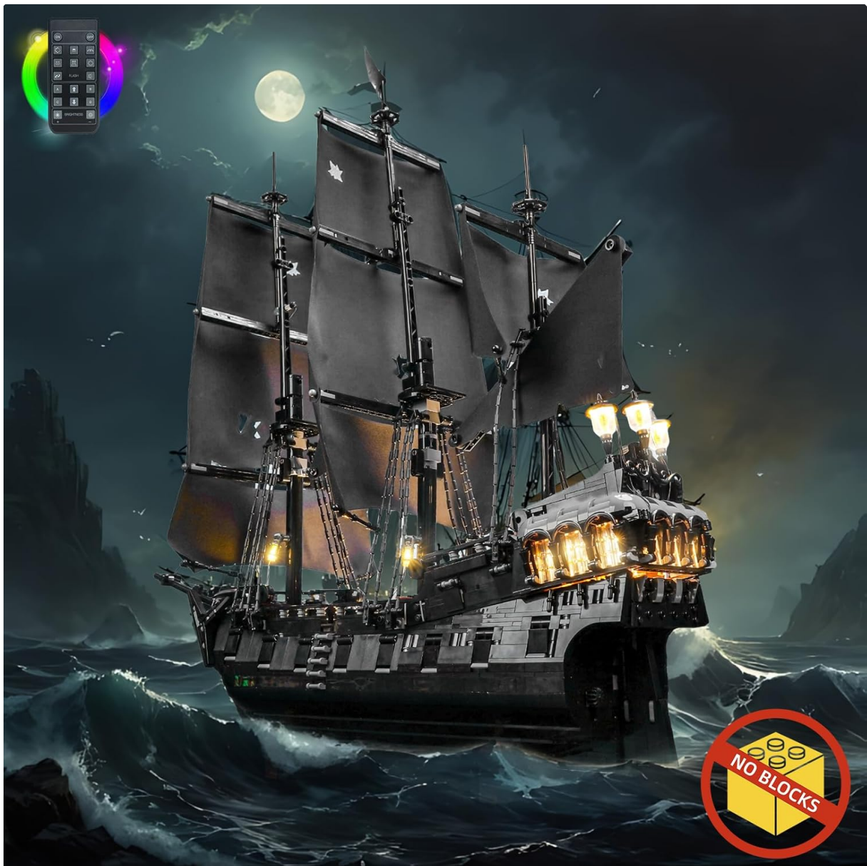
Image: The illuminated Lego Black Pearl model with the remote control visible in the corner, indicating the remote-controlled functionality of the light kit.