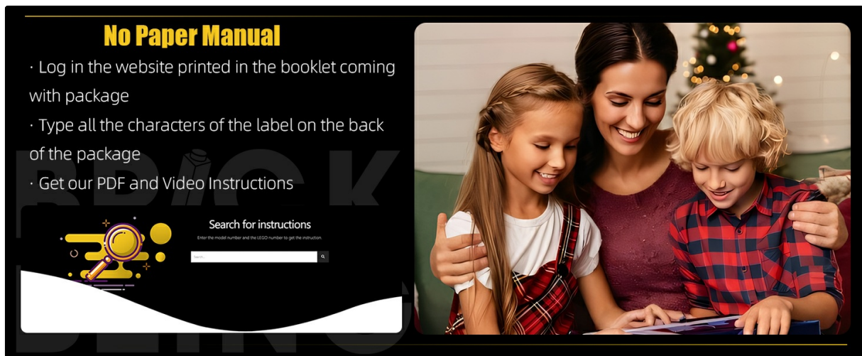
Image: Illustration showing how to access the online PDF and video instructions by visiting a website and entering a product code.