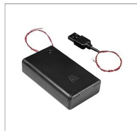
1 × Power Supply

Image: Contents of the BrickBling LED Light Kit package, including light components, connecting cables, expansion board, remote control, power supply, and an instruction booklet.