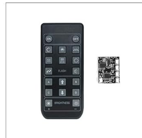
1 × Remote Control