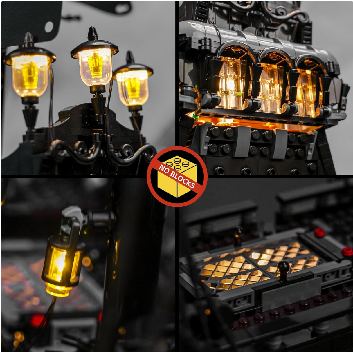
Image: Detailed close-up views of various sections of the Lego Black Pearl model, highlighting the intricate placement and illumination provided by the BrickBling LED lights, including lanterns and interior lighting.