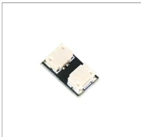
1 × 2 Expansion Board