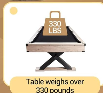
Table weighs over 330 pounds

Image: Details of the table's stable structure, including metal corners and thickened base.