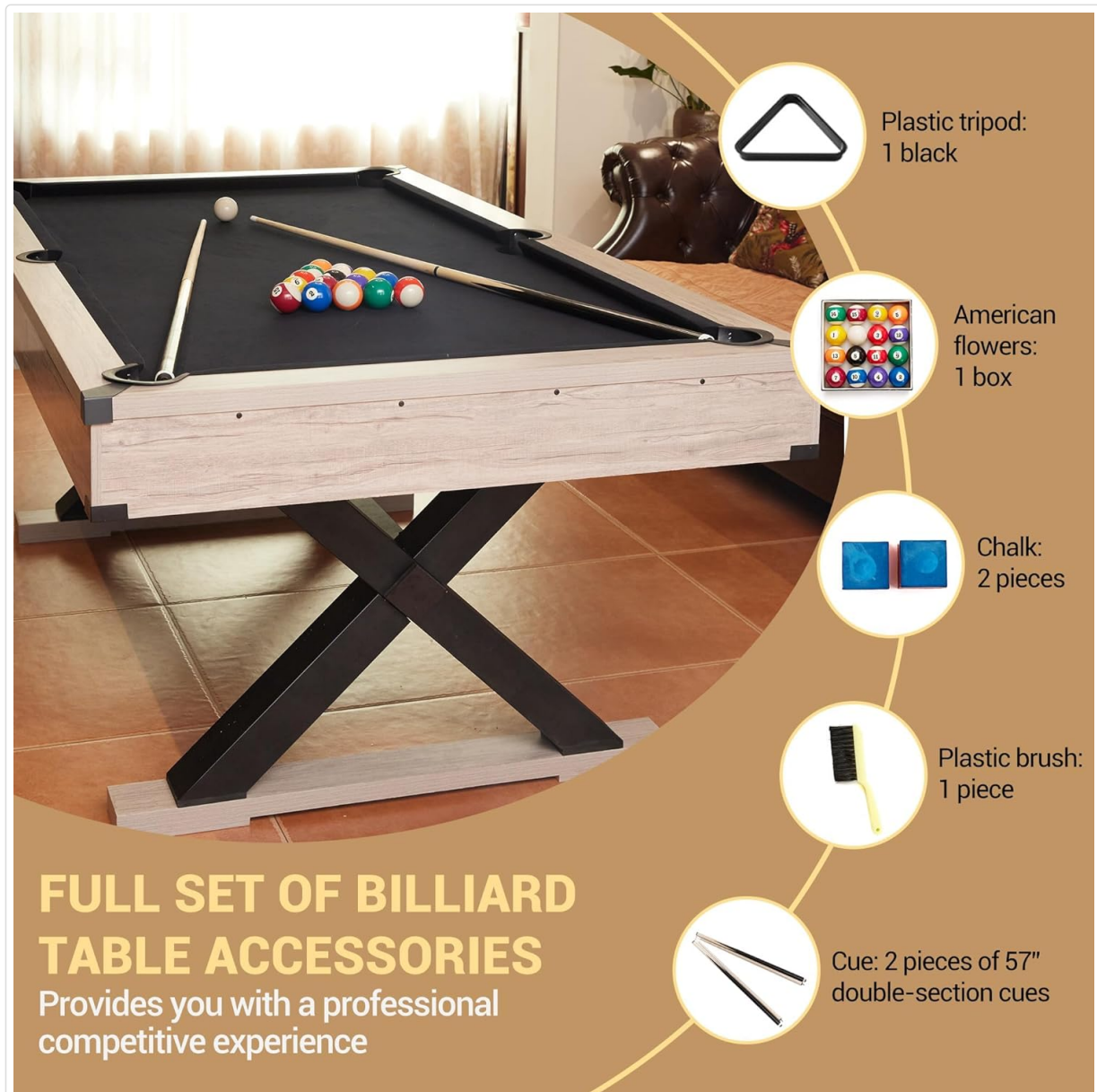
Image: Full set of billiard table accessories provided with the GarveeLife 7 FT Pool Table.