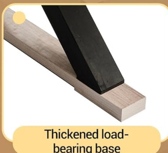
Thickened load- bearing base