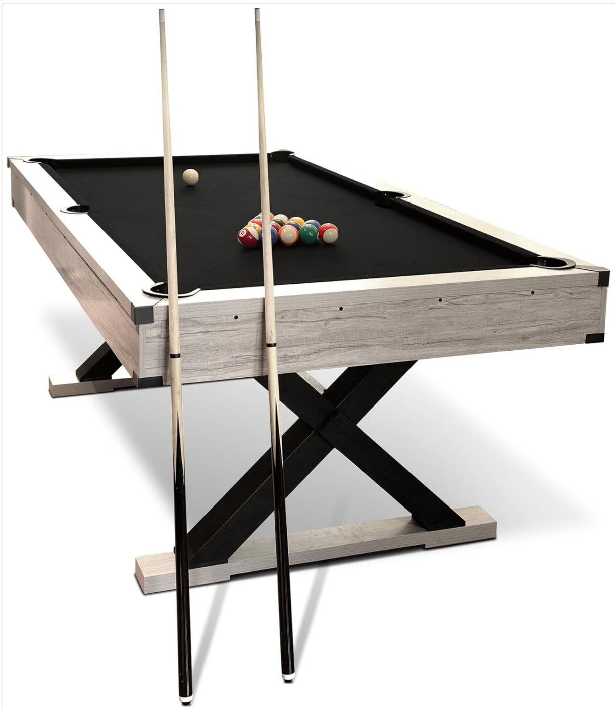
Image: GarveeLife 7 FT Pool Table set up for play.