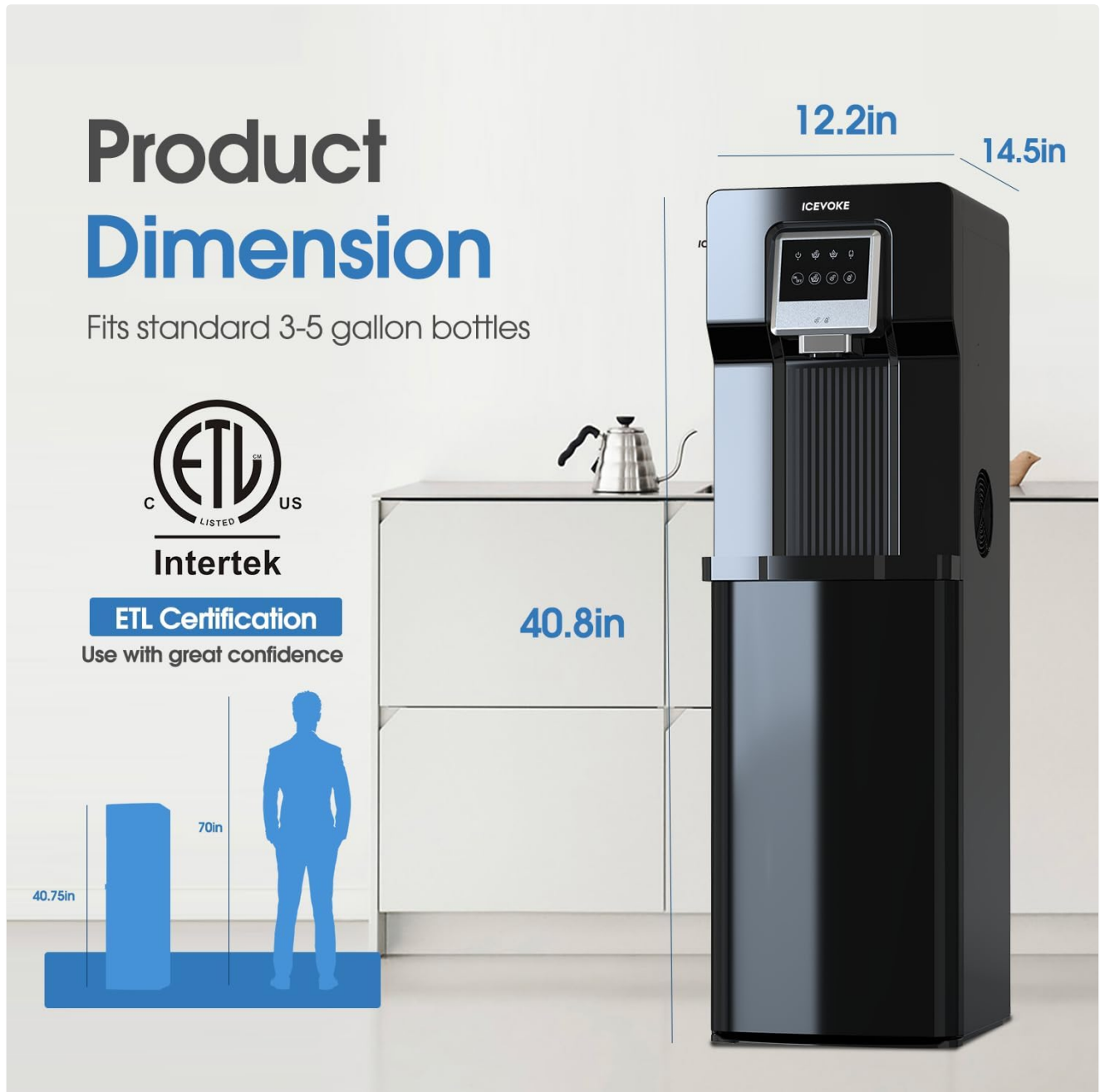
Image 1: Product dimensions and ETL certification. The dispenser is 14.5 inches deep, 12.2 inches wide, and 40.8 inches high, suitable for 3-5 gallon bottles.

The dispenser measures 14.5 inches (D) x 12.2 inches (W) x 40.8 inches (H) and is designed to fit standard 3 or 5-gallon water bottles.