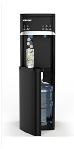
Image 9: The removable drip tray for easy cleaning and maintenance.