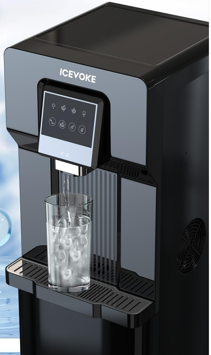
Image 2: Visual representation of the dispenser's functions: cold water (14°F), ice making, and room temperature water. Note: No hot water function.