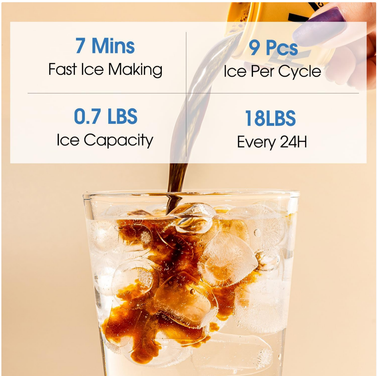
Image 3: Details on ice making: 7 minutes for fast ice, 9 pieces per cycle, 0.7 lbs ice capacity, and 18 lbs daily production.