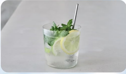
Cold Water (14°F)