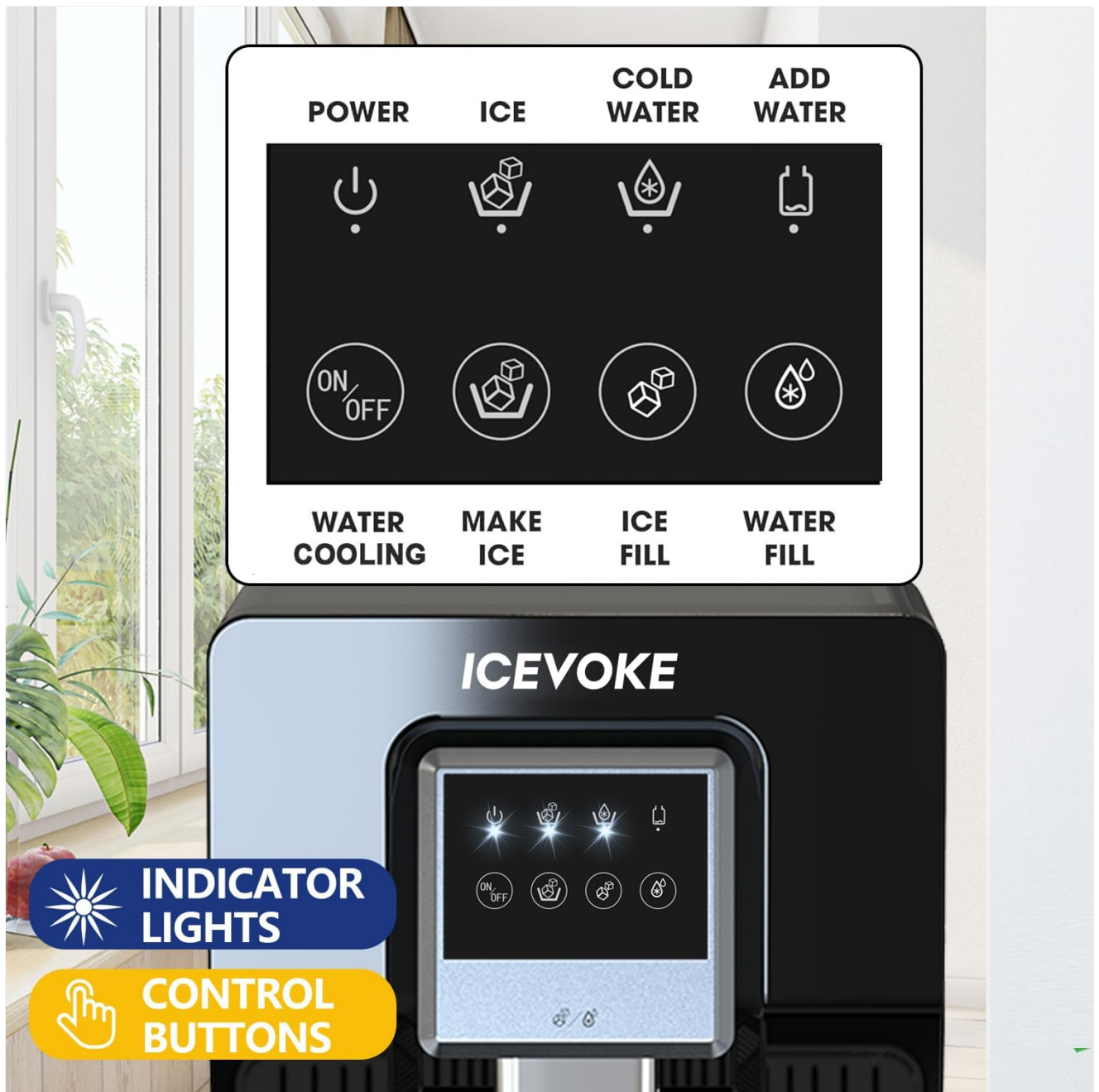
Image 5: Close-up of the control panel showing indicator lights and control buttons for power, ice, cold water, and add water.