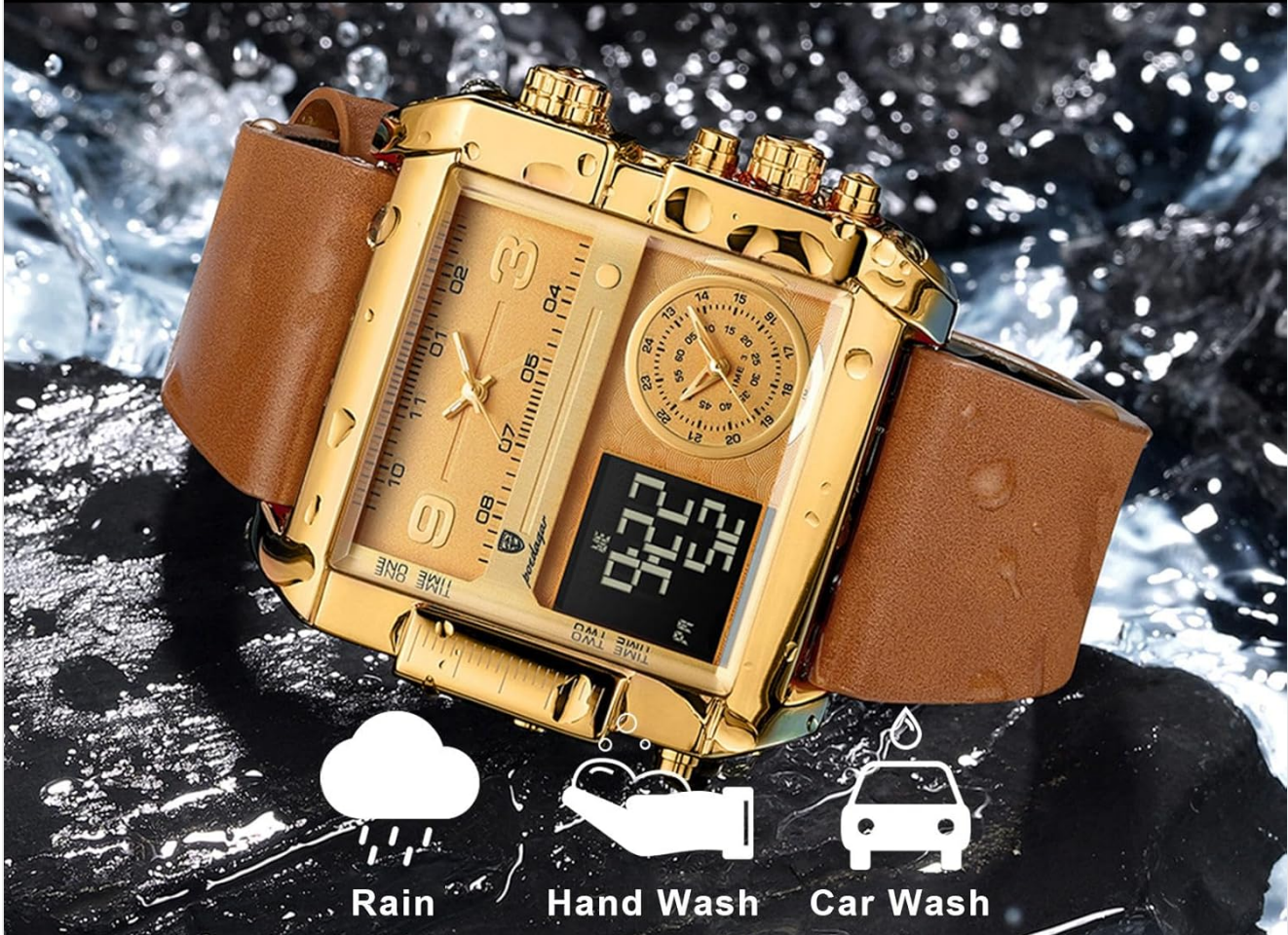
Figure 4: Water resistance demonstration of the Poedagar 997 watch. The image depicts the watch partially submerged in water, illustrating its 3ATM water resistance suitable for splashes and hand washing. Icons for rain, hand wash, and car wash are shown.

Nano-level sealed water release, Precise waterproof performance, Innovation and enhancement of anti-fog.