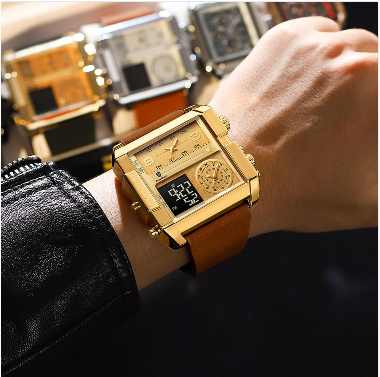
Figure 2: Poedagar 997 watch worn on a wrist. This image shows the watch from a side angle while being worn, highlighting its profile, the texture of the leather strap, and the placement of the crowns and pushers on the side of the case.