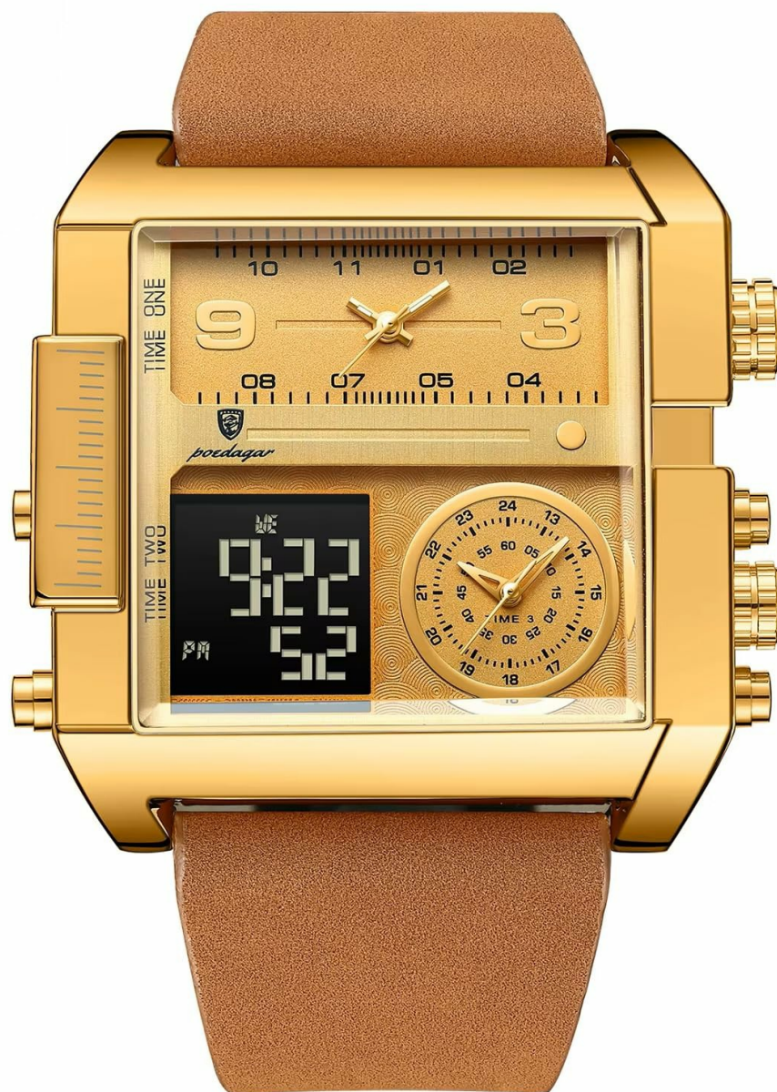
Figure 1: Poedagar 997 Chronograph Watch. This image displays the Poedagar 997 watch with its distinctive square gold-tone case, brown leather strap, and both analog and digital time displays. The watch features multiple crowns and pushers for its various functions.