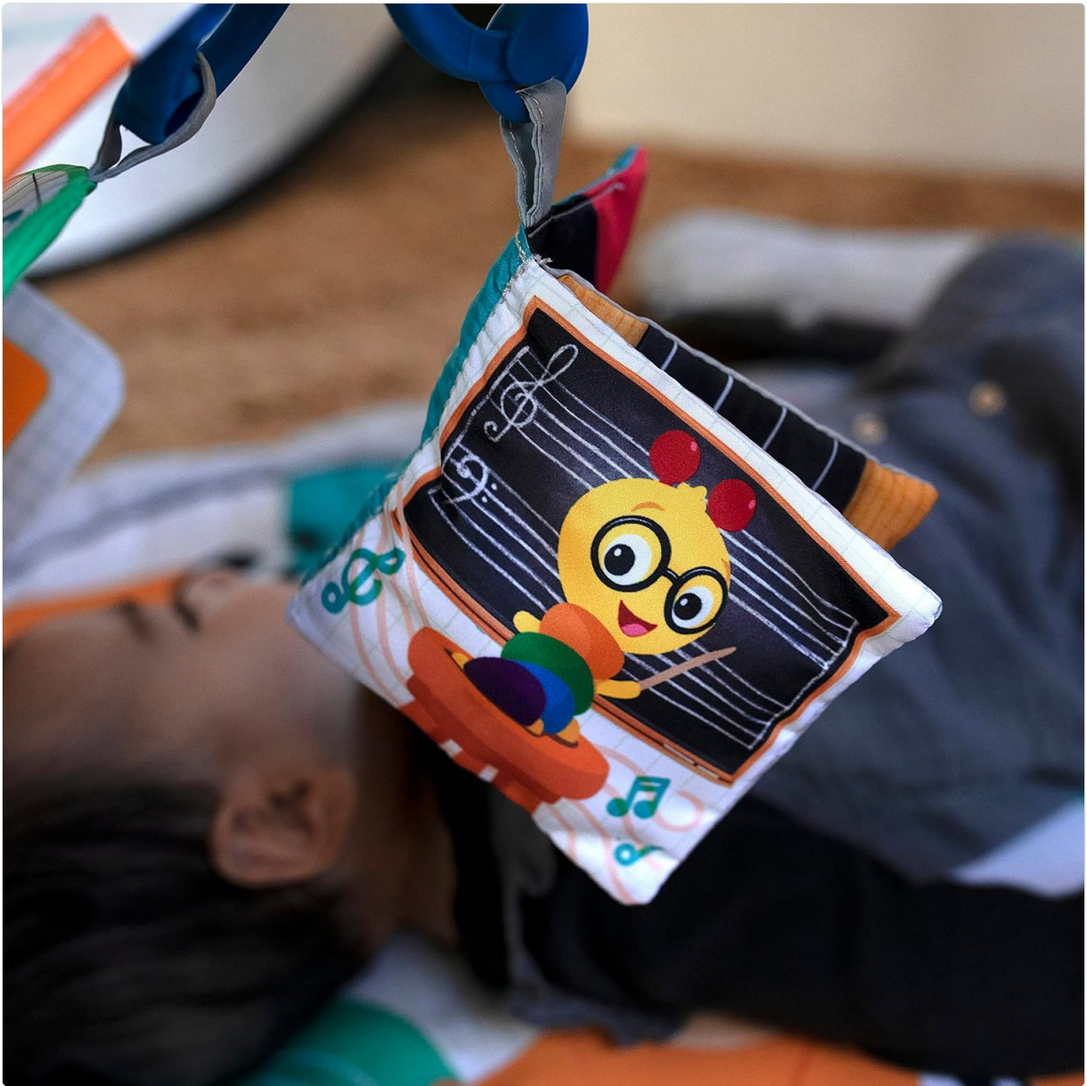
Figure 12: A textured music note toy, offering tactile exploration.