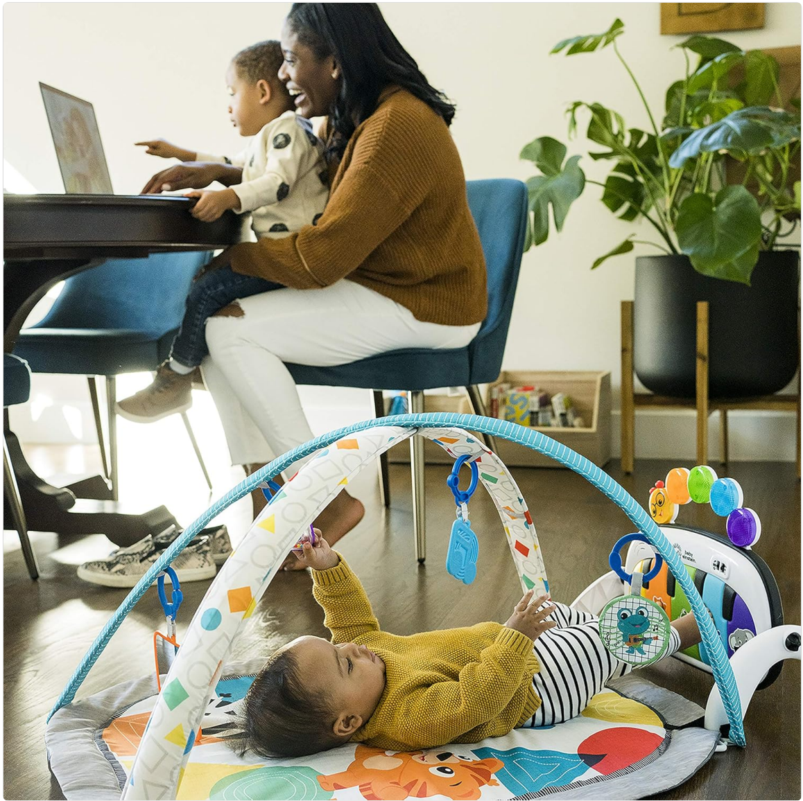
Figure 5: The piano can be rotated for comfortable seated play as your child develops.