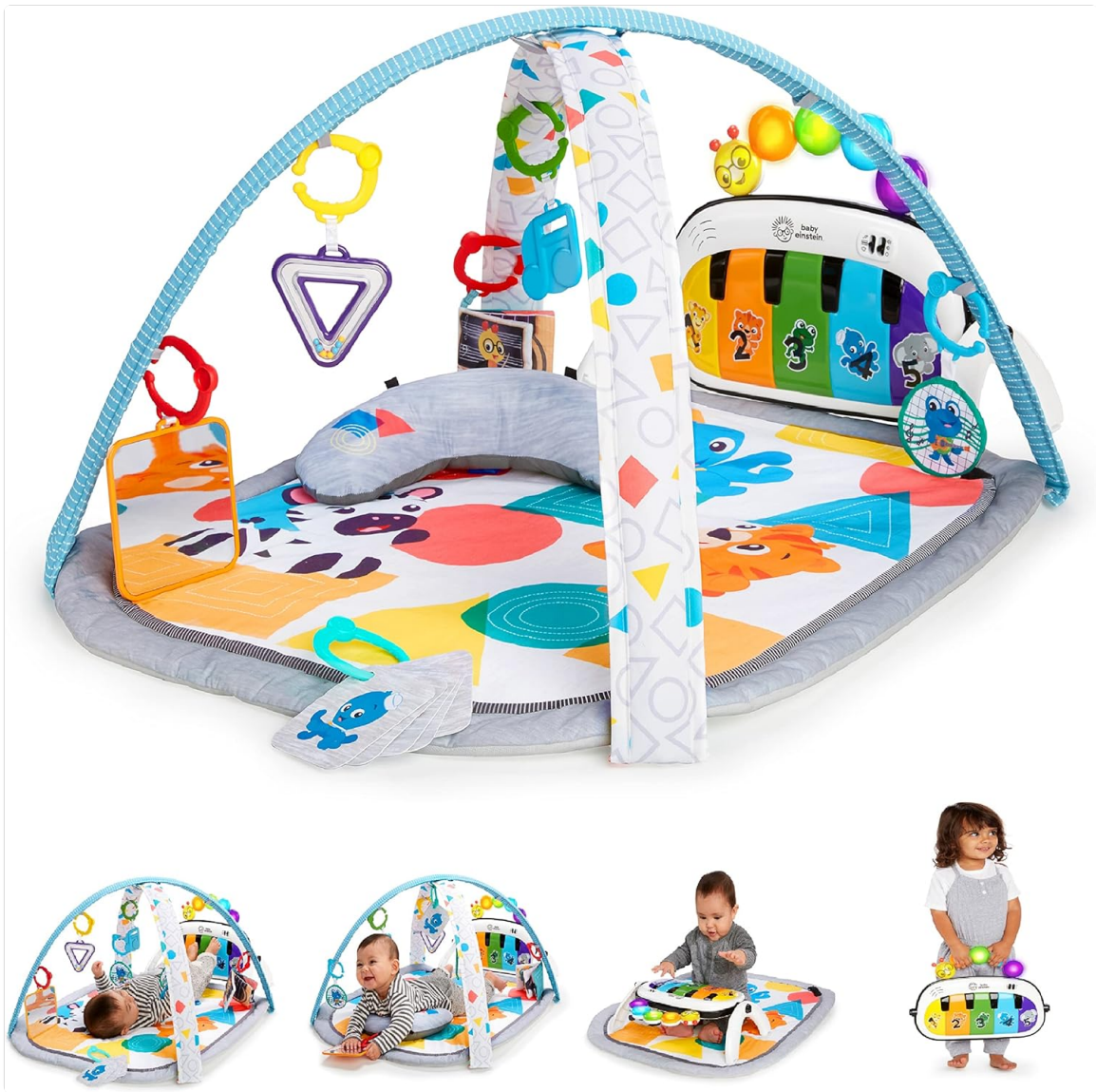
Figure 3: Baby engaging in Lay and Play mode, interacting with the piano using their feet.