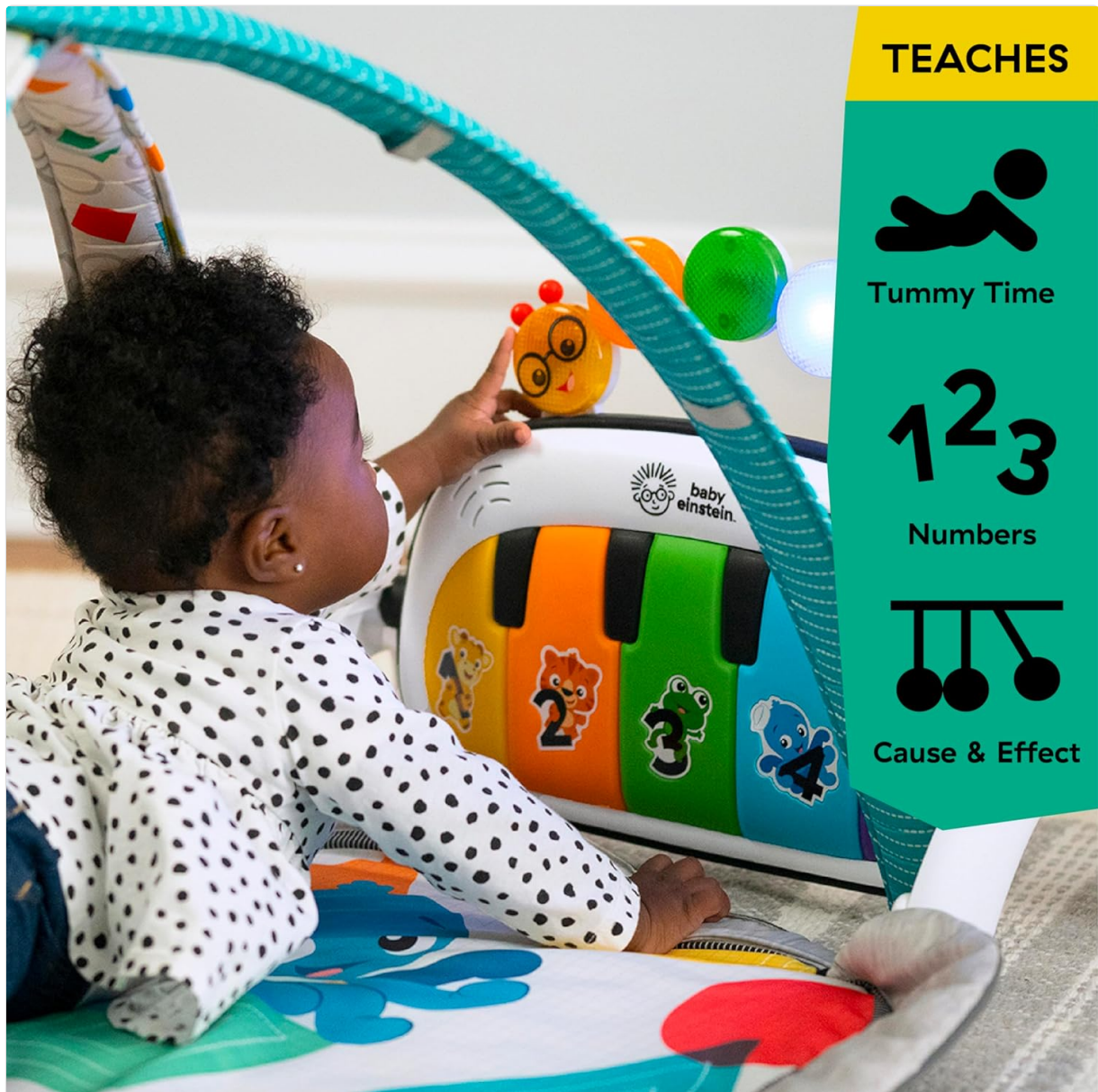
Figure 1: Overview of the playmat with its 7 detachable sensory toys, including a textured music note, baby-safe mirror, flash cards, crinkle toy, rattle, and soft book.