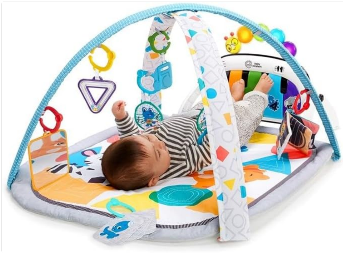
Figure 15: A soft book toy with engaging illustrations for early visual stimulation.