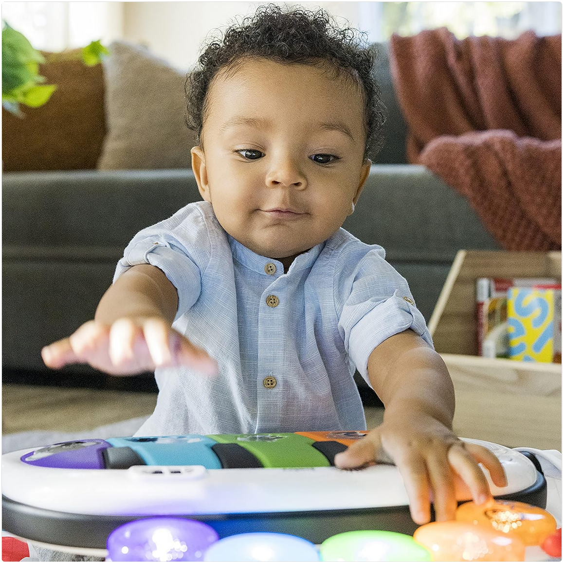
Figure 8: The piano promotes language development in four different languages.