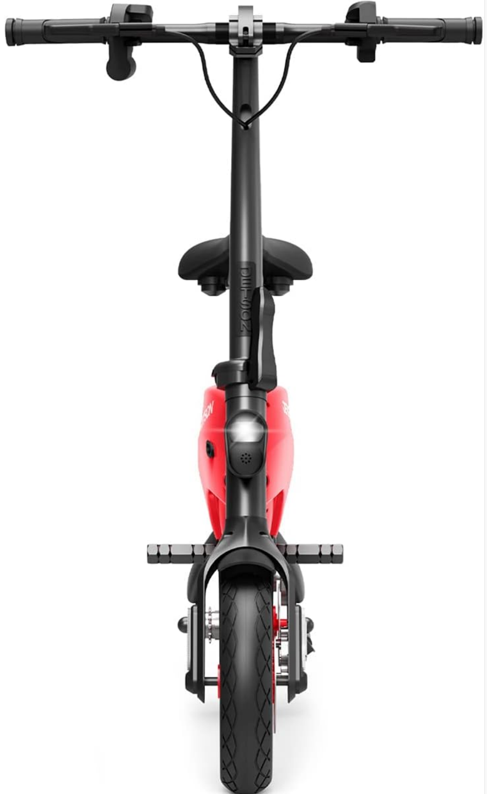
Image: A close-up of the front of the Jetson LX10, showing the integrated LED headlight.