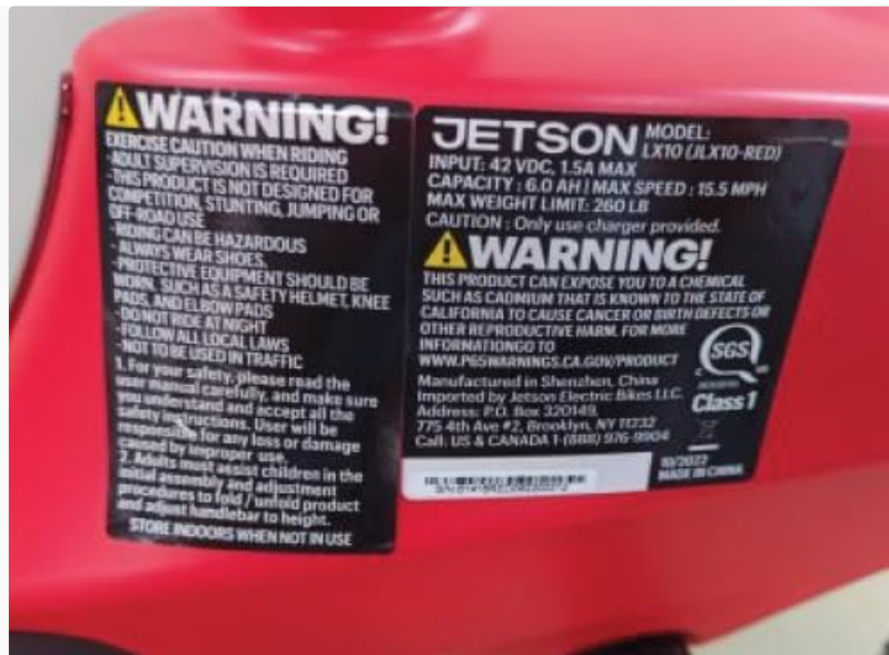
Image: Warning label on the Jetson LX10 Folding Ride-On, detailing safety precautions and Proposition 65 warning.