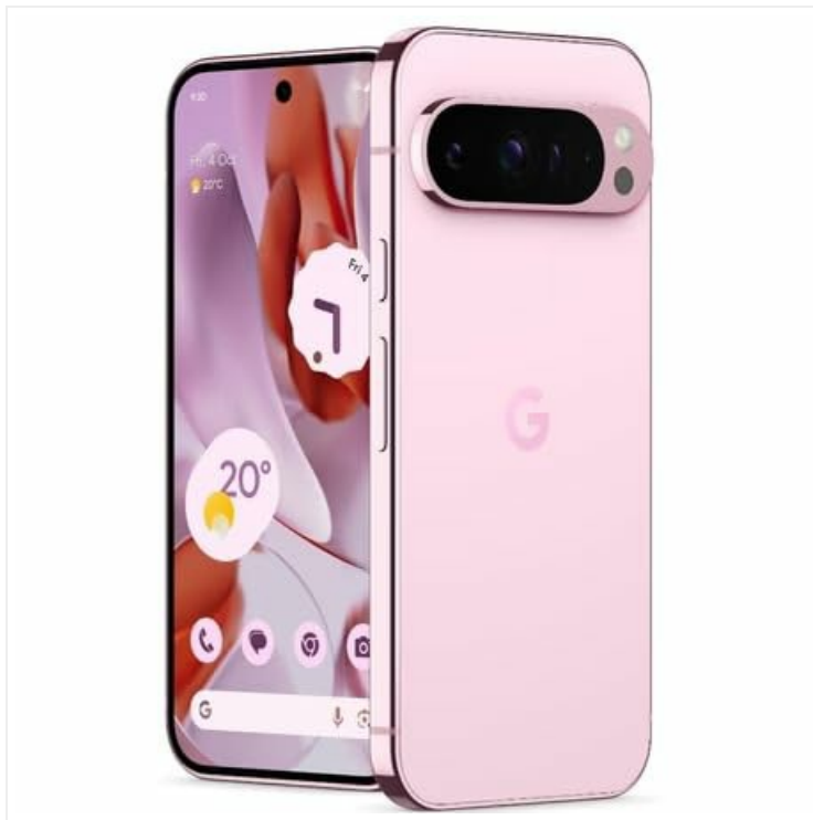
Figure 3: Power and volume buttons on the side of the device.