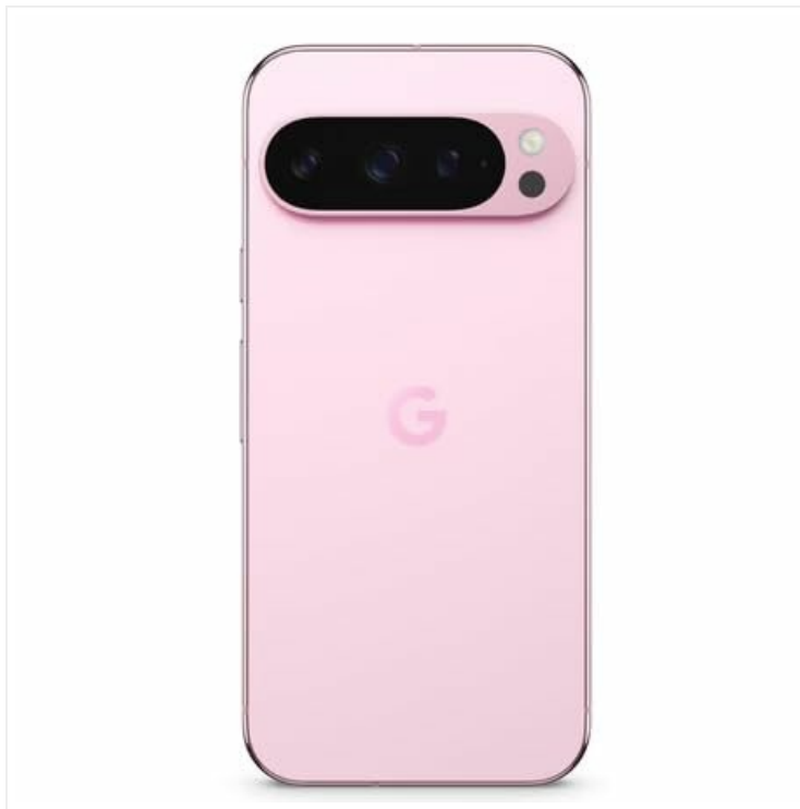
Figure 4: Rear camera system of the Pixel 9 Pro.