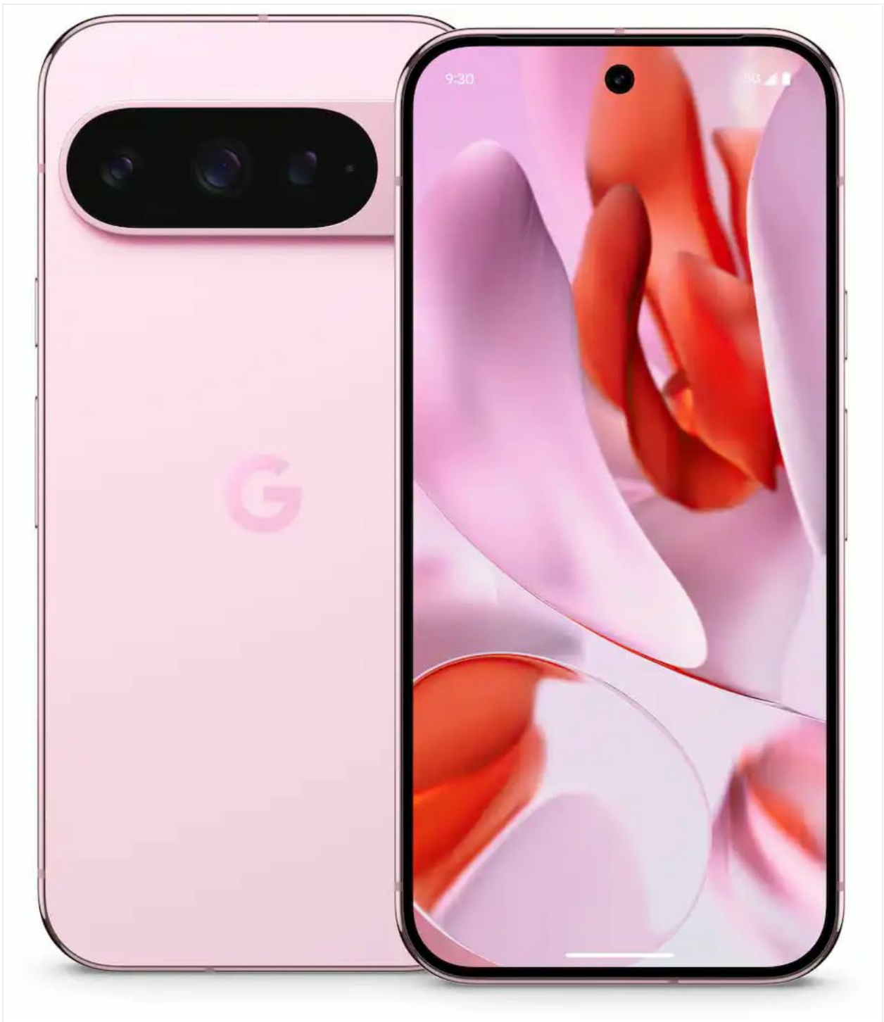
Figure 1: Front view of the Google Pixel 9 Pro 5G.