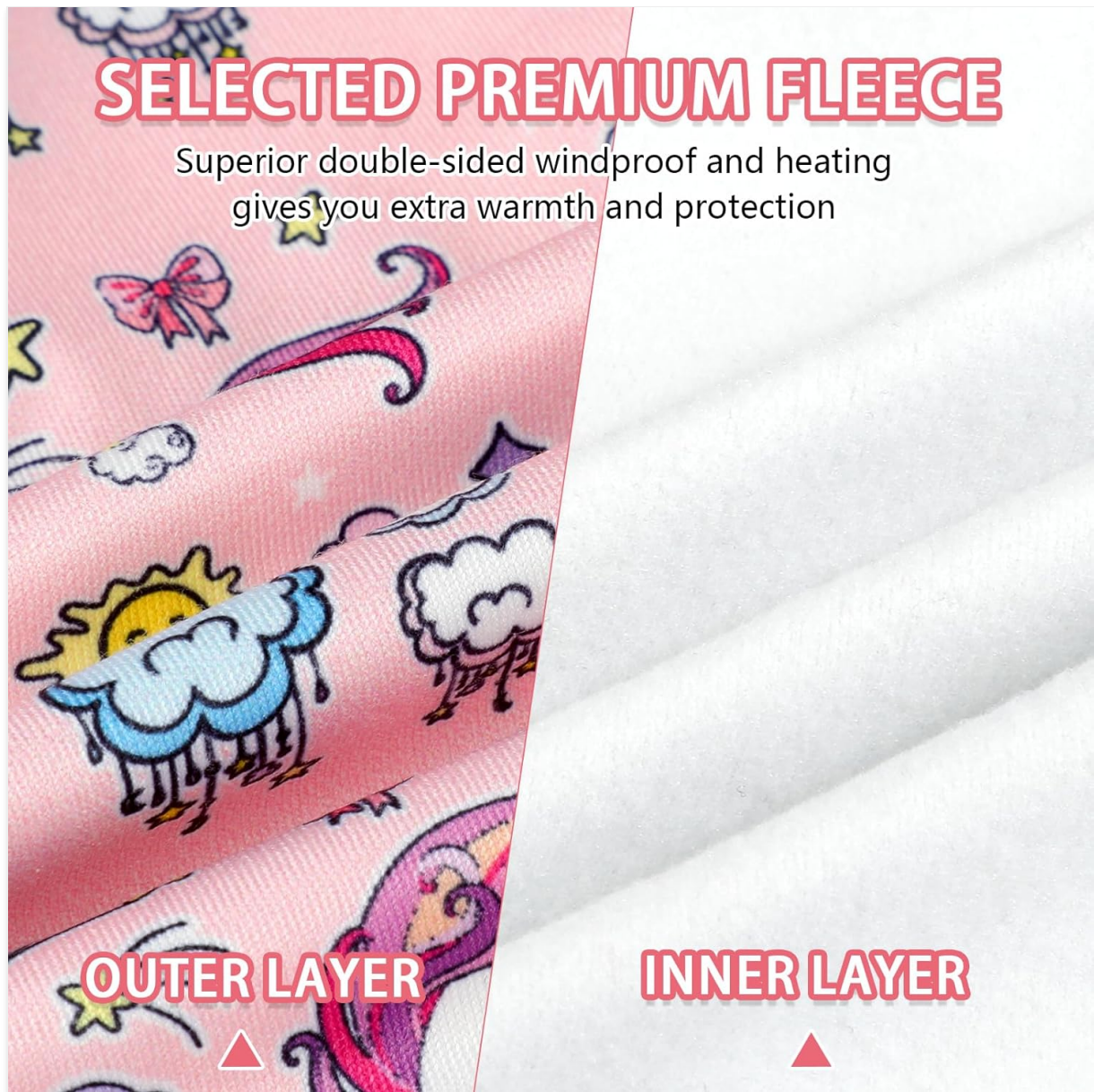
Image 2: Illustration of the balaclava's material composition, highlighting the outer layer with a cartoon design and the soft, premium fleece inner layer for warmth and wind protection.

Superior double-sided windproof and heating gives you extra warmth and protection