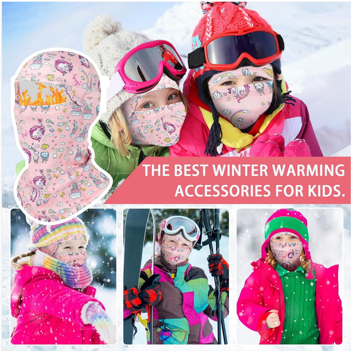
Image 4: Examples of the balaclava's multifunctional use, illustrating various wearing styles.