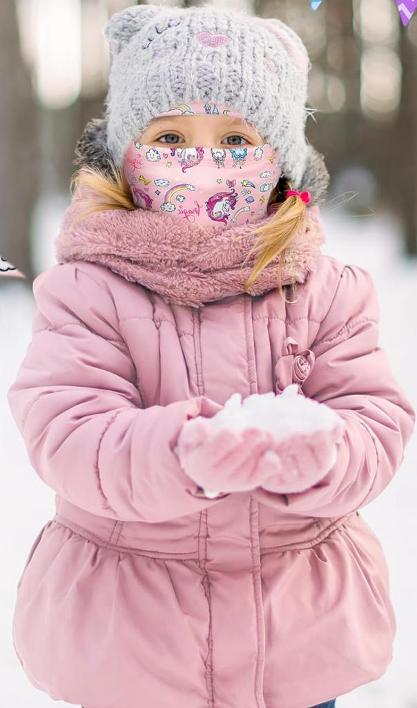
Image 5: The balaclava providing protection for a child in cold weather, highlighting its soft, thermal, windproof, and comfortable properties.