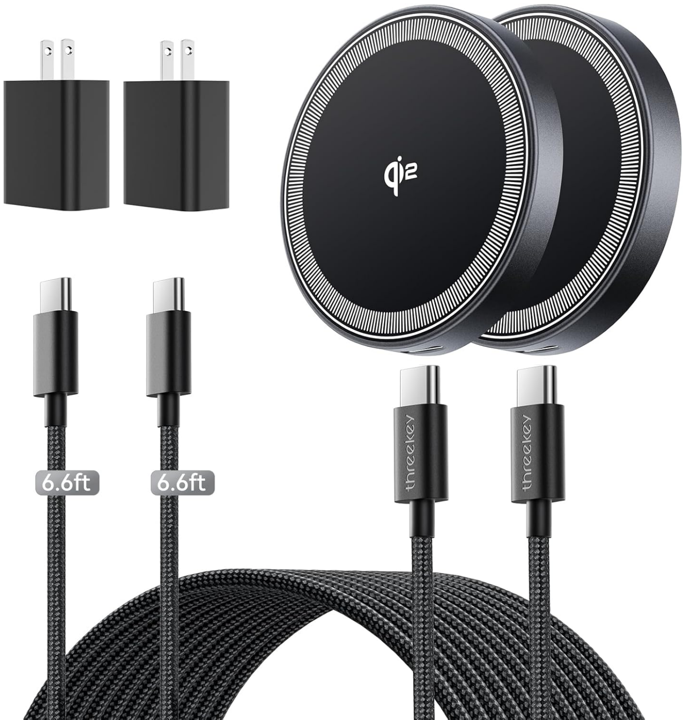
Image: Contents of the package, including two charging pads, two cables, and two adapters.