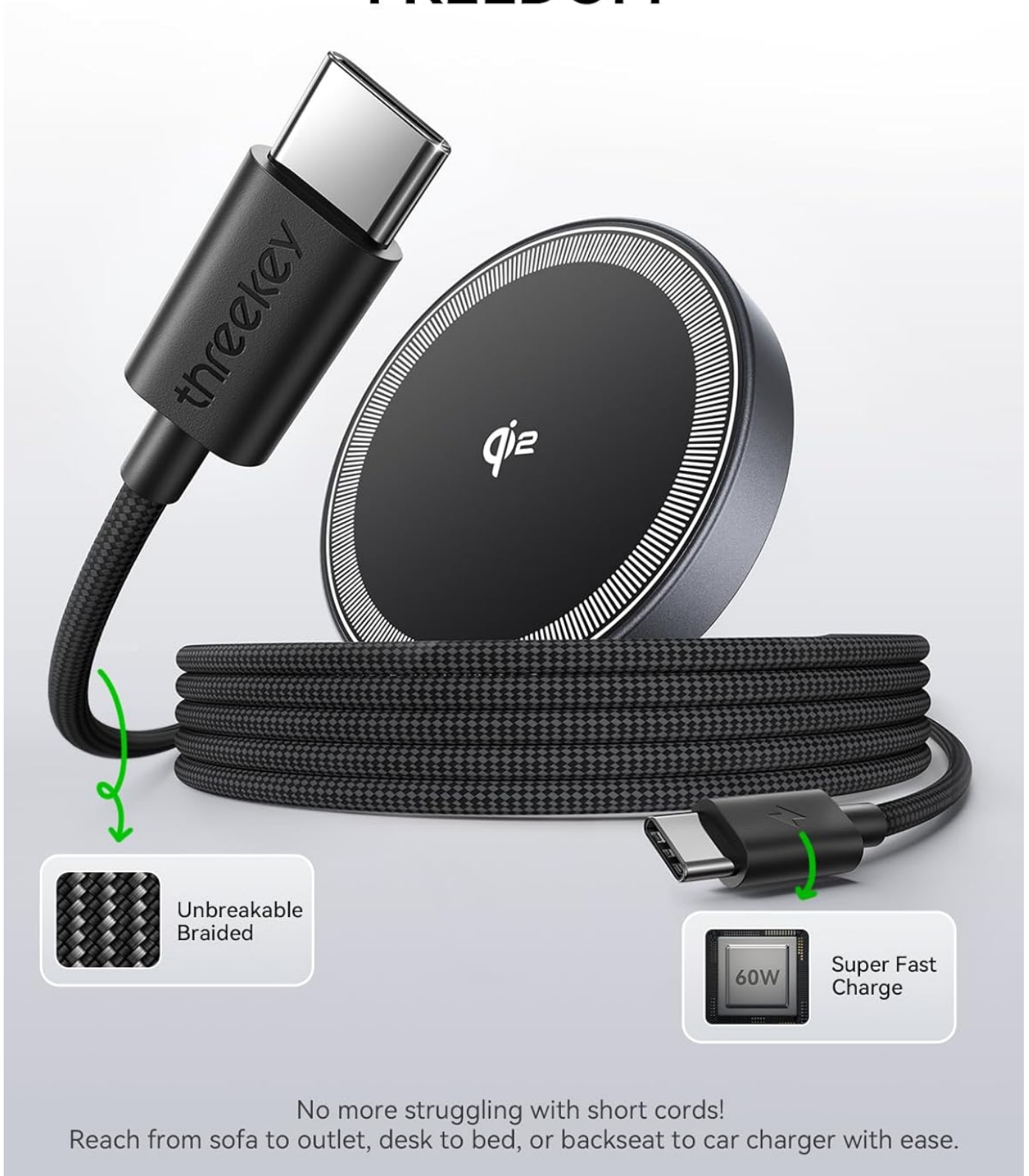
Image: A close-up of the charging pad and its braided USB-C cable, ready for connection.