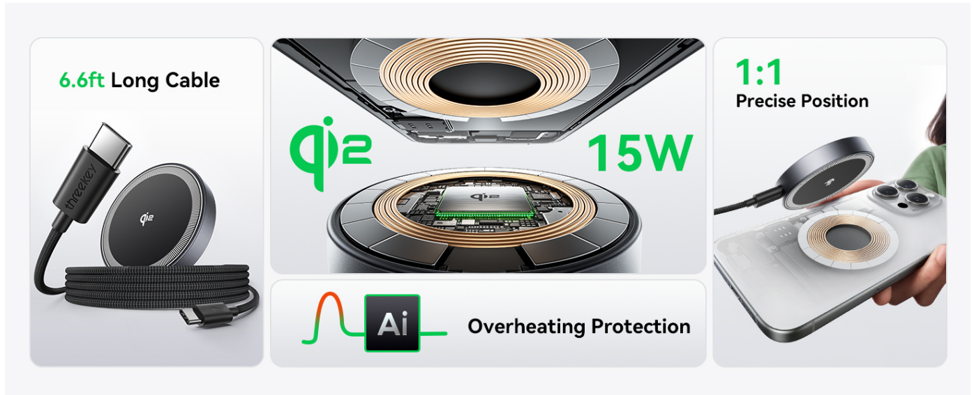
Image: Visual representation of the 6.6ft braided USB-C cable, emphasizing its length and durability.

The extra-long 6.6ft braided USB Type-C to C cable provides extended reach, allowing you to comfortably use your phone while it charges from various locations such as your bedside, sofa, or desk.