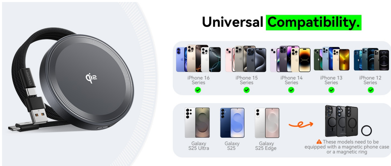
Image: Visual guide to compatible devices, including iPhones, Android phones, and AirPods.

Note: For Samsung Galaxy, Google Pixel, and LG devices, a MagSafe-compatible case or magnetic ring is required for optimal magnetic alignment and charging.