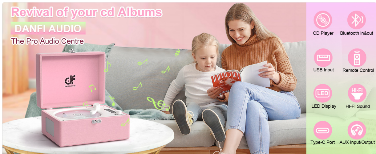
Figure 5: Transmitting CD audio to Bluetooth headphones or an external Bluetooth speaker.