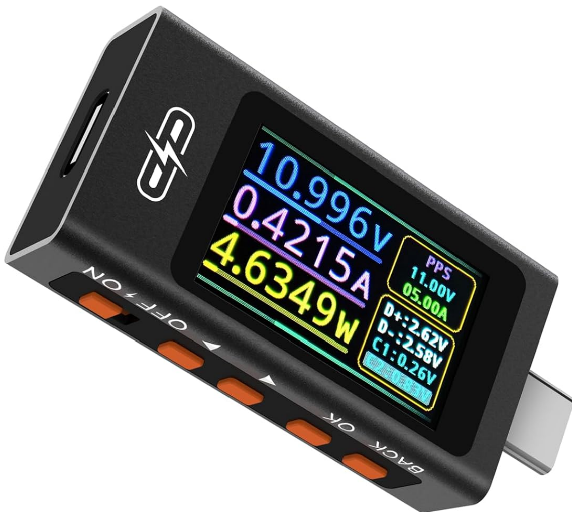
Image 3.1: Front view of the UT01C USB Tester, highlighting the display and control buttons.