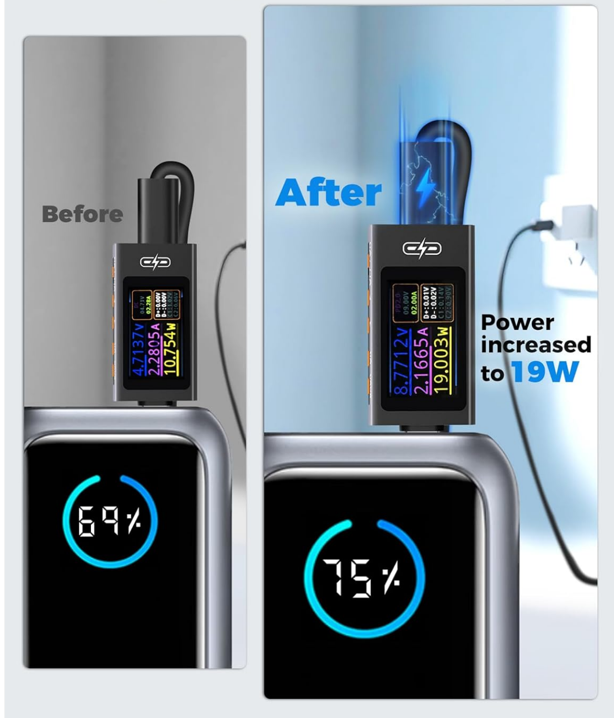
Image 5.3: Illustration of protocol deception increasing charging power.

Test cable compatibility and unlock hidden fast charging gears