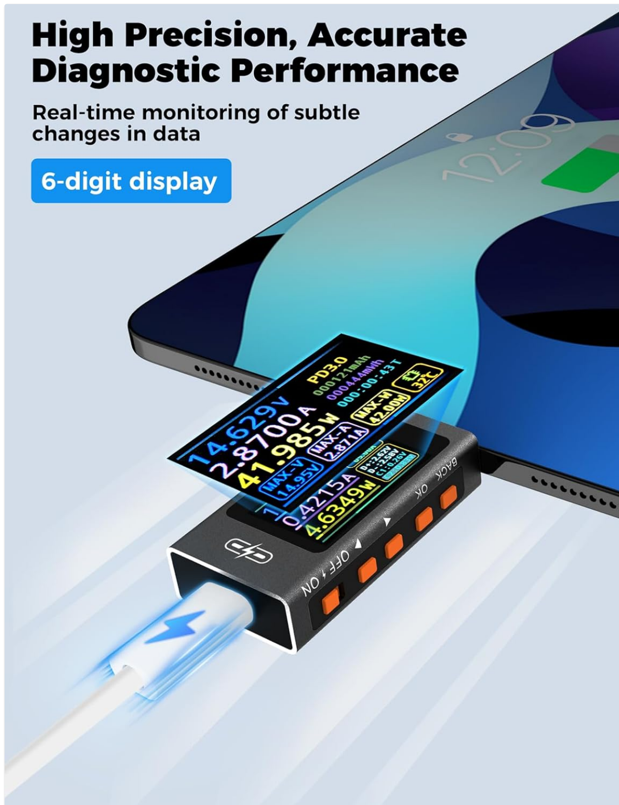
Image 5.1: The UT01C display showing high-precision diagnostic data.