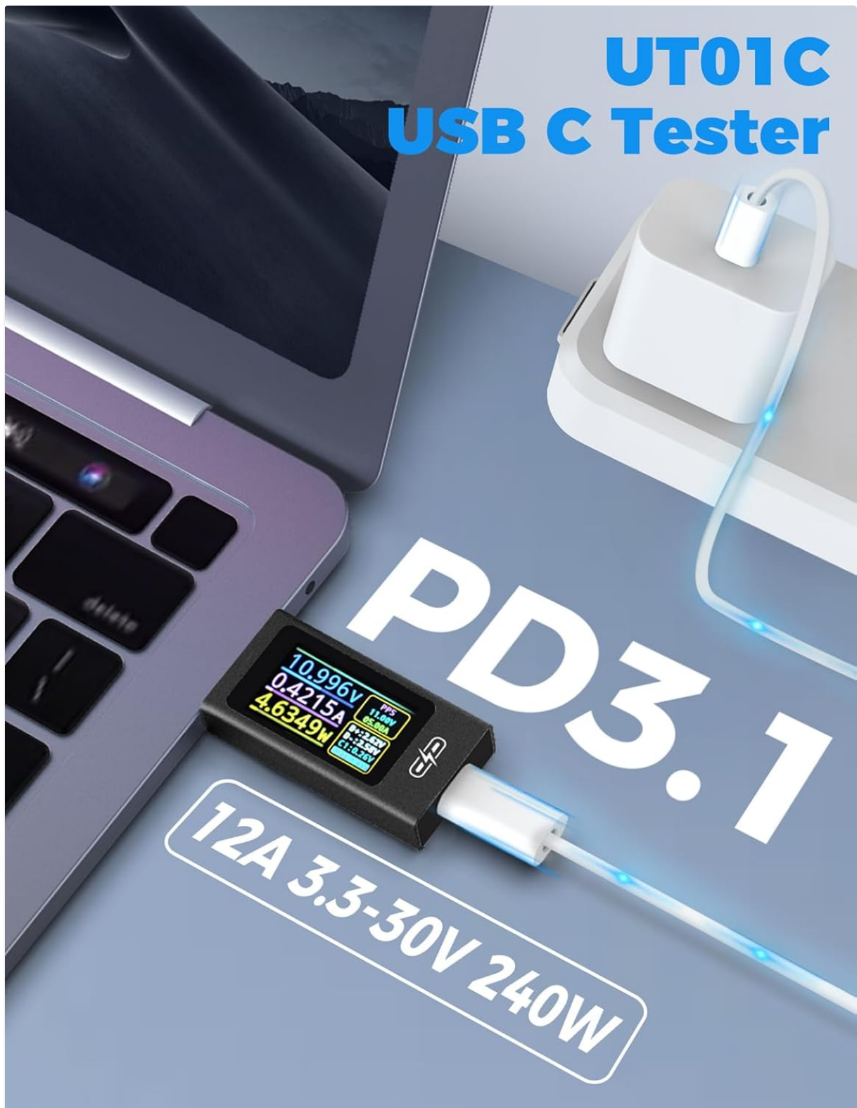
Image 1.1: The UT01C USB Tester in use, connected between a laptop and a power source, displaying charging parameters.