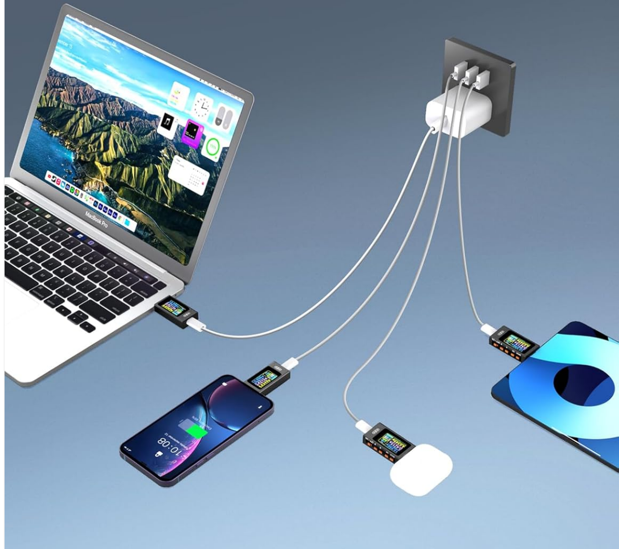
Image 5.5: Testing multiple cables and devices with E-Marker detection.

Test the performance of different cables and play with fast charging