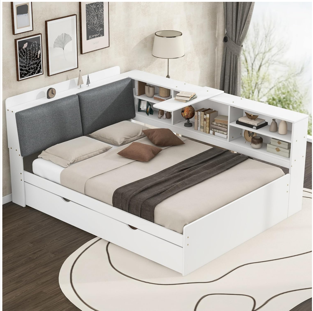
Figure 5.2: The bed frame with the trundle closed, highlighting the integrated storage shelves and upholstered backrest of the headboard.