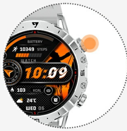
Classic Feel, Modern Control