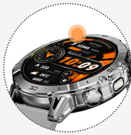
Tough Glass, Sharp Response, Always Visible