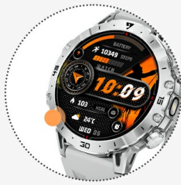
Confidence in Every Detail You Wear