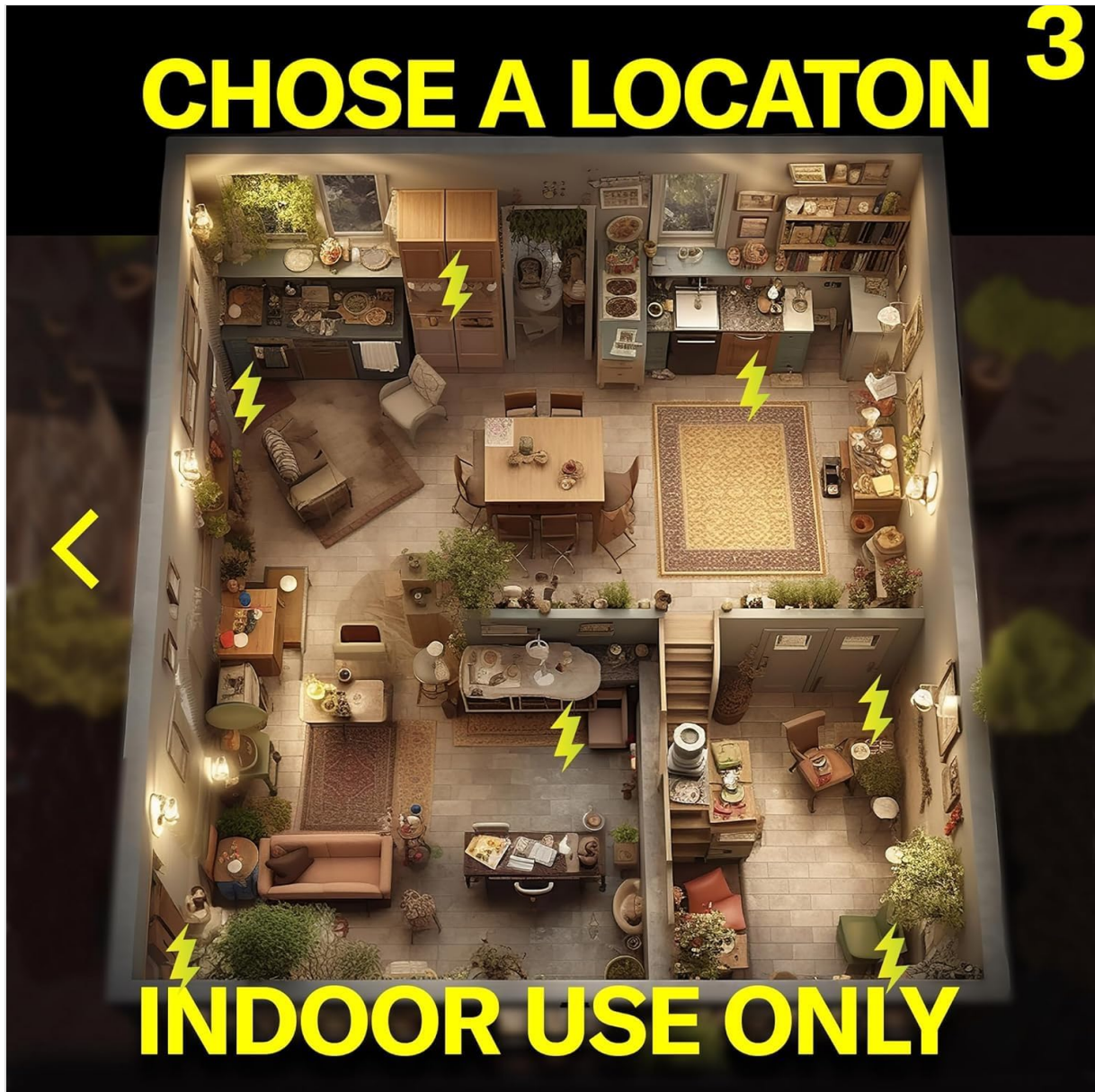
Image 5.2: An overhead view of a house interior with lightning bolt icons indicating suitable indoor placement locations for the ZAPPTRONIX Zapper, emphasizing 'INDOOR USE ONLY'.