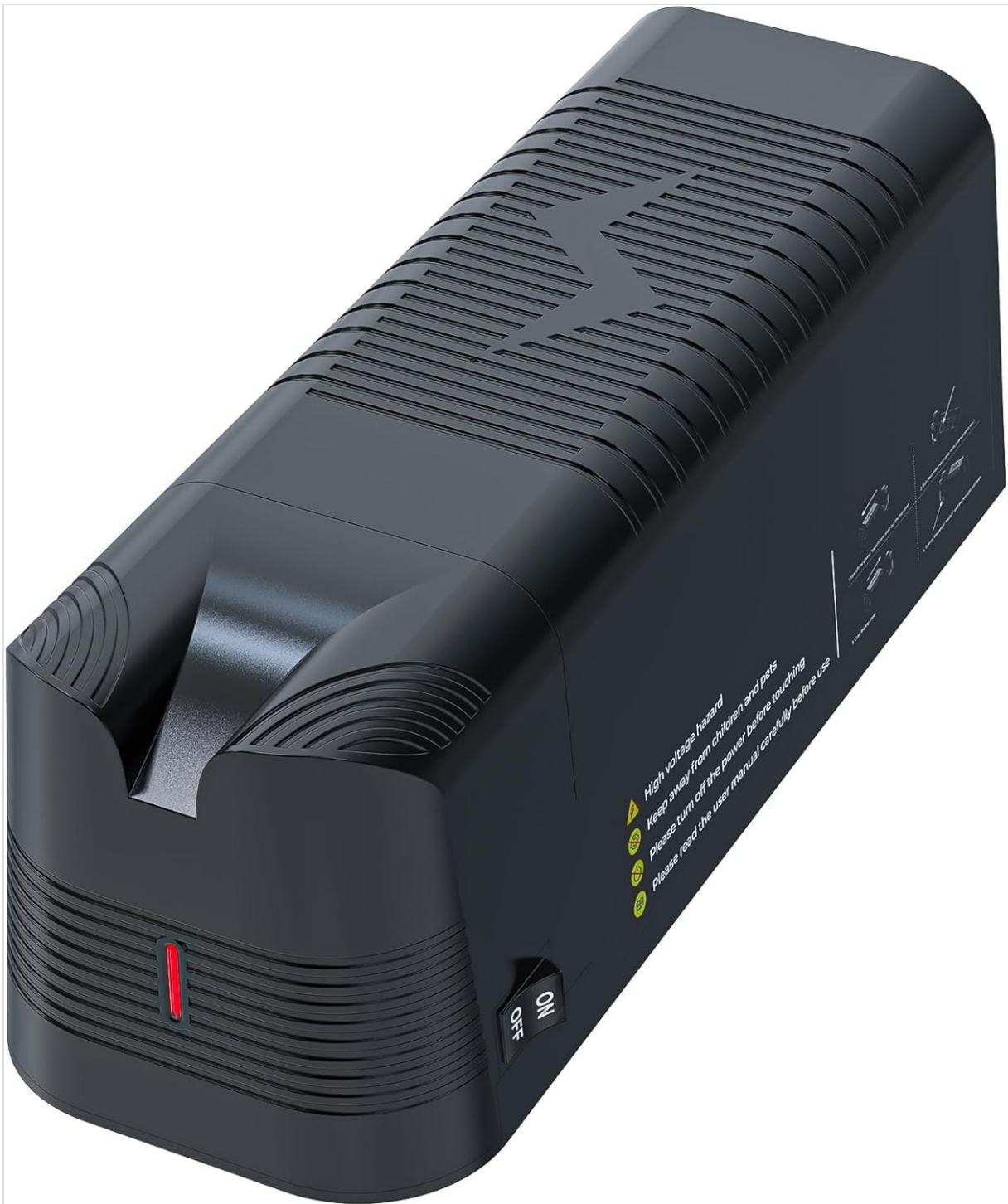
Image 1.1: The ZAPPTRONIX Electronic Rat and Mouse Zapper, a black rectangular device with an entry tunnel and an ON/OFF switch on the side.