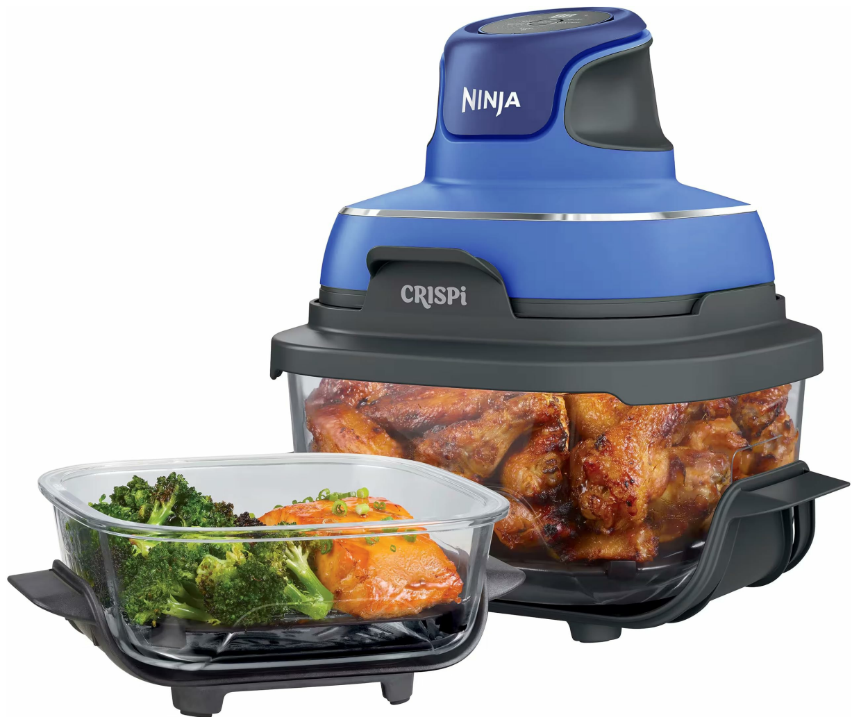
Image: The Ninja Crispi Air Fryer in use, showcasing a whole chicken and vegetables in the 4-quart glass container, ready to be served directly on a dining table. A smaller container with food is also visible.